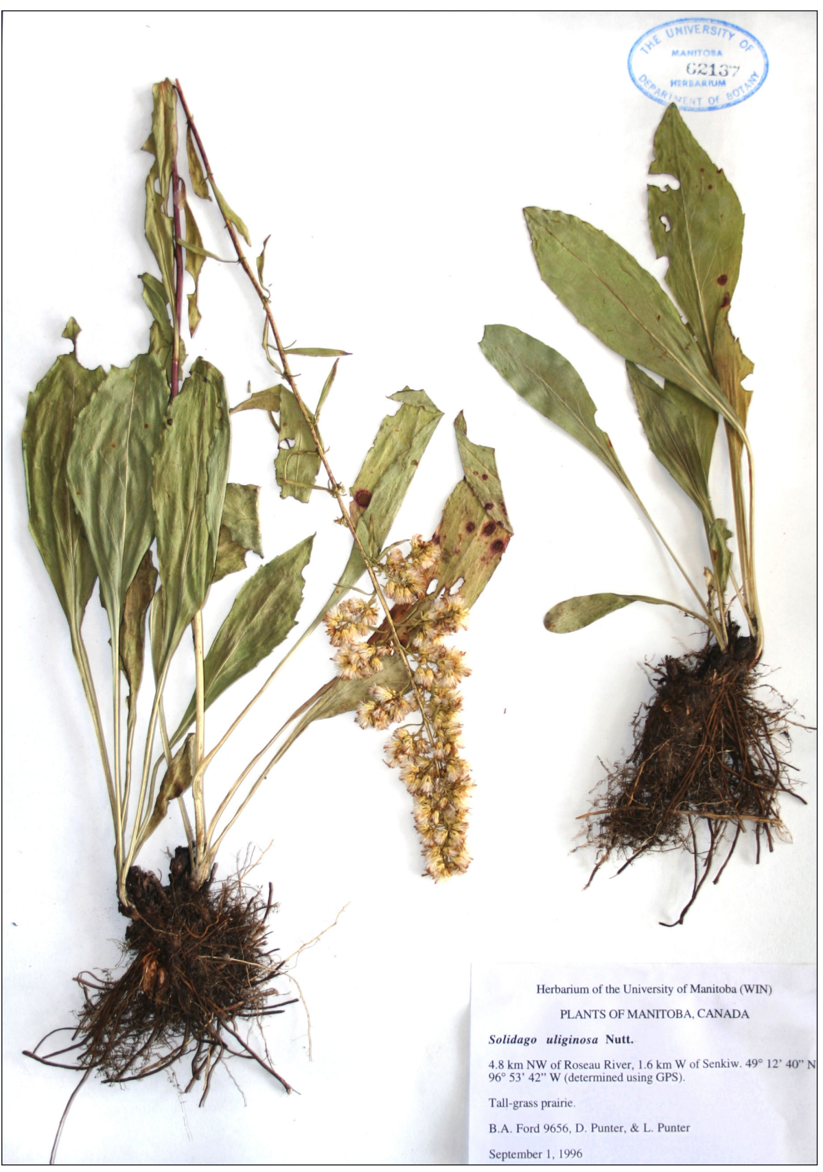
Figure 1. Solidago jejunifolia voucher (Ford, Punter, & Punter 9656, WIN).