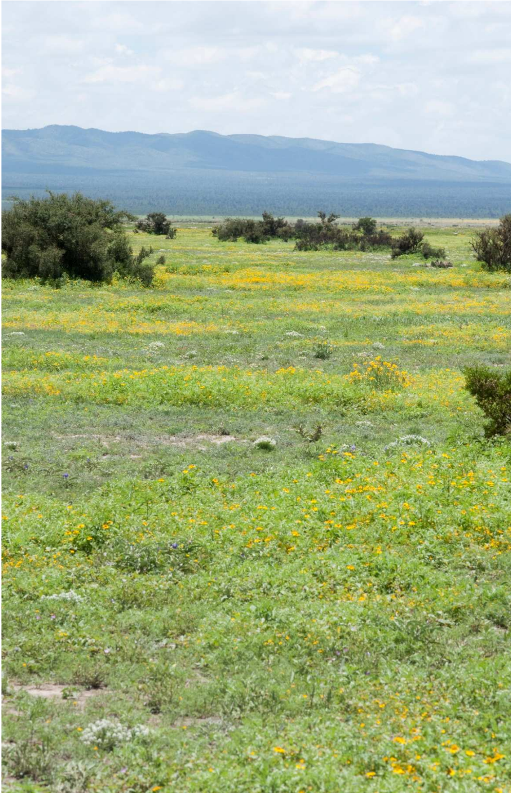
Figure 5. Habitat of Plateilema palmeri at 14560 collection site, looking east from edge of Coahuila into Nuevo Leon, Mexico. Shrubs are mostly Koeberlinia and Larrea ; yellow flowers are mostly Heliopsis .