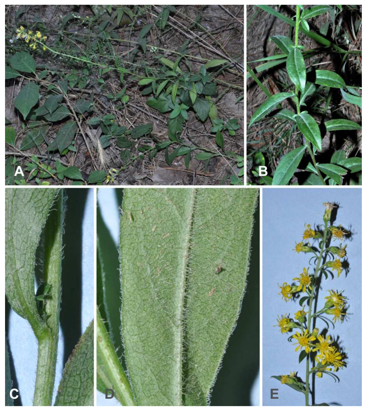
Figure 5. Solidago porteri morphology, Tennessee ( Semple et al. 11861 ). A. Shoots. B. Mid stem leaves. C. Mid stem detail. D. Mid stem leaf detail, abaxial surface E. Inflorescence.