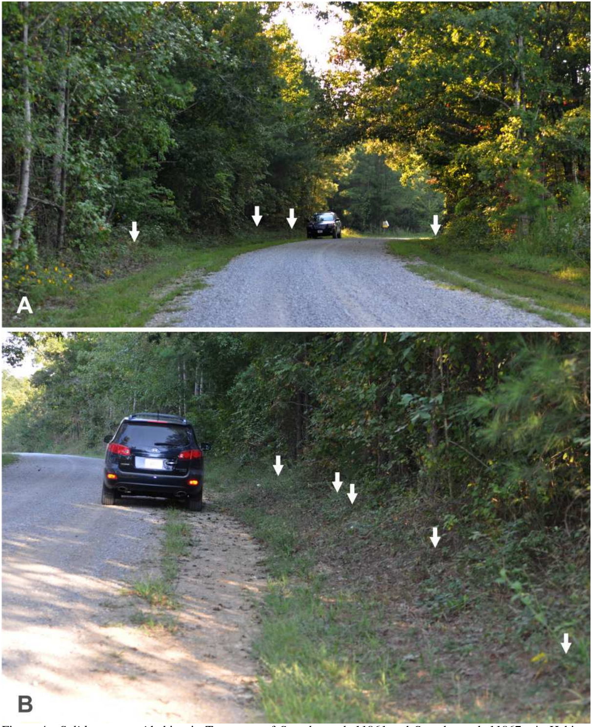
Figure 4. Solidago porteri habitat in Tennessee of Semple et al. 11861 and Semple et al. 11867 . A. Habitat looking north. B. Habitat looking south along west side of road. Locations of plants indicated by arrows.