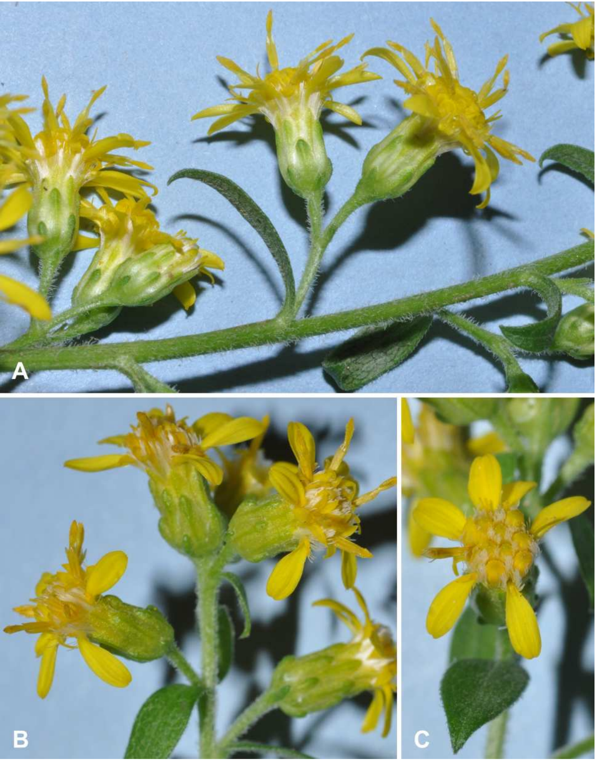
Figure 6. Solidago porteri floral morphology, Tennessee ( Semple et al. 11861 ). A. Part of an inflorescence. B. Heads showing involucres. C. Head showing rays; most disc florets not yet open.