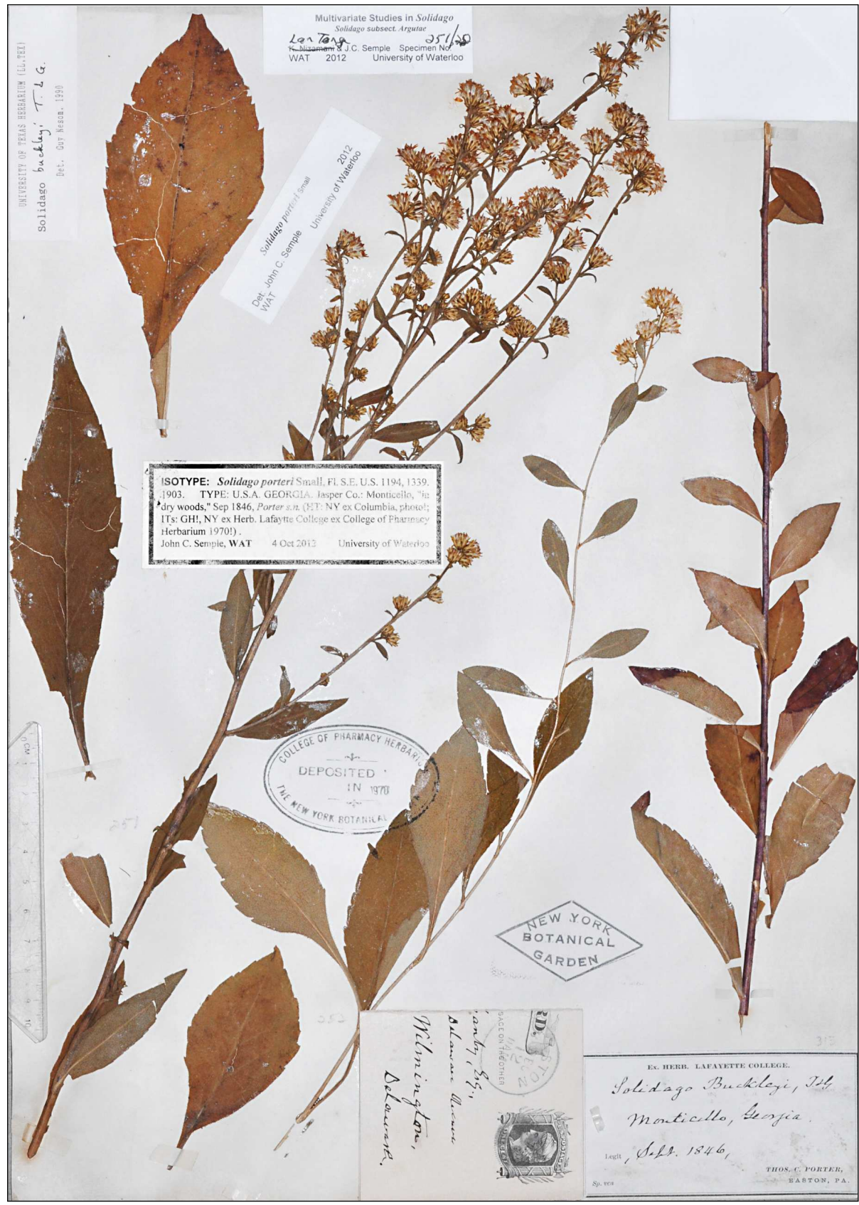
Figure 1. A previously unrecognized isotype of Solidago porteri Small, Porter s.n. (NY).