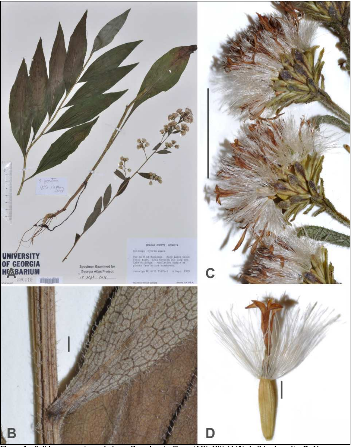
Figure 3. Solidago porteri morphology, Georgia. A. Shoot ( J.W. Hill 1162b-1 , GA, sheet 1). B. Upper stem and leaf surfaces ( J.W. Hill 1162b-1 , GA, sheet 2). C. Fruiting heads ( J.W. Hill 1162a , GA). D. Disc floret cypsela ( J.W. Hill 1162a , GA). Scale bar = 1 mm in B, D; = 1 cm in C.