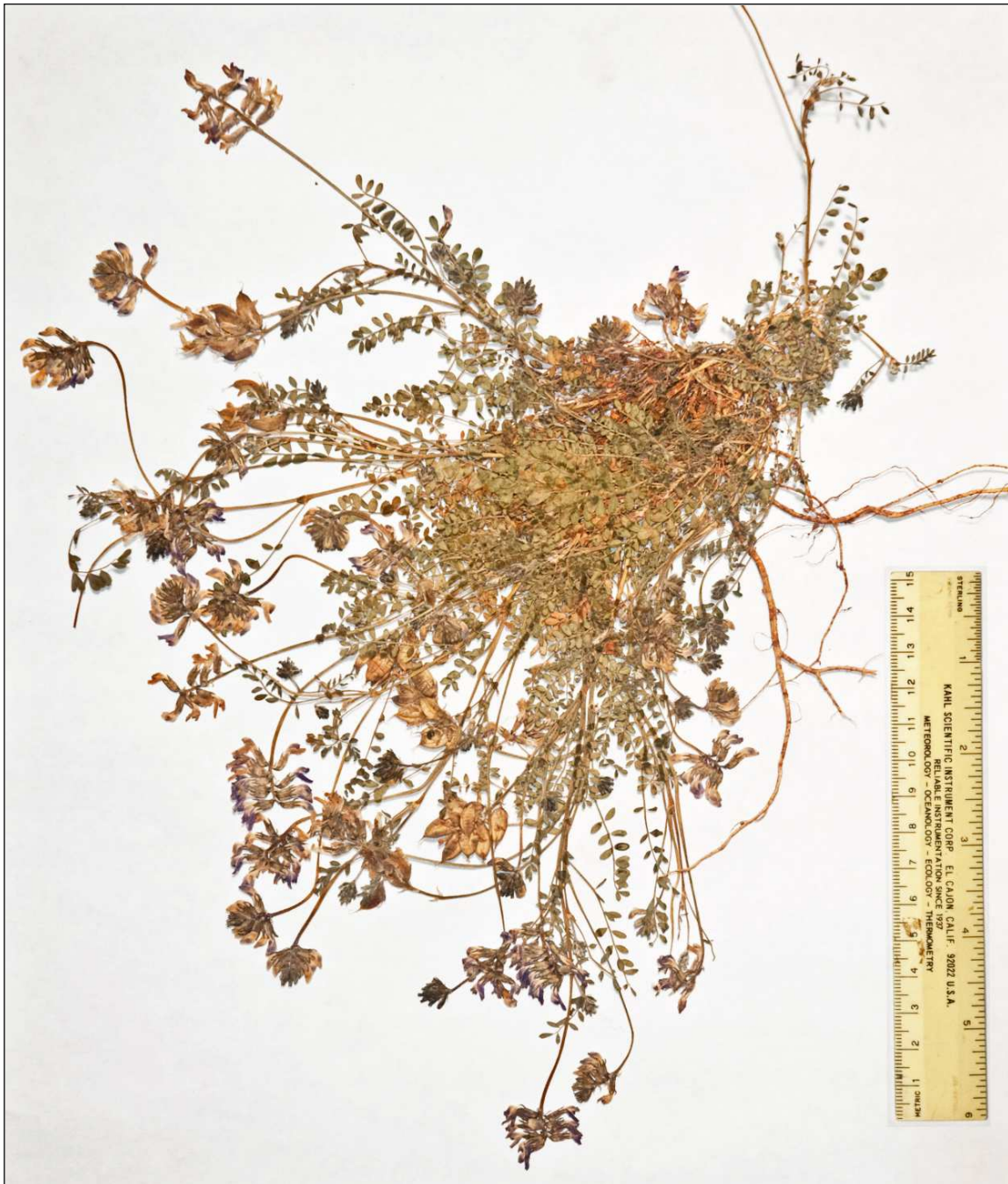
Figure 1. Holotype of Astragalus martinii (Reina-G. 97-458 et al., ARIZ).

Quercus arizonica . Most of the paratypes are from flatter areas at 1900 to 2195 meters on top of Mesa del Campanero. In this area, pine-oak forest includes P. strobiformis and Q. jonesii . Beginning in the 1950s, large areas of pine-oak forest were cleared for apple and other fruit orchards (Rubén Coronado, pers. comm., 2007). Astragalus martinii mostly occurs in clayey soil on relatively flat rocky surfaces formed by weathered Oligocene basalt but also was found on disturbed roadsides and in a plowed cornfield near the village of Campanero. It was also found on rocky slopes in mesic pine-oak forest with Abies durangensis in Barranca El Salto on the western edge of Mesa del Campanero. In general, Astragalus martinii is known to occur between 1800 and 2200 meters elevation.