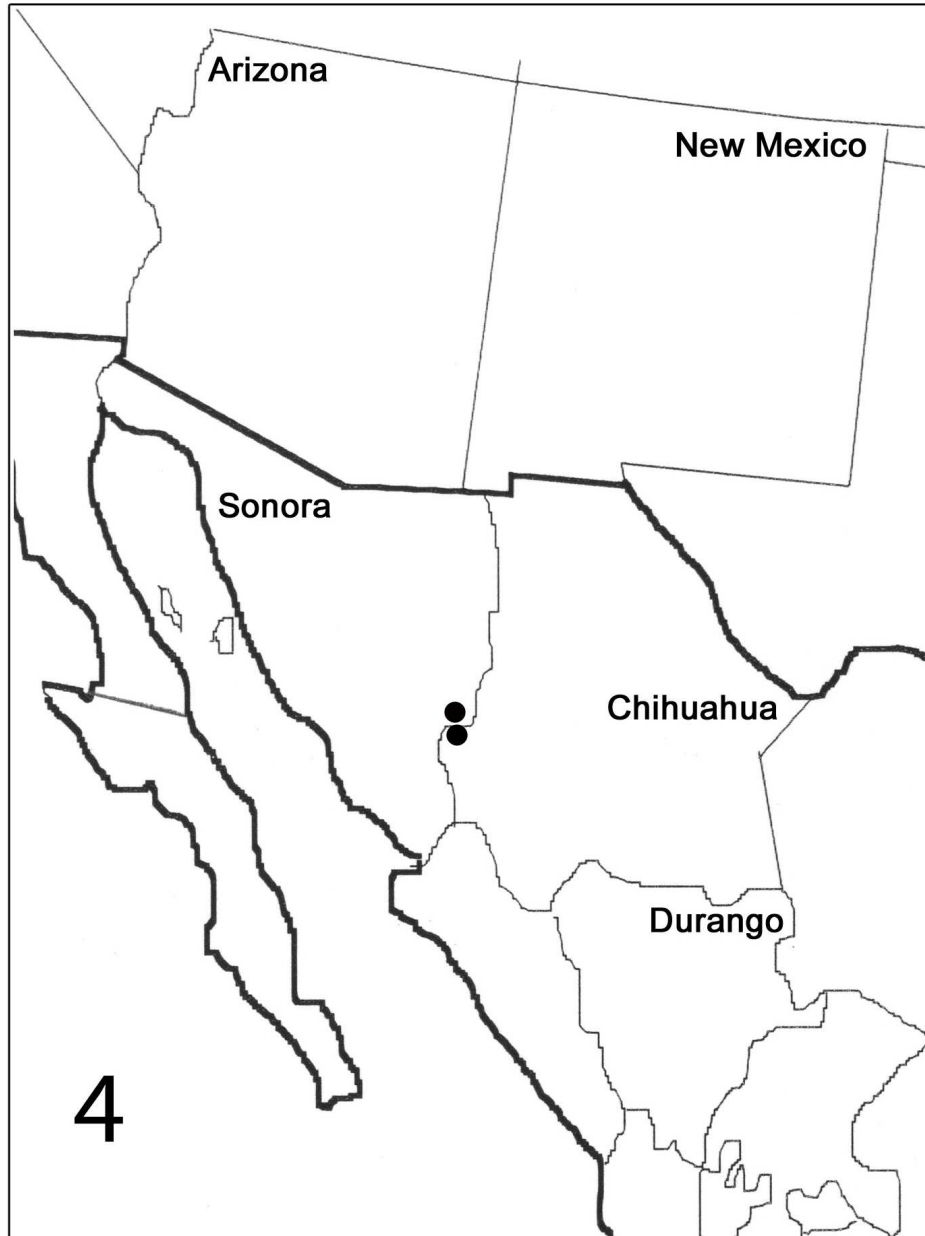
Figure 4. Map of northwestern Mexico and southwestern United States, dots indicating known distribution of A. martinii . More northerly dot represents Mesa del Campanero, the more southerly dot the Sierra Obscura.

Astragalus martinii has two morphological extremes on Mesa del Campanero. Some plants are green, and large, with slightly larger pods and flowers in comparison to the other extreme, which consists of plants that are comparatively low, densely tufted, and grayish with denser pubescence, the flowers and pods averaging smaller. These phases may be ecologically induced, the smaller, more tufted phase recorded as being in the open, along roads, or in flat ponderosa pine forest. The type is more or less in the middle of the range of variation, being fairly large, green, and leafy, while at the same time fairly densely tufted. In the specimens citations we have noted which form the particular collection represents if it seems extreme by indicating “large, open” and “small, tufted.”