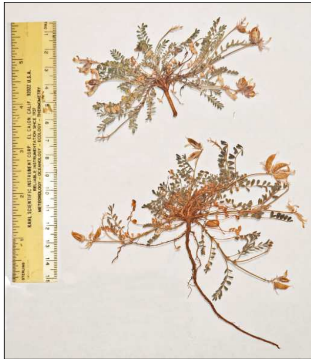
Figure 3. Comparatively small, tufted form of Astragalus martini (Van Devender 95-342 and Reina-G., NMC).