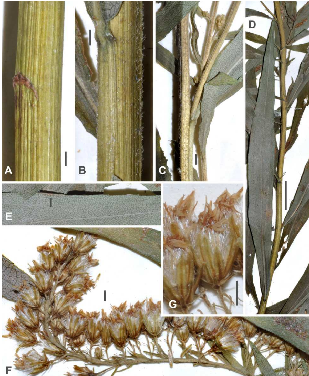
Figure 2. Details of Solidago brendiae , Stearns s.n. (VT). A. Lower stem. B. Mid stems. C. Stem in inflorescence. D. Upper stem leaf, adaxial surface. E. Upper stem leaf, adaxial surface, mid margin with small serrations. F. Lower inflorescence branch. G. Heads. Scale bars: = 1 mm in A-C and E-G; = 1 cm in D