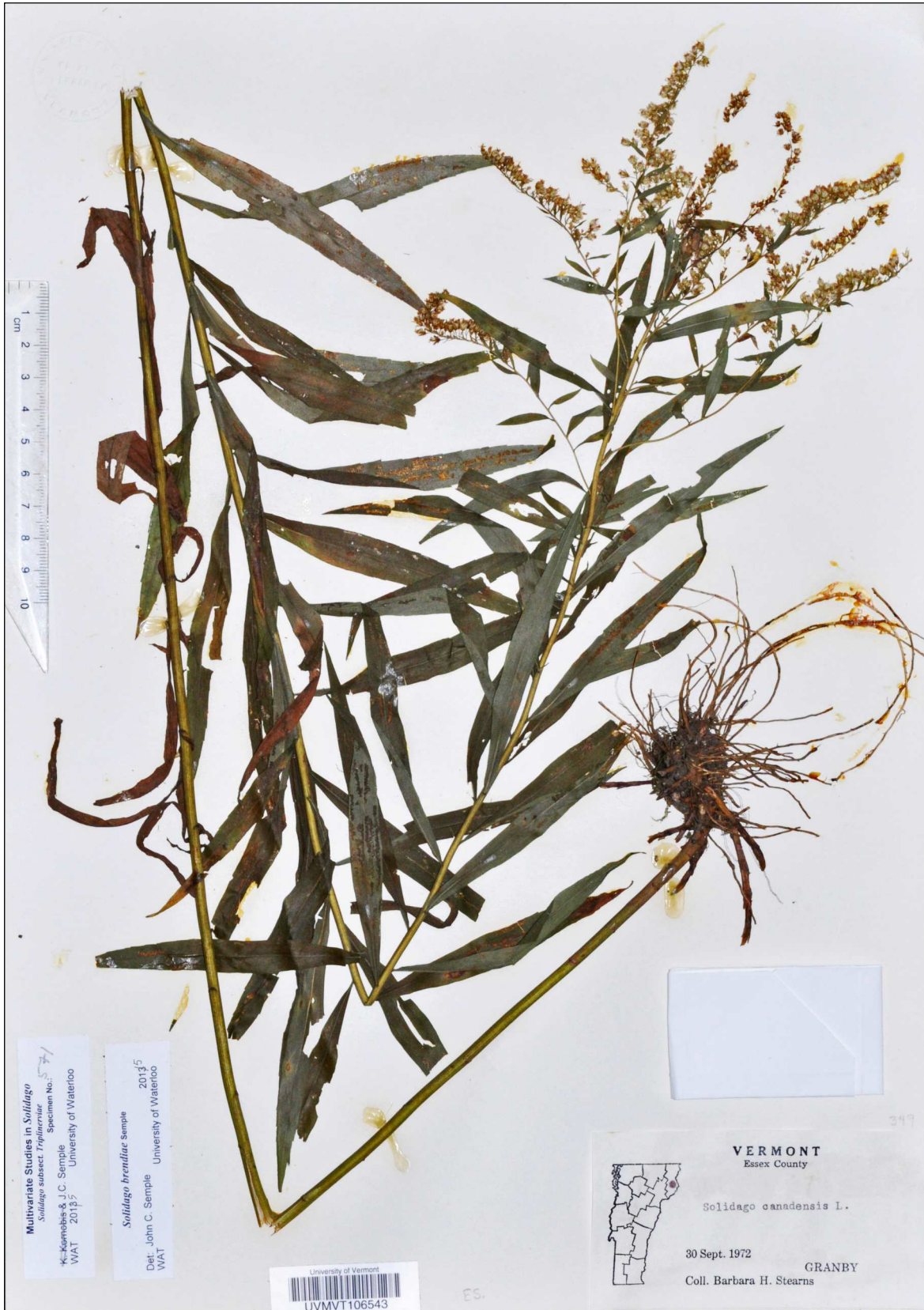
Figure 1. Solidago brendiae from Granby, Vermont: Stearns s.n. (VT).