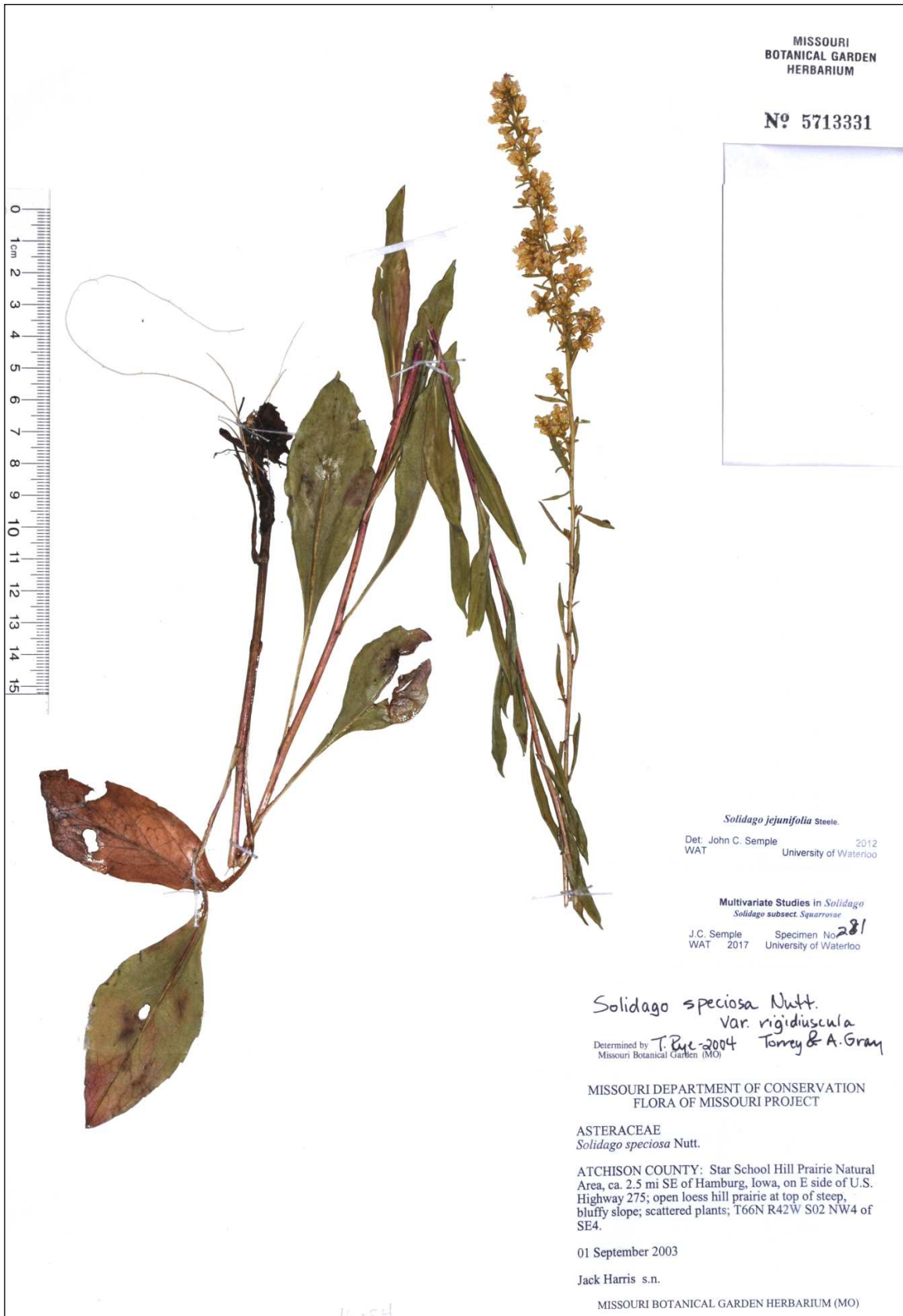
Figure 2. Morphology of Solidago jejunifolia : Harris s.n. (MO) from Atchison Co., Missouri.