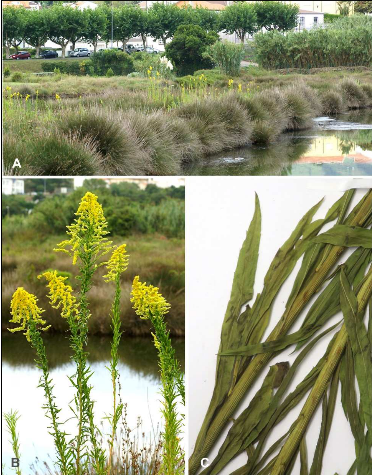
Figure 3. Solidago chilensis from Terceira Island, Azores, Portugal. A-B. Habitat and flowering shoots; Paul da Praia, Terceira, 17 Sep 2015. C. Dried stem and leaves; Agualva, Aug 2014. Digital images by H. Schaefer.