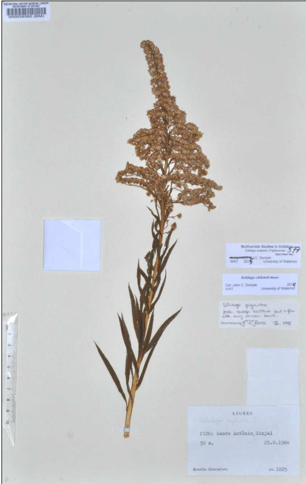
Figure 1. Solidago chilensis from Pico Island, Azores, Portugal — Botelho Gonçalves 1825 (BM).