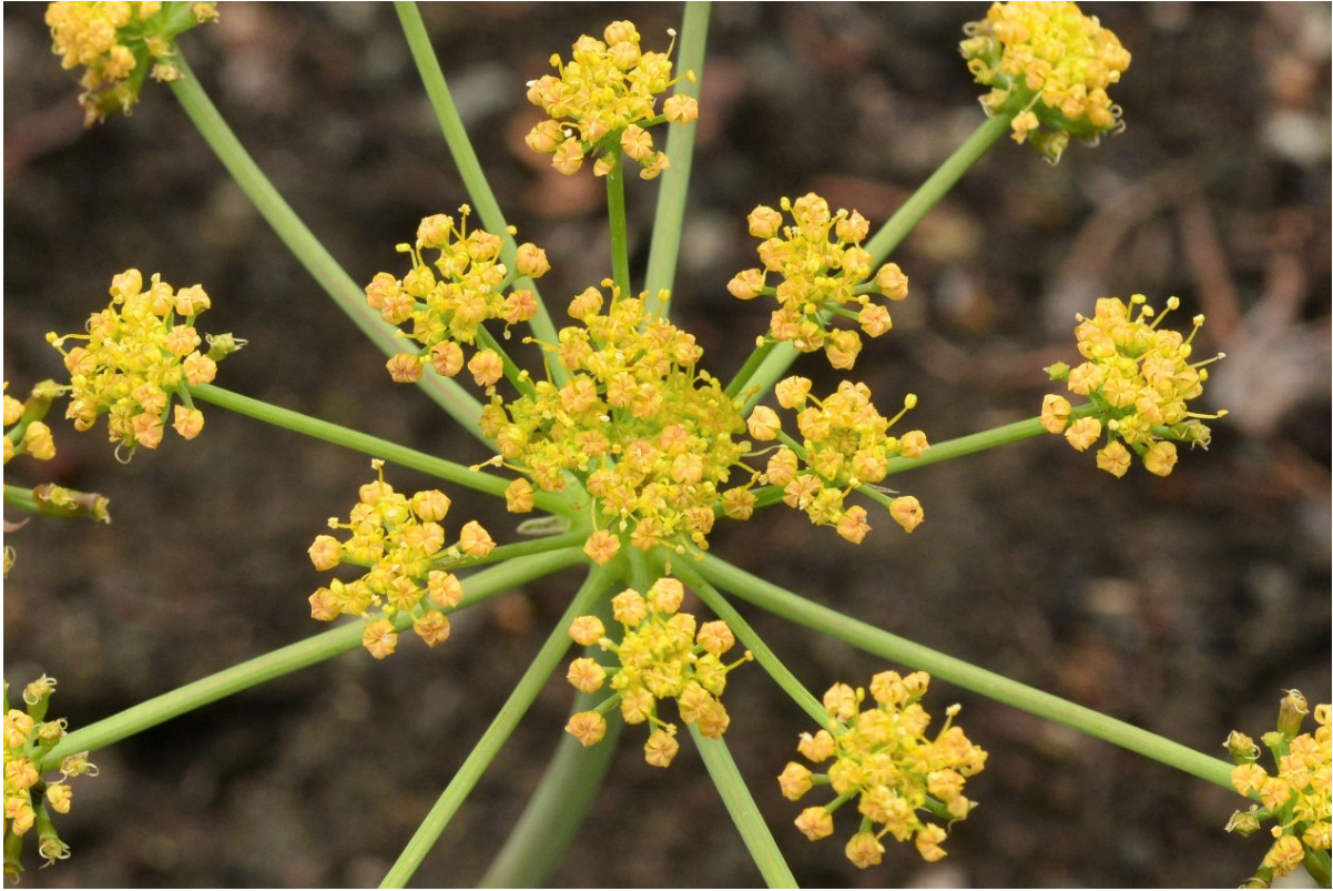
Figure 4. Lomatium roneorum flowers displaying characteristic irregular russet wash color on abaxial petal surfaces.