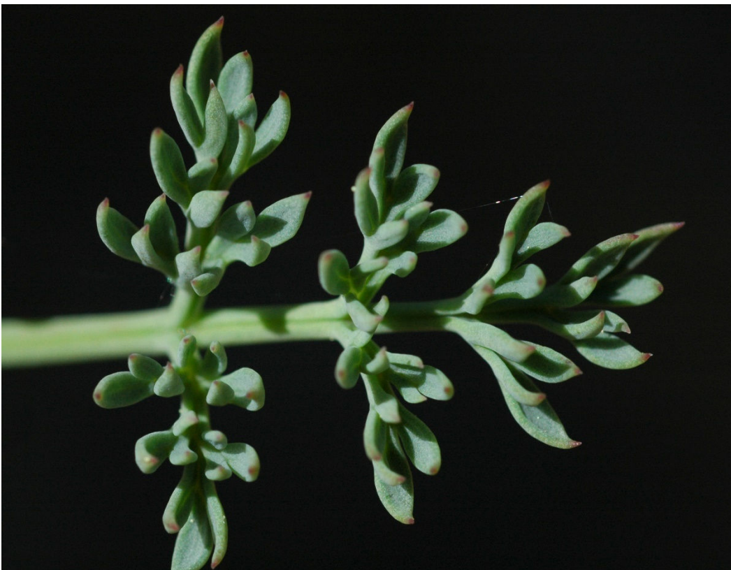
Figure 7. Lomatium cuspidatum typical leaflet morphology.