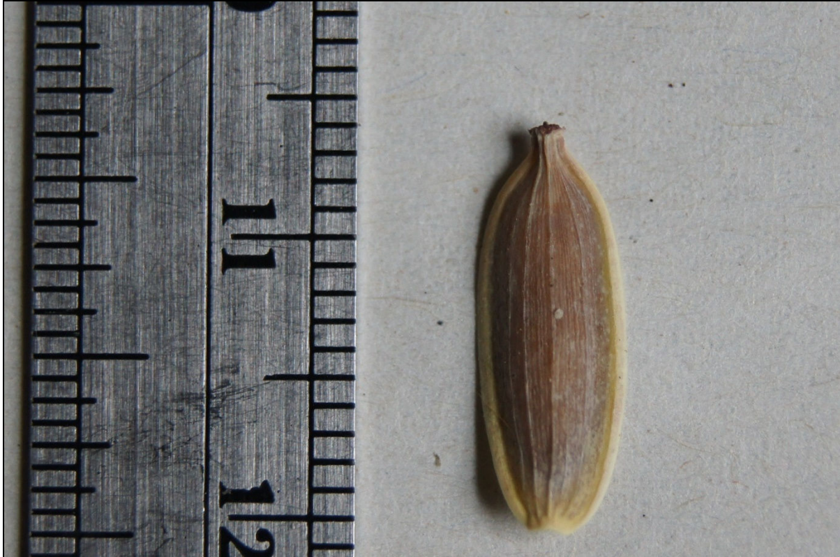
Figure 8. Lomatium roneorum , mature fruit.