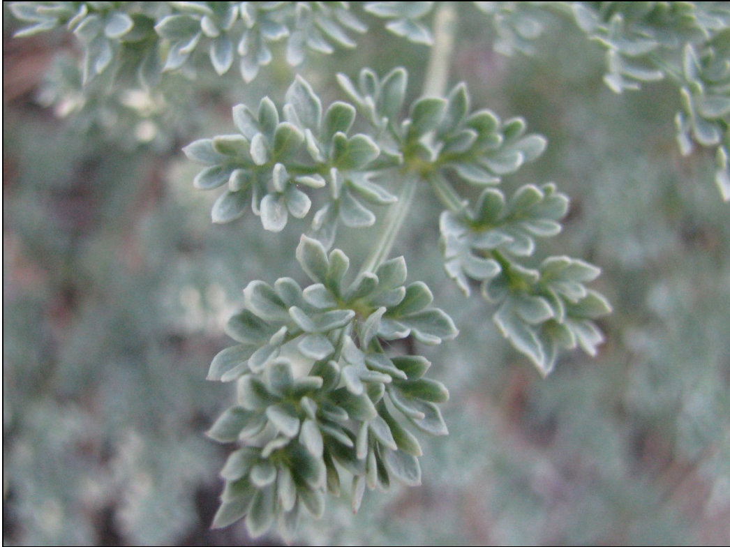
Figure 6. Lomatium roneorum typical leaflet morphology.