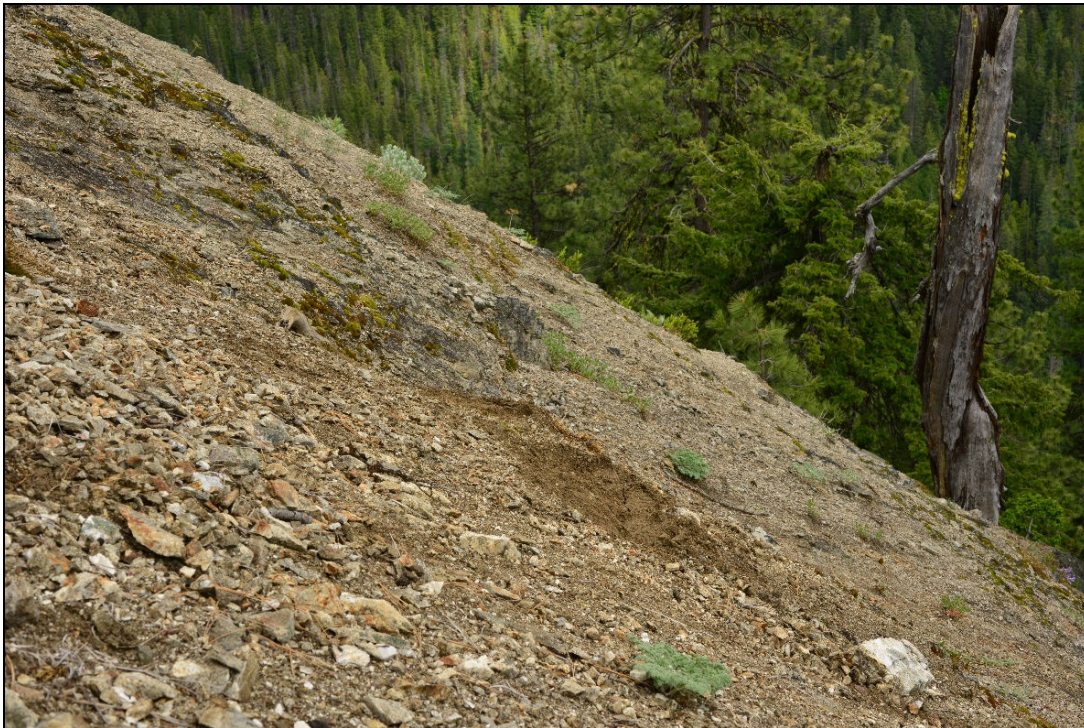
Figure 3. Lomatium roneorum habitat near Estes Butte trail on metamorphic rock substrate.