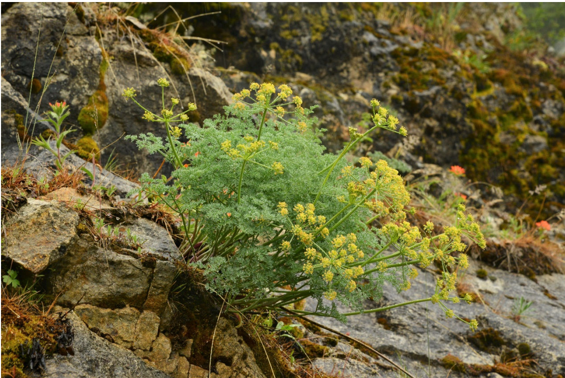
Figure 5. Lomatium roneorum typical flowering specimen growing from a crevice in the rock substrate.