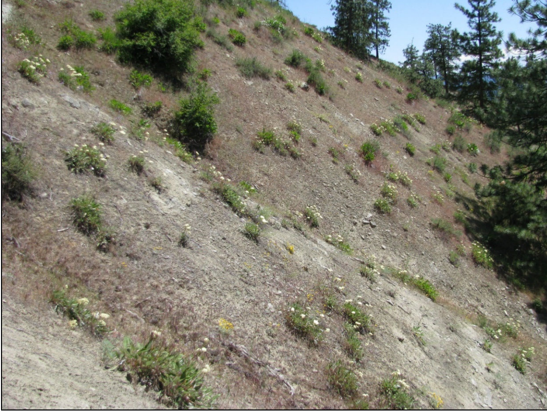
Figure 2. Typical steep slope habitat of Lomatium roneorum at the type locality on Chumstick Formation sandstone.