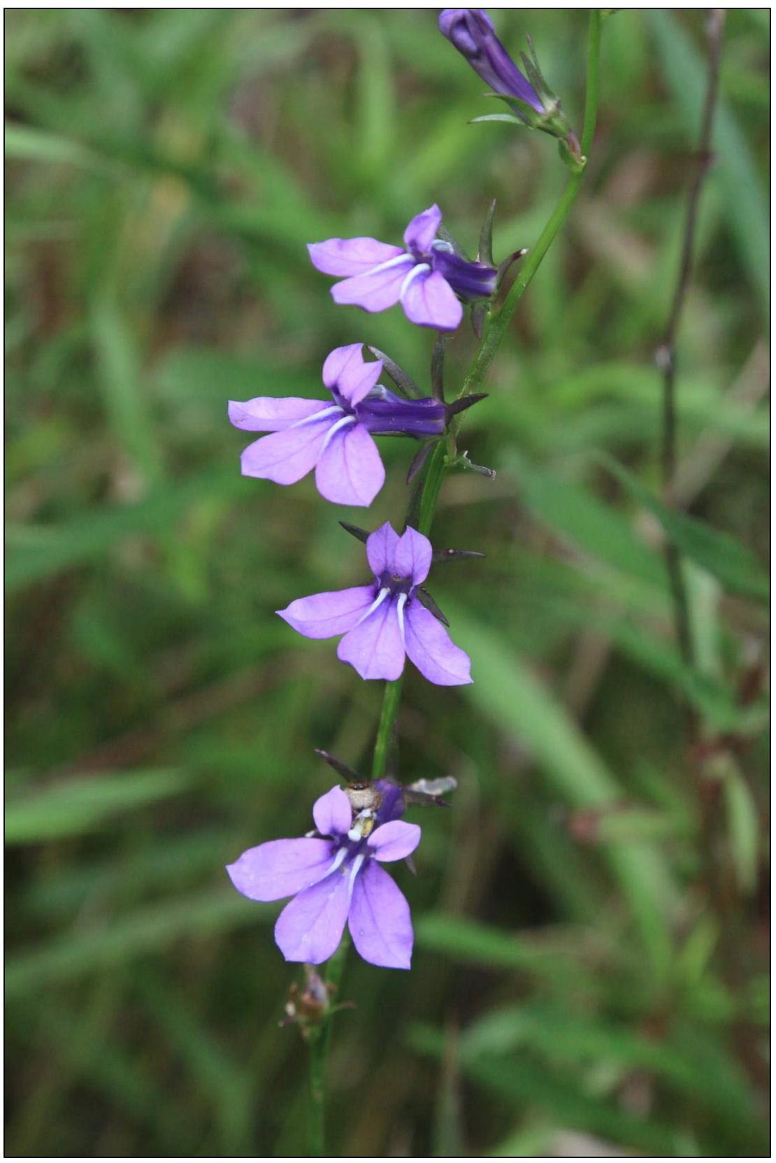
Figure 3. Lobelia batsonii inflorescence, Moore Co., North Carolina, September 2020.