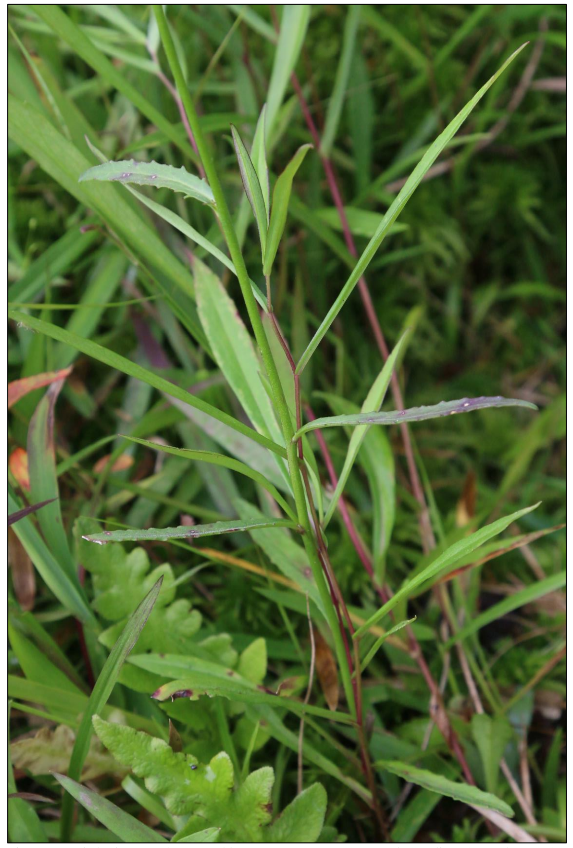
Figure 2. Lobelia batsonii , leaves and lower stem. Moore Co., North Carolina, September 2020.