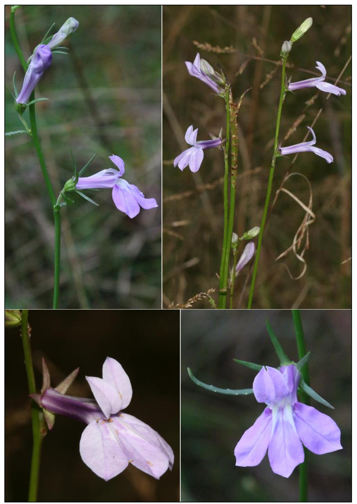
Figure 4. <u>Top</u> (left) Lobelia batsonii — short corolla tube, photo by Sorrie; (right) Lobelia glandulosa — long corolla tube, photo by J. Pippen. <u>Bottom</u> (left) Lobelia batsonii — lack of pubescence at corolla mouth, photo by Sorrie; (right) Lobelia glandulosa — pubescence extending out from corolla mouth, photo by J. Pippen.