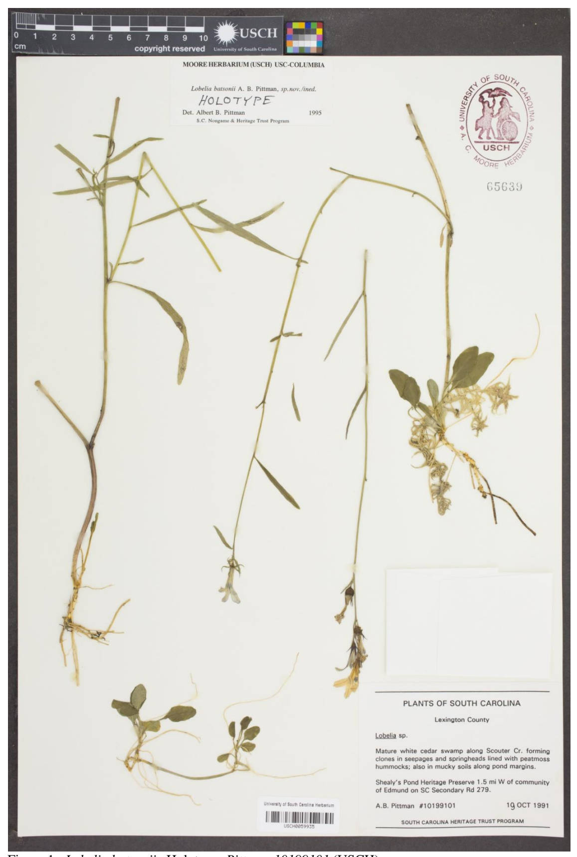
Figure 1. Lobelia batsonii. Holotype, Pittman 10199101 (USCH).