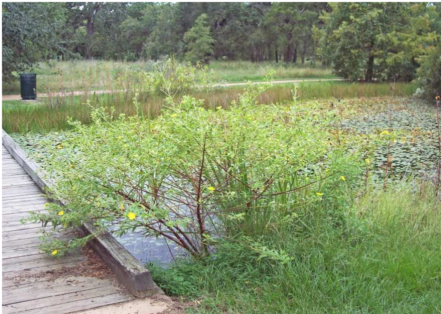
Figure 5. Ludwigia peruviana growth habit of an individual 15 meters from the original population.