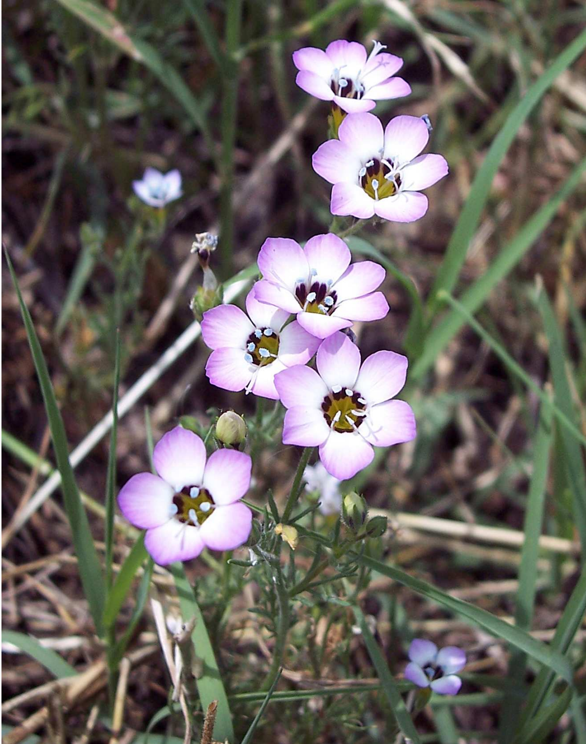
Figure 1. Gilia tricolor in Harris County.