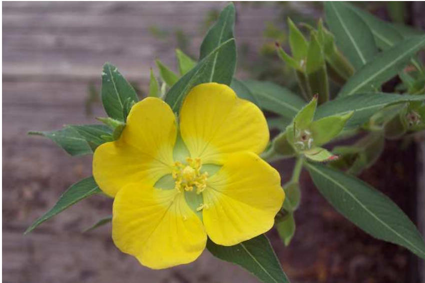
Figure 4. Ludwigia peruviana flower and immature capsule.

Harris Co.: Houston, Hermann Park, Growing at water's edge on swampy part of McGovern Lake, 23 Aug 2008, Aplaca 599 (SWT).