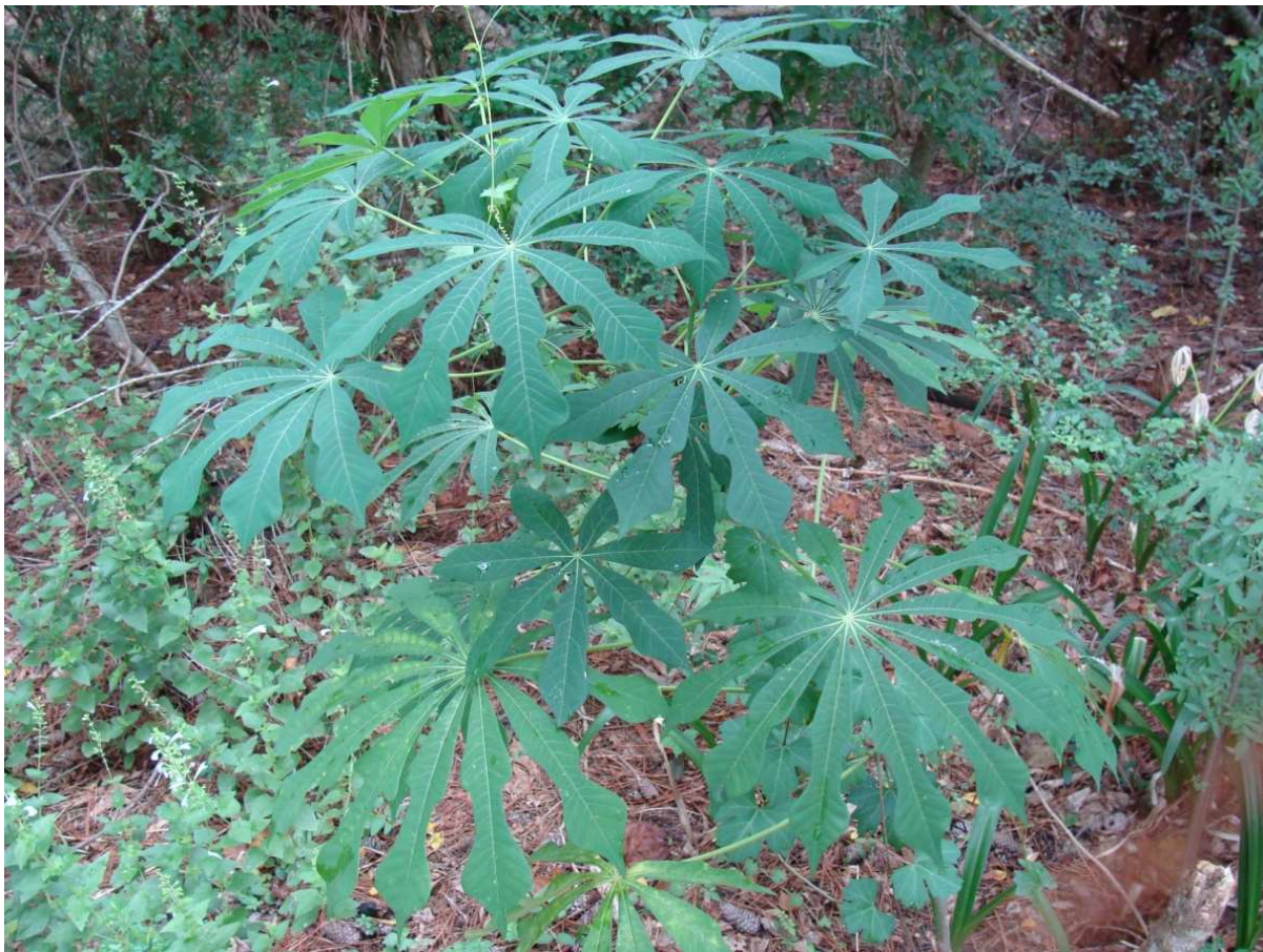
Figure 6 – Manihot grahamii individual in Memorial Park, Harris County.

Manihot grahamii is a South American species that is known to be more cold tolerant than others. The plants become small trees in understory areas and spread regularly from seed and vegetative growth. The area in Harris County has been observed for about a year and a half — the plants are behind the city greenhouse spreading into the forested areas of Memorial Park. The extent of the invasiveness of this species is not known yet, but when the area was cleared of some of the larger individuals, seedlings and root sprouts were actively growing soon afterwards.