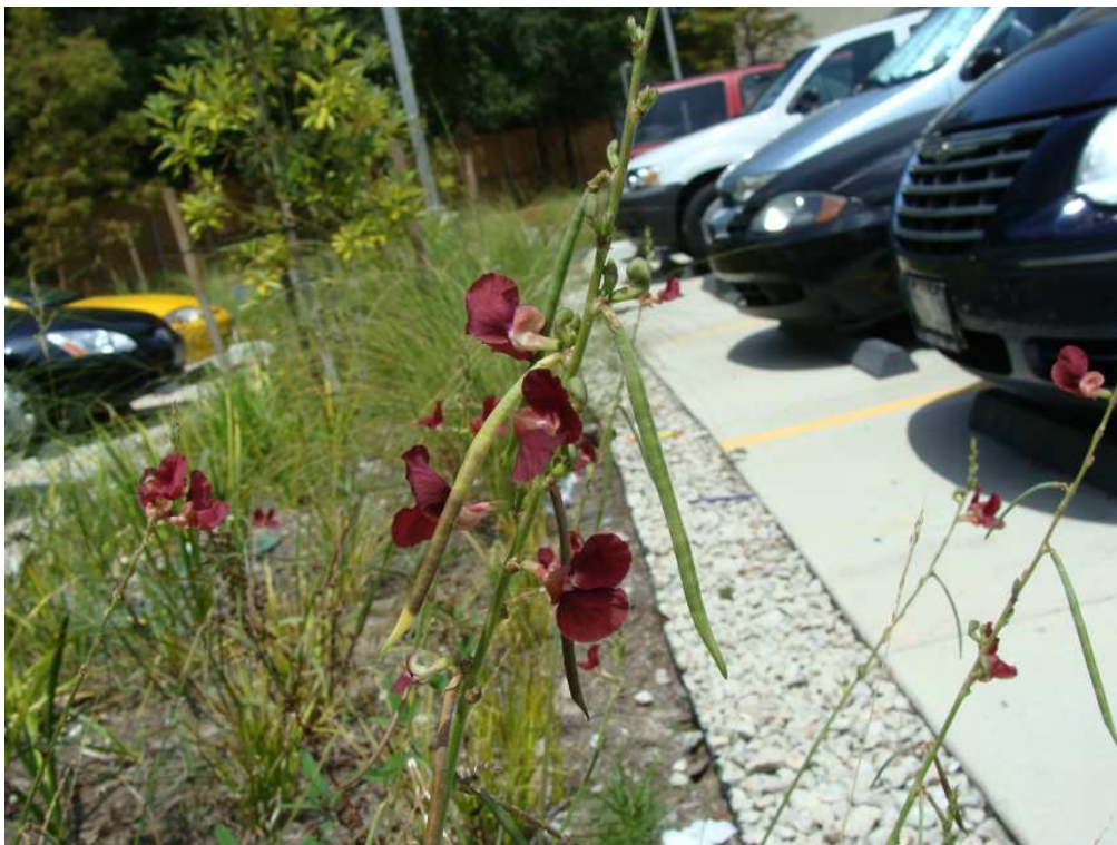
Figure 3. Macropitilium lathyroides flowers and fruit.