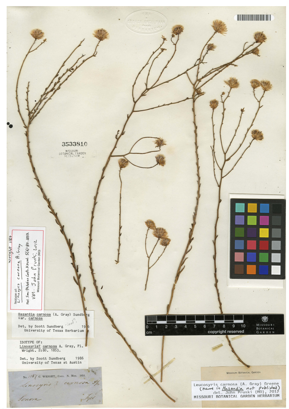
Figure 3. Isotype of Linosyris carnosa A. Gray (≡ Leucosyris carnosa (A. Gray) Greene). ( Wright 1187 , MO).