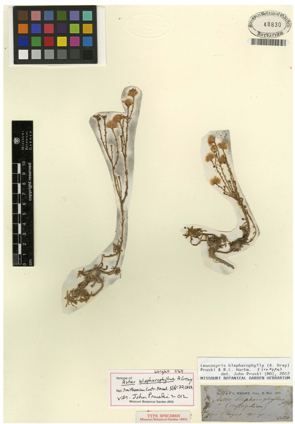
Figure 2. Isotype of Aster blepharophyllus A. Gray (≡ Leucosyris blepharophylla (A. Gray) Pruski & R.L. Hartm.). (Wright 1164, MO).