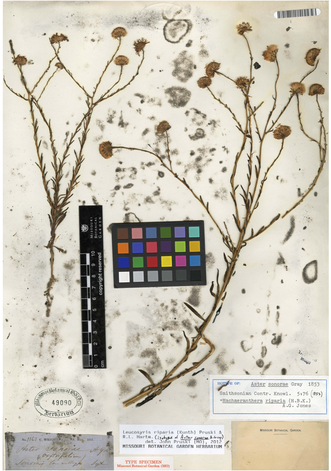
Figure 5. Isotype of Aster sonorae A. Gray (= Leucosyris riparia (Kunth) Pruski & R.L. Hartm.). (Wright 1163, MO).

radiate; involucre 10-12 \times 10-16 mm, hemispherical; phyllaries 5–8-seriate, some attenuate. Ray florets 30–50+; corolla limb 8–11 mm long, sometimes white. Disk florets (25–)40–80+; corolla 3.5–5 mm long, lobes sometimes long-triangular. Cypselae 2–3 mm long, rays pappose. 2n = 10.