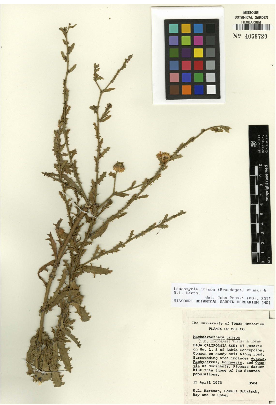
Figure 4. Representative specimen of Leucosyris crispa (Brandegee) Pruski & R.L. Hartm. ( Hartman et al. 3524 , MO).