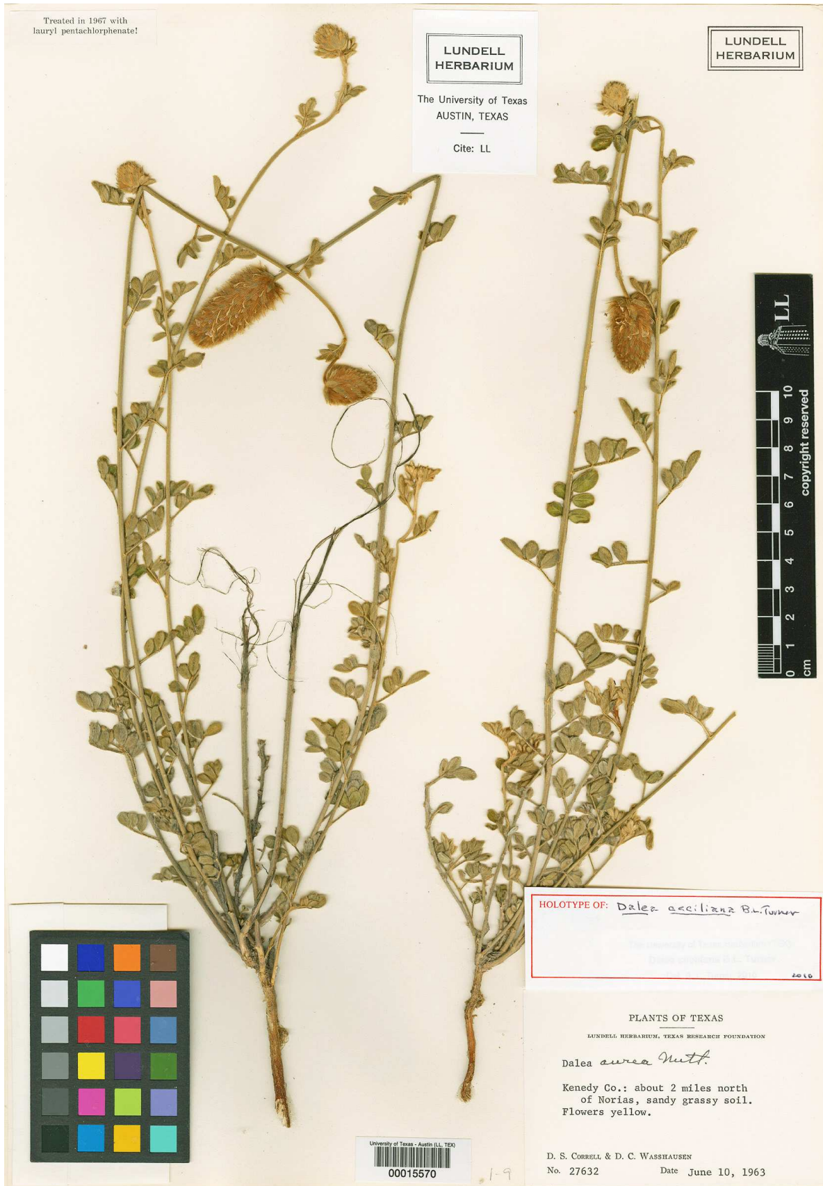
Figure 1. Holotype of Dalea ceciliana .