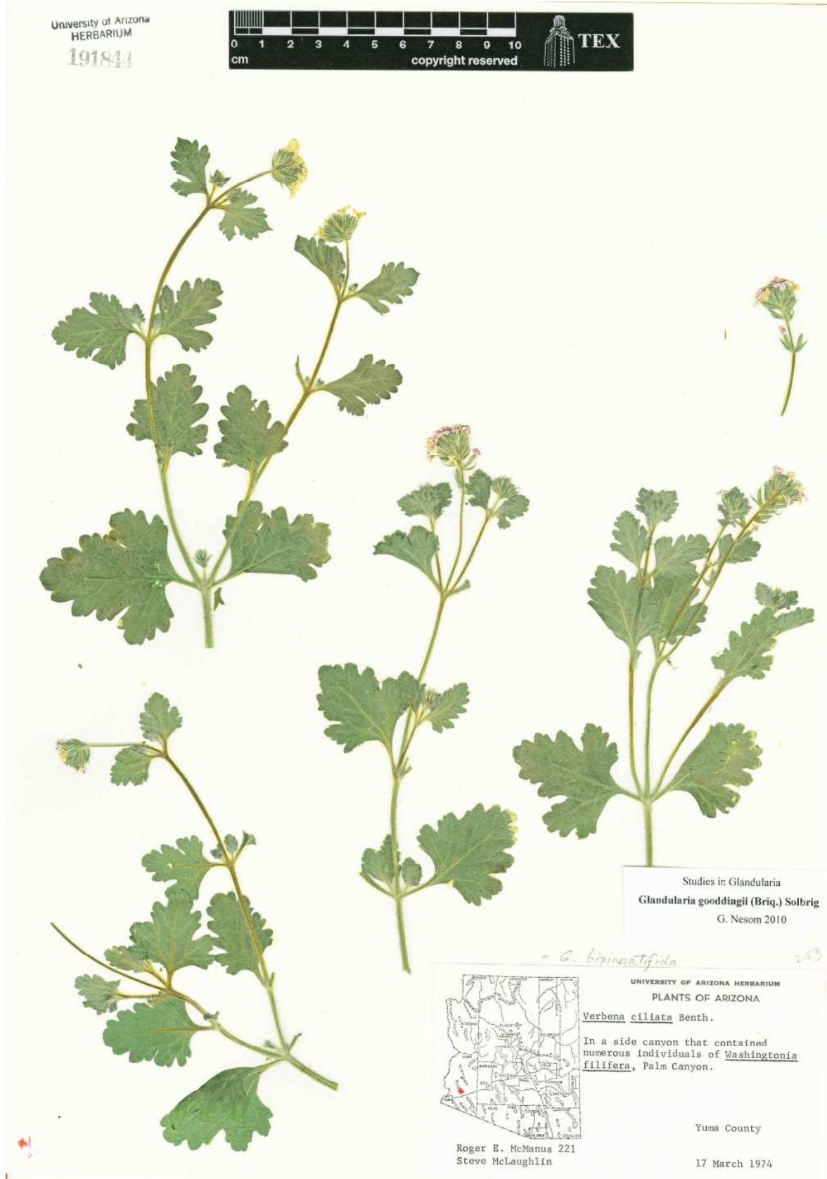
Figure 4. Glandularia gooddingii , leaves coarsely toothed to moderately dissected.