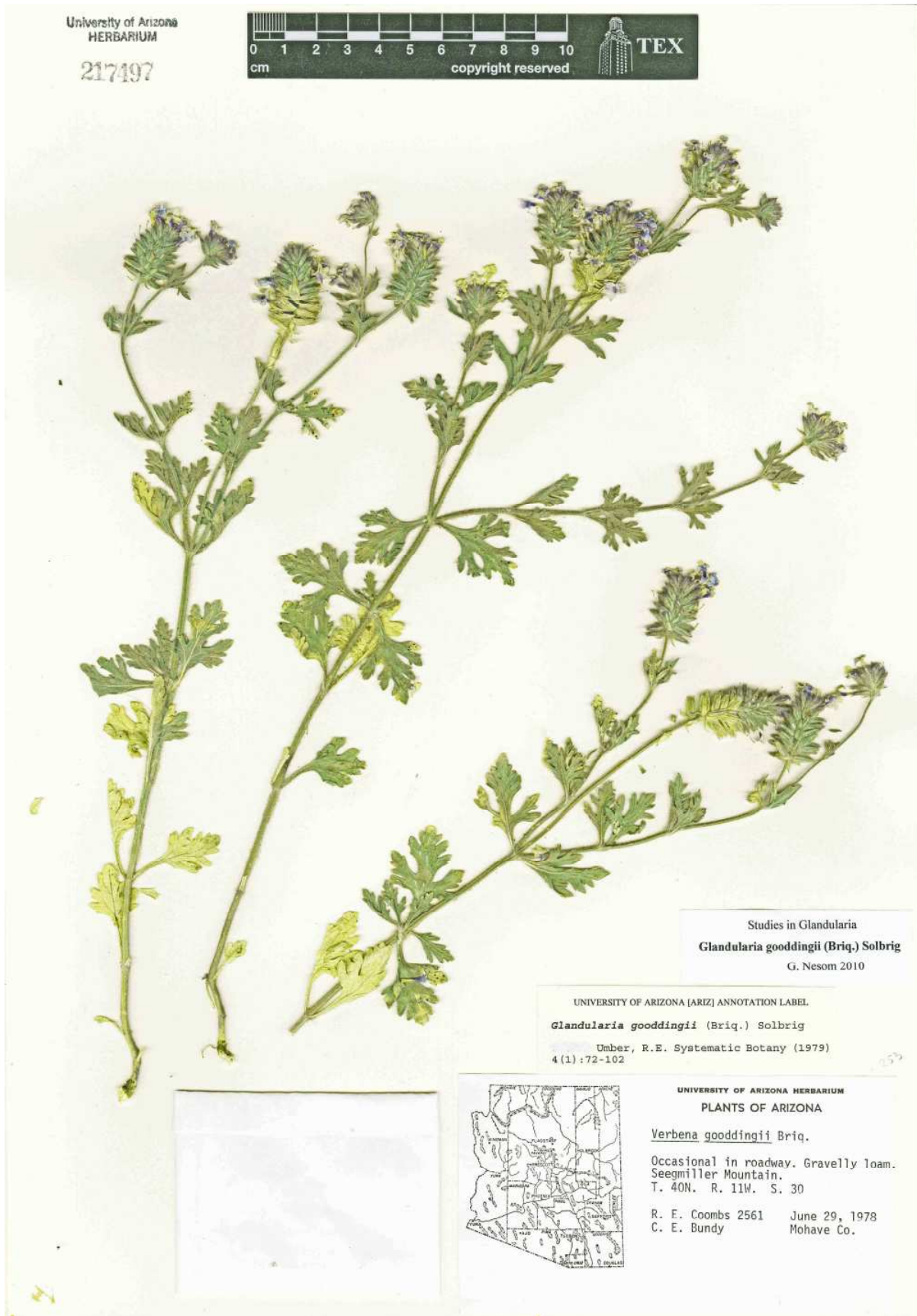
Figure 5. Glandularia gooddingii , leaves dissected.