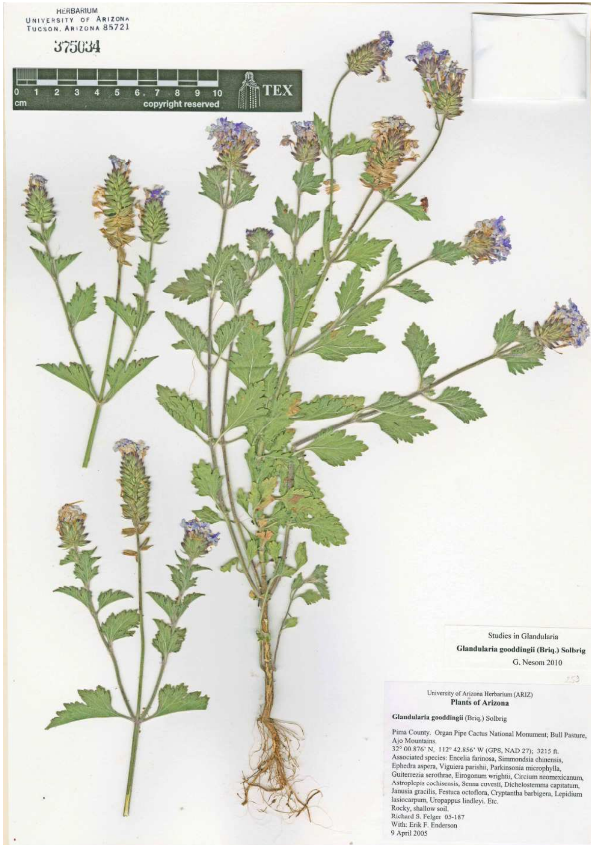
Figure 3. Glandularia gooddingii , leaves coarsely toothed to incised.