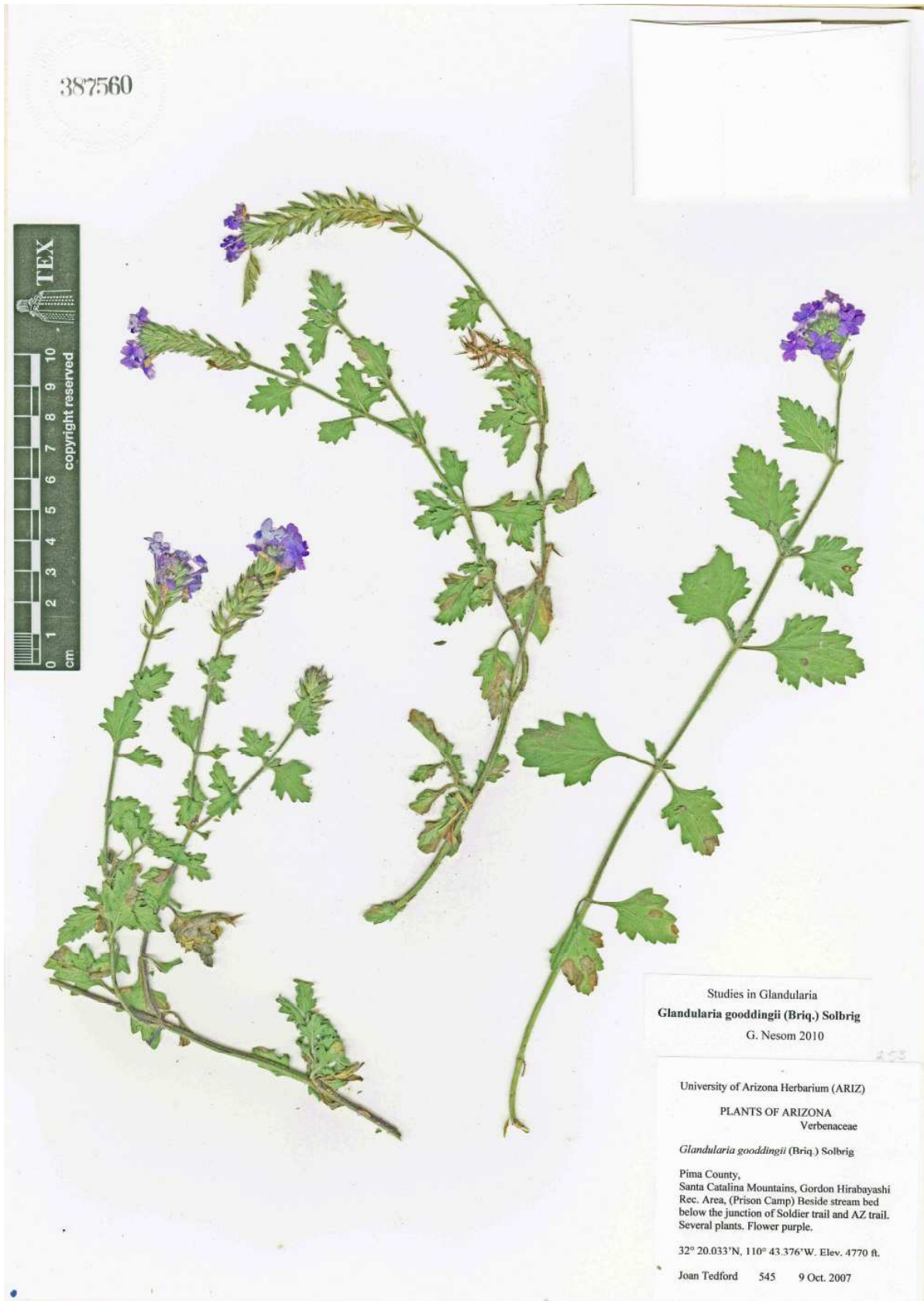
Figure 2. Glandularia gooddingii , leaves coarsely toothed.