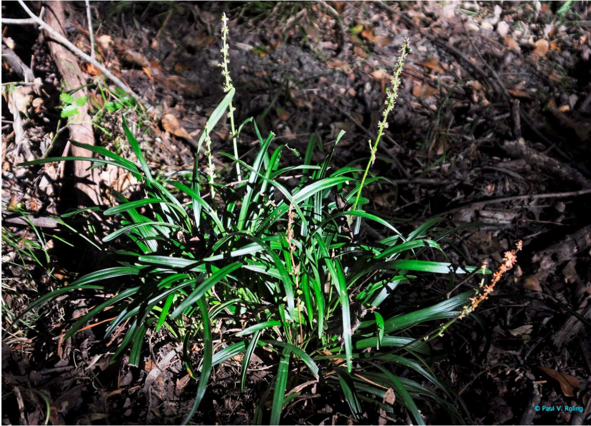
Figure 4. Liriope muscari cluster in the woods.