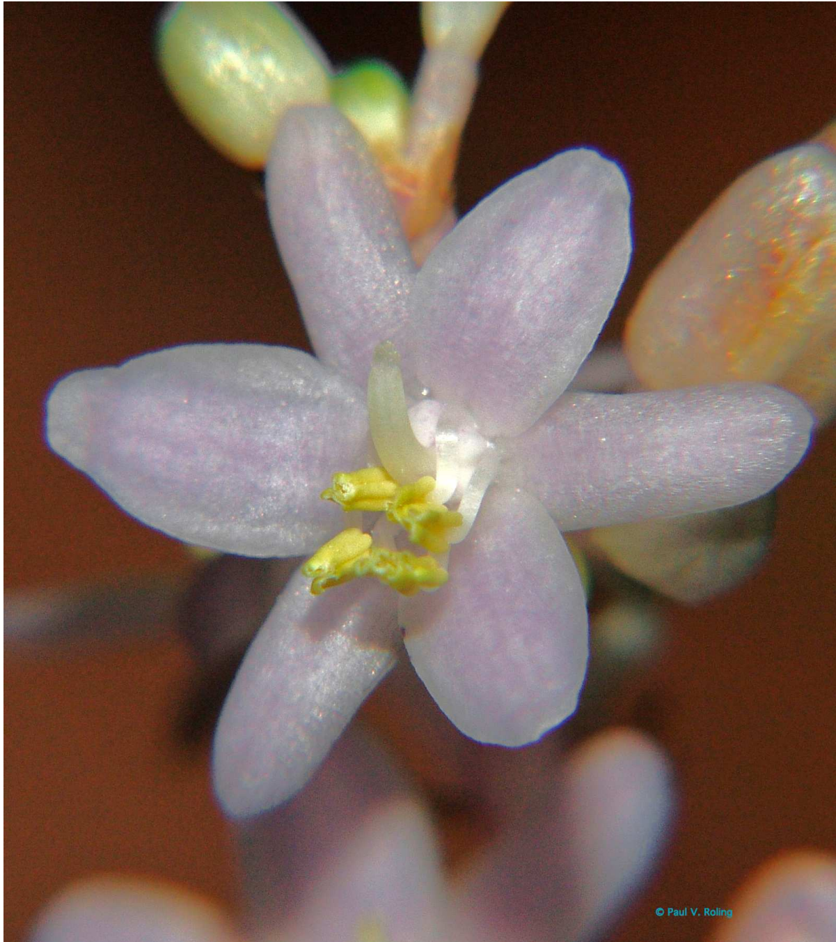
Figure 3. Close-up of Ophiopogon japonicus flower.