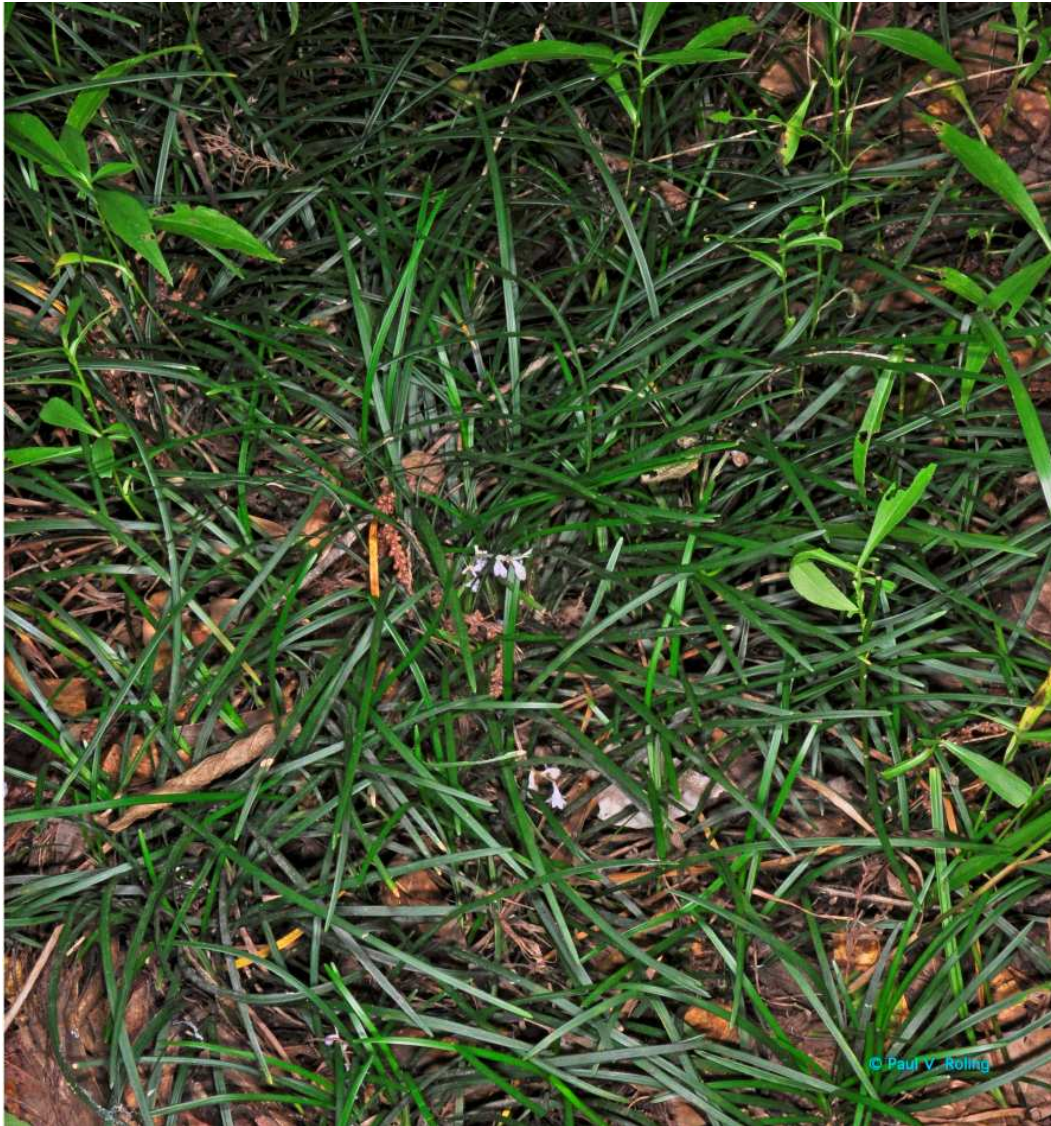
Figure 1. Ophiopogon japonicus colony.