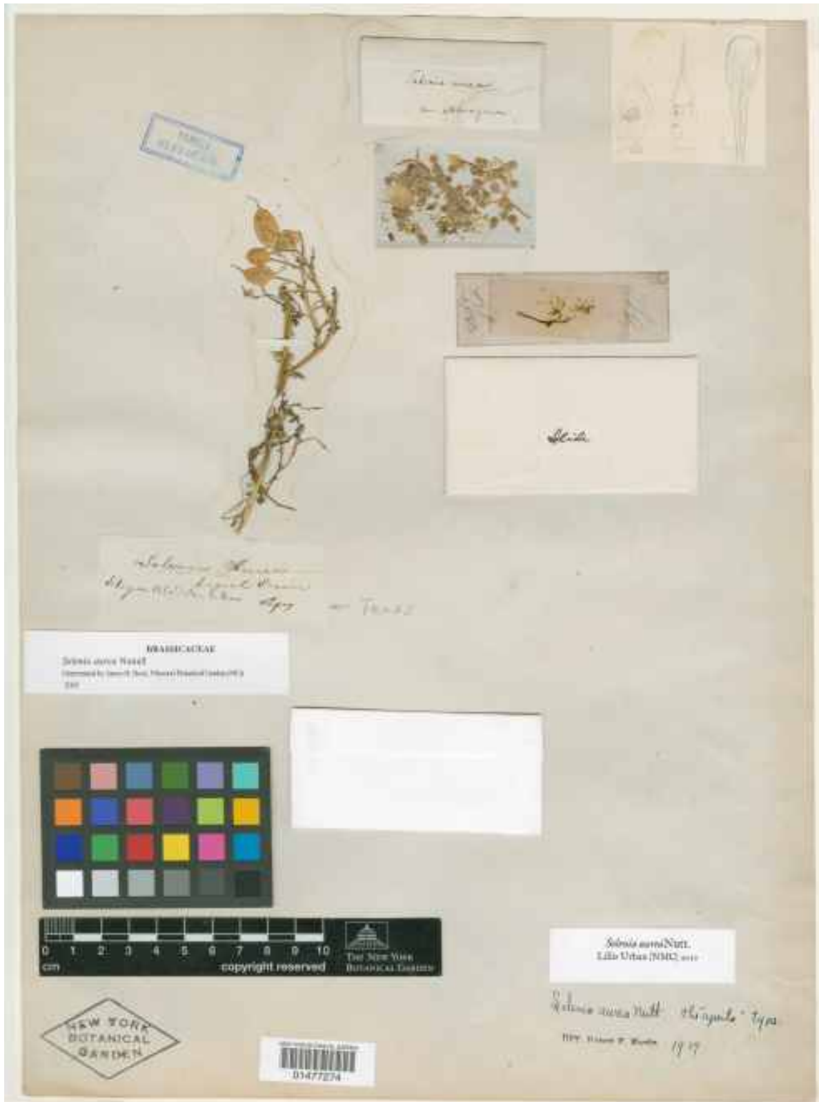
Figure. 2. Selenia aurea (M.C. Leavenworth s.n. Courtesy of the C.V. Starr Virtual Herbarium of The New York Botanical Garden