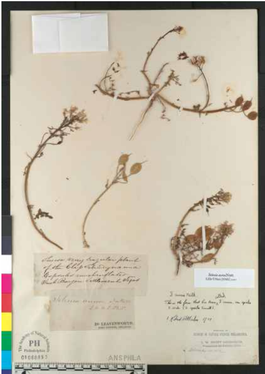
Figure 1. Selenia aurea (M.C. Leavenworth s.n.). Photo from Herbarium PH, Botany Department, Academy of Natural Sciences, Philadelphia. Information provided with the permission of The Academy of Natural Sciences.