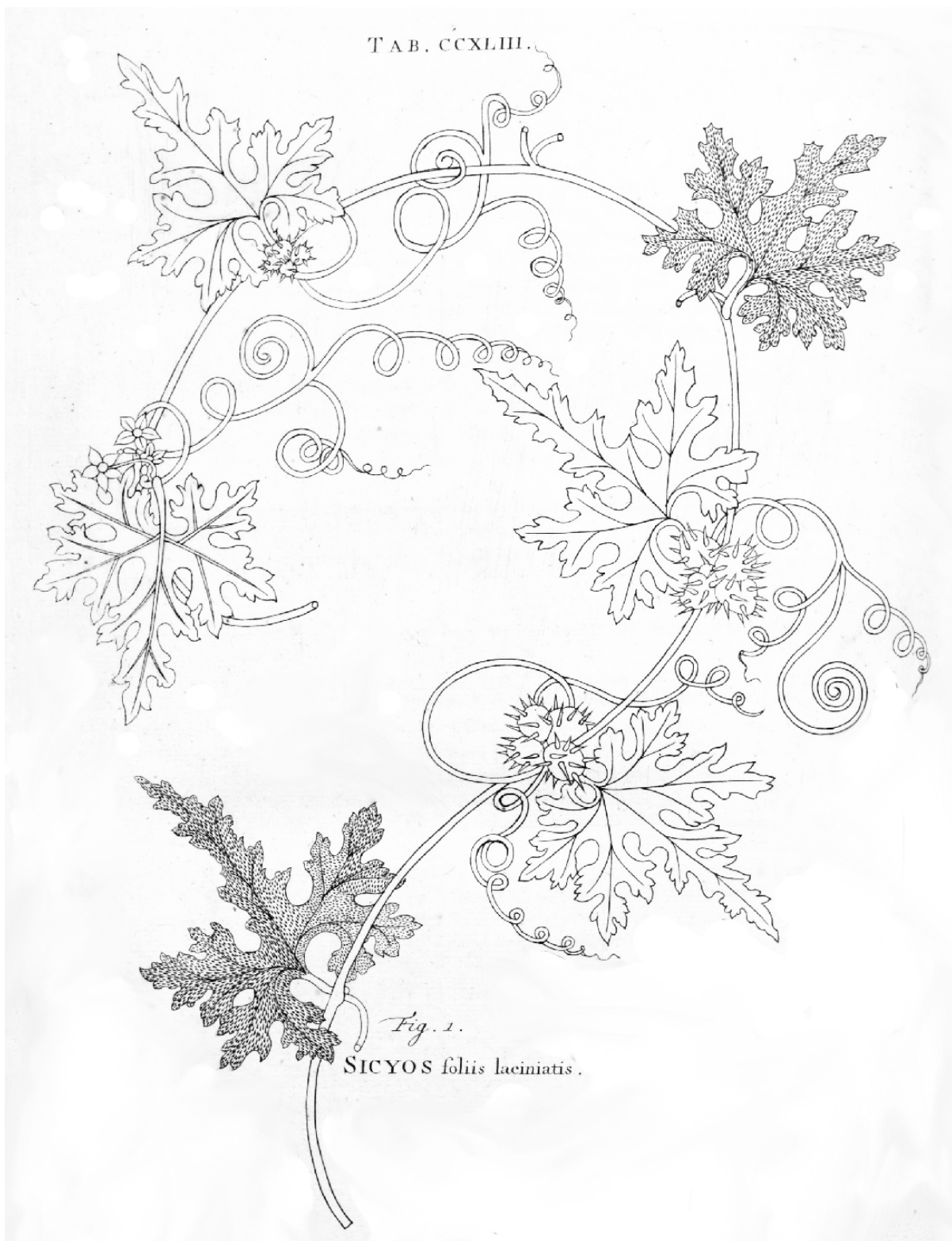
Figure 3. Lectotype of Sicyos laciniatus . " Sicyos foliis laciniatis " — Plumier in Burman, Pl. Amer. , 239, t. 243, f. 1, 1760.