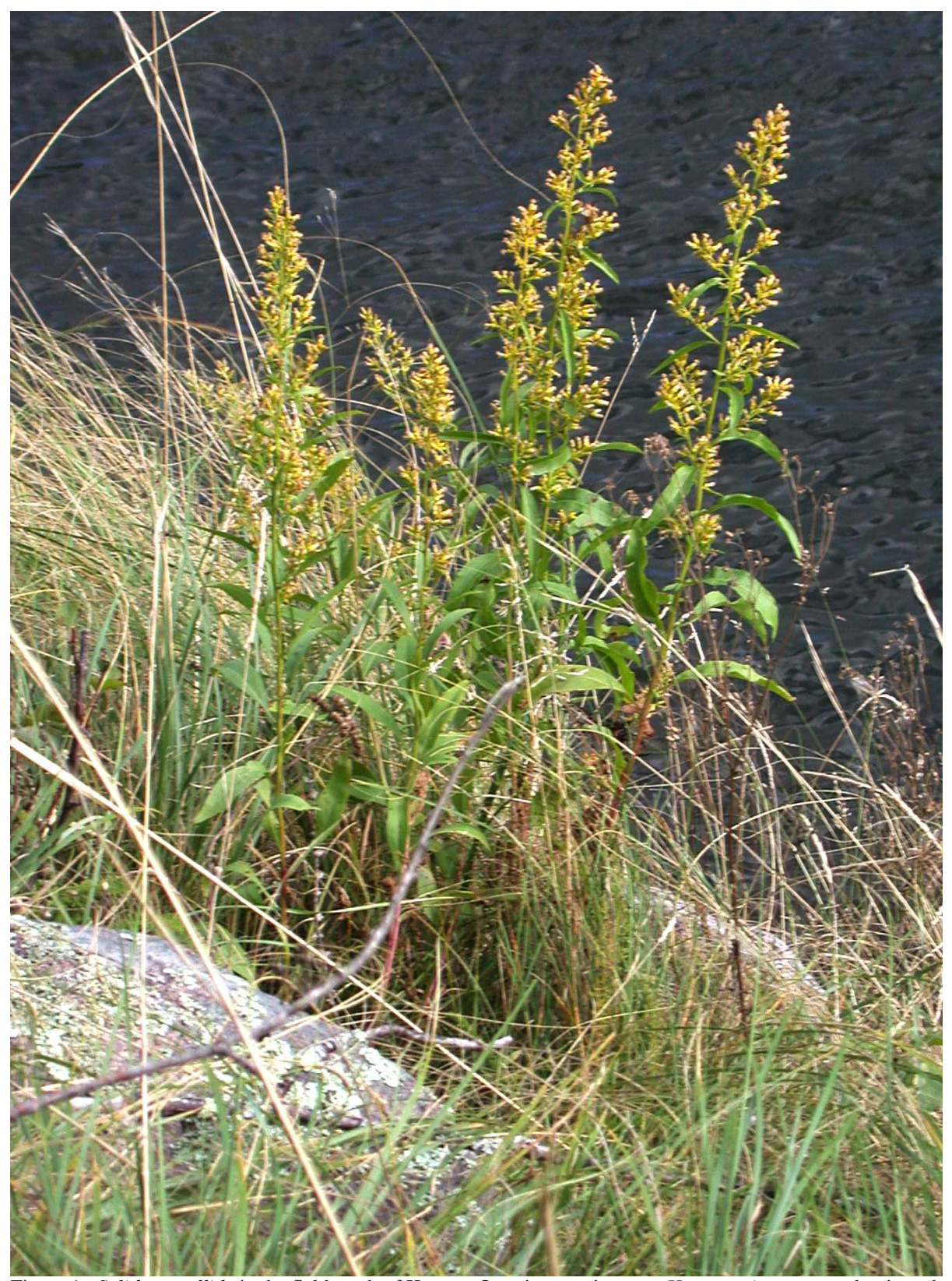
Figure 1. Solidago pallida in the field north of Kenora, Ontario, growing on a Hesperostipa spartea dominated slope above the English River.