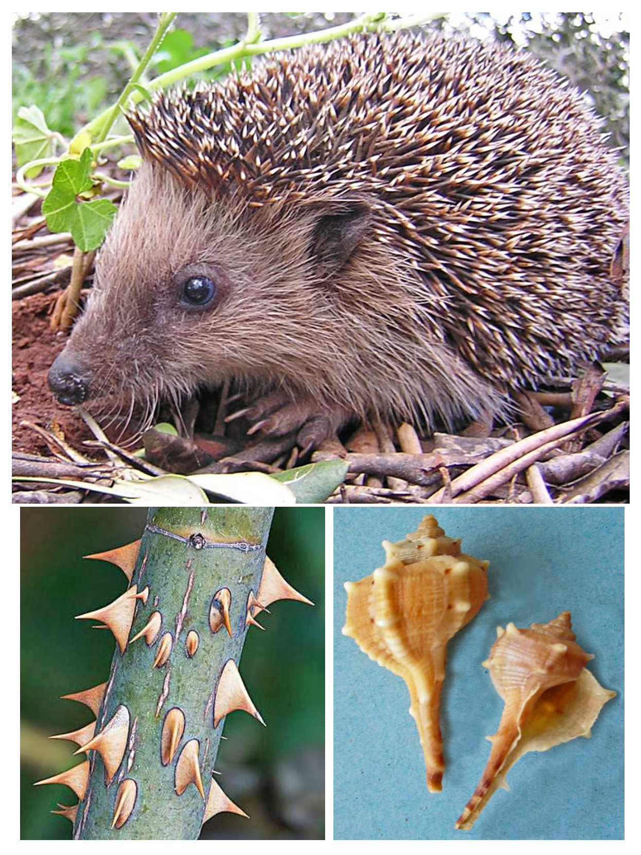
Figure 1. A. Echinate surface; European hedgehog, Erinaceus europaeus ; B. Aculeate surface; prickles of Rosa stem; C. Muricate surface; individuals of purple dye-murex, Bolinus brandaris (originally Murex brandaris L.)