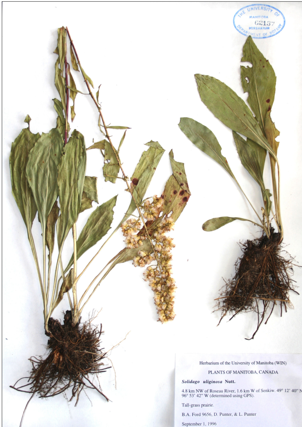
Figure 1. Solidago jejunifolia voucher (Ford, Punter, & Punter 9656, WIN).