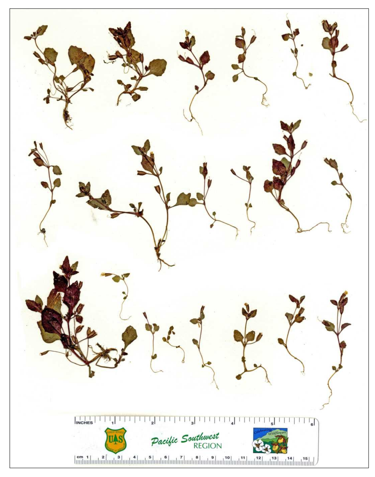
Figure 7. Erythranthe taylori, Taylor 13405 (paratype, CHSC).