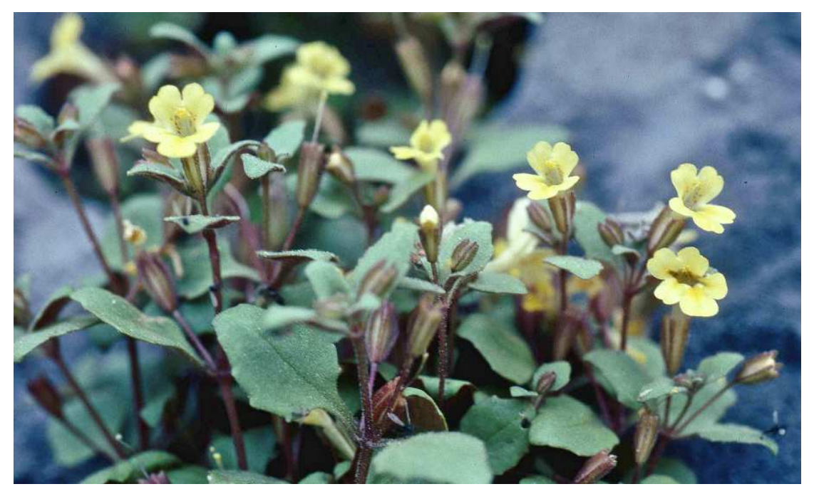
Figure 5. Flowers of Erythranthe taylori , from the population of Taylor 13405 .

Flowering Apr–May. Crevices in limestone cliff faces and outcrops; 900–1100 m. California (Shasta Co.).