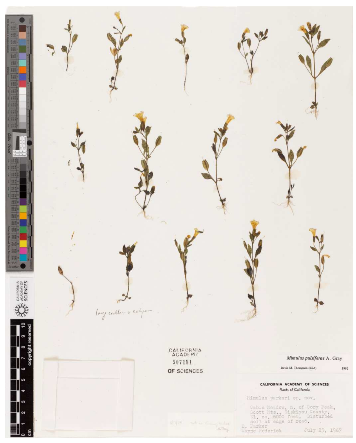
Figure 2. Erythranthe trinitiensis, Parker & Roderick s.n. (CAS).