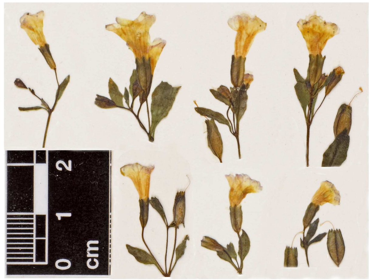
Figure 3. Erythranthe trinitiensis , flowers from Parker & Roderick s.n. (CAS). The pink borders of the corolla limb are evident even in drying. Note mature, inflated calyx at lower right and immediately above.