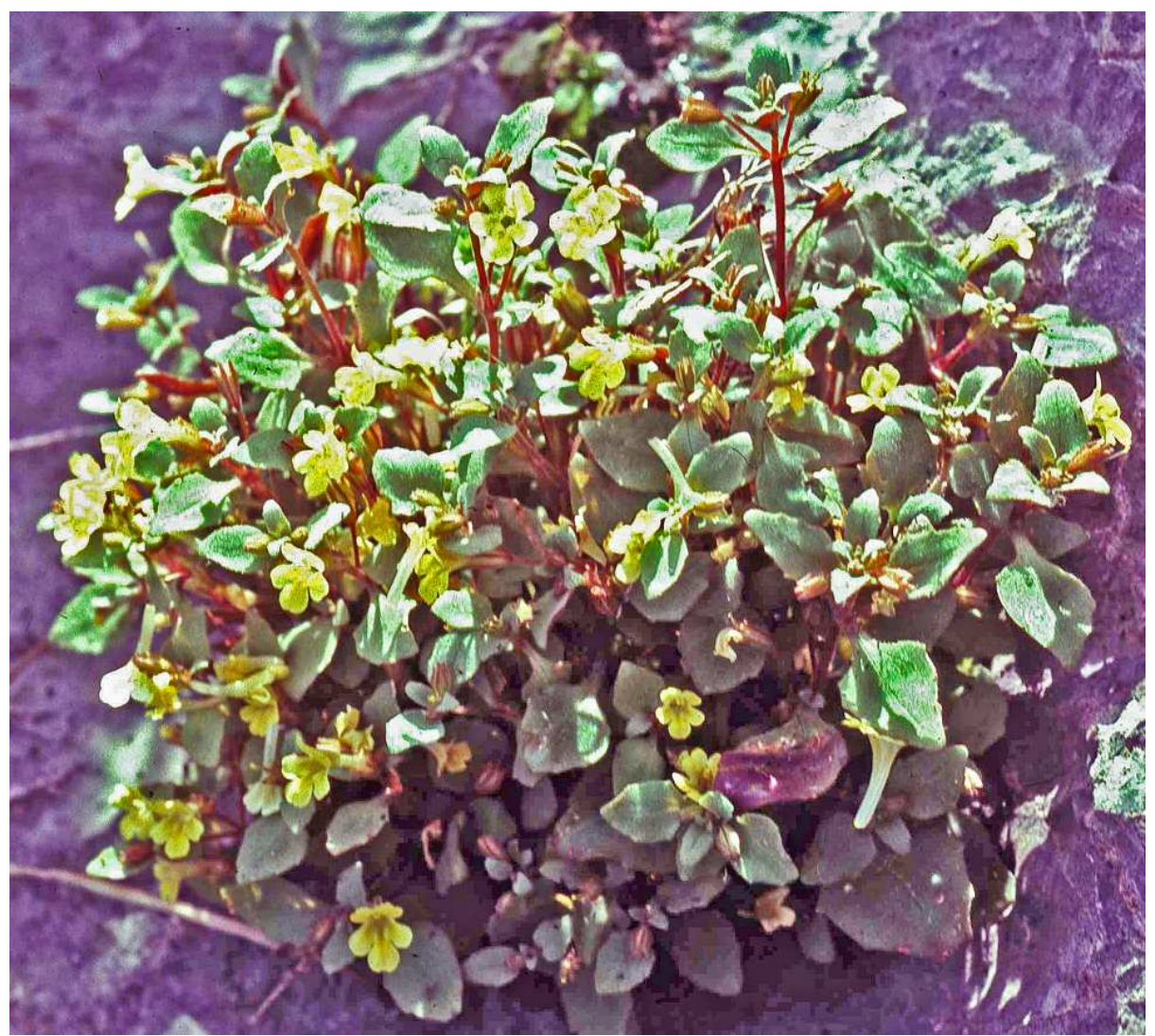
Figure 6. Erythranthe taylori , from the population of Taylor 13405 .

Additional collections examined. California . <u>Shasta Co.</u>: Hirz Mountain, along trail from parking area to lookout, growing in crevices in limestone rock, 3240 ft, 29 Apr 2010, Kierstead-Nelson 2010-003 (CHSC 105854!); S end of Gray Rocks, Squaw Creek watershed, Shasta Lake region, limestone outcrops in open forest dominated by Quercus kelloggii-Pinus sabiniana , ca. 2800 ft, 1 May 1993, Taylor 13405 with J.R. Shevock (RSA 565081, UC 1736596!, UCR 84857, CHSC).