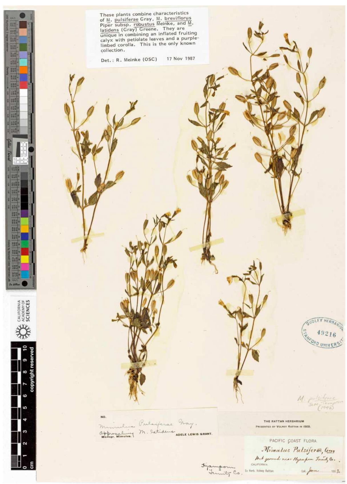
Figure 1. Erythranthe trinitiensis, holotype.