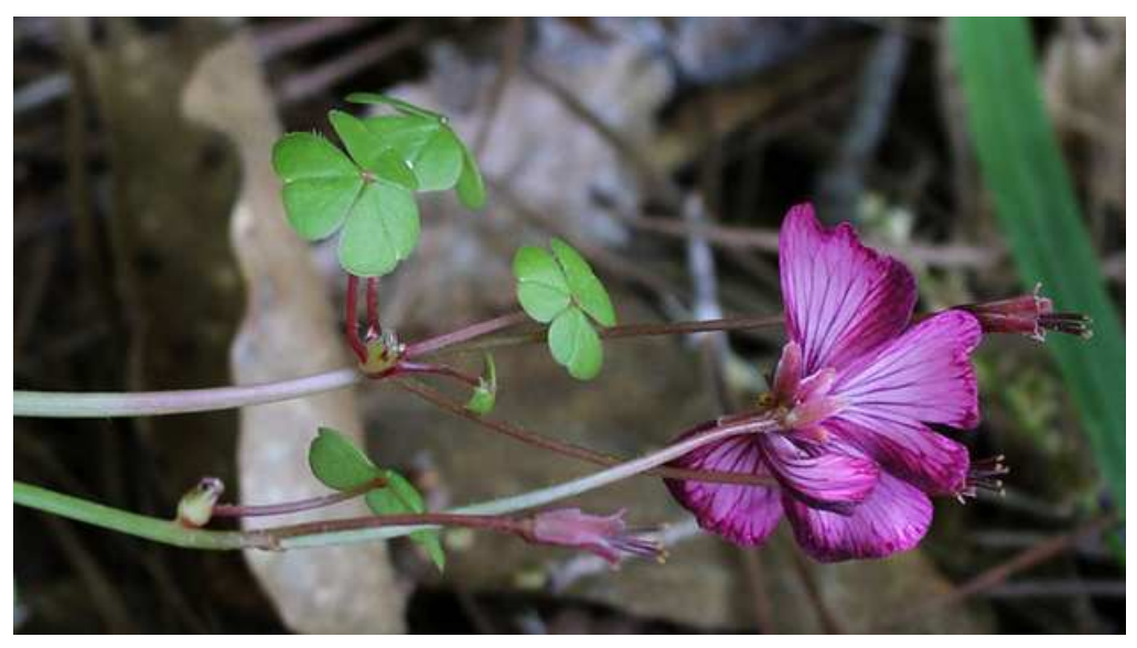
Figure 4. Oxalis brasiliensis in Dallas Co., Alabama, showing production of aerial propagules. Photo by Wayne Barger, 23 May 2013.