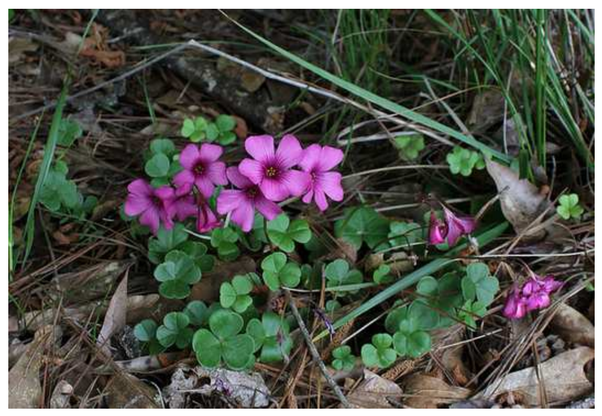
Figure 3. Growth habit of Oxalis brasiliensis in Dallas Co., Alabama. Photo by Wayne Barger, 23 May 2013.

structurally identical, if somewhat underdeveloped, to those of bulbils produced underground." In fact, the present authors have not found any other mention in literature of such non-bulboid propagules in Oxalis like those produced in O. brasiliensis. Lourteig's description (translated from Spanish) of O. brasiliensis (2000, p. 557) noted that "aerial bulbs were sometimes present in the inflorescences."