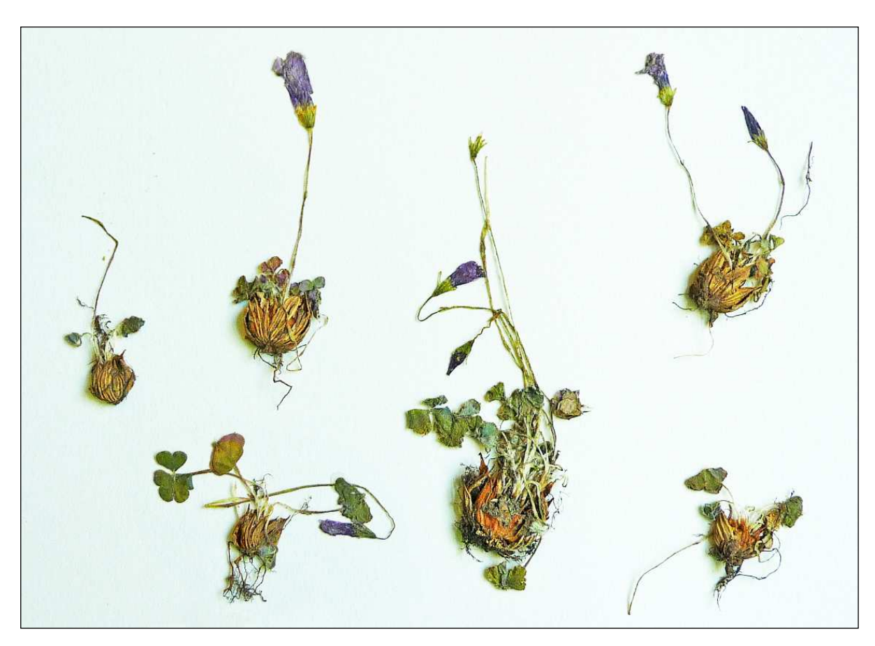
Figure 2. Oxalis hispidula collections from Baldwin County, Alabama. Top: Horne 1957 (BRIT). Right: Horne 1960 (BRIT).