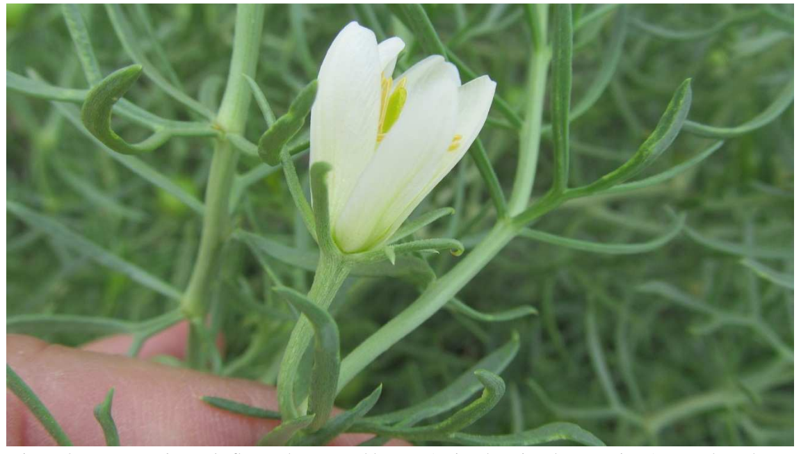
Figure 3. Peganum harmala flower, bracts, and leaves, Amistad National Recreation Area, Val Verde County, Texas.