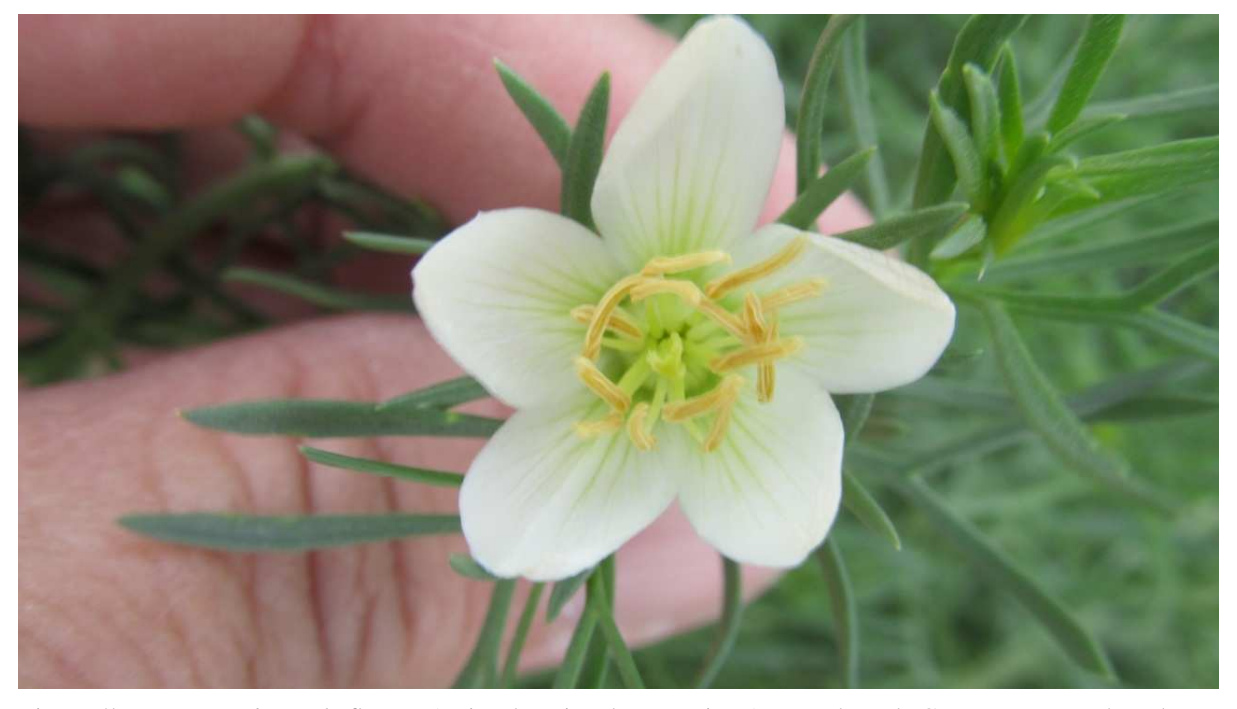
Figure 4b. Peganum harmala flower, Amistad National Recreation Area, Val Verde County, Texas.