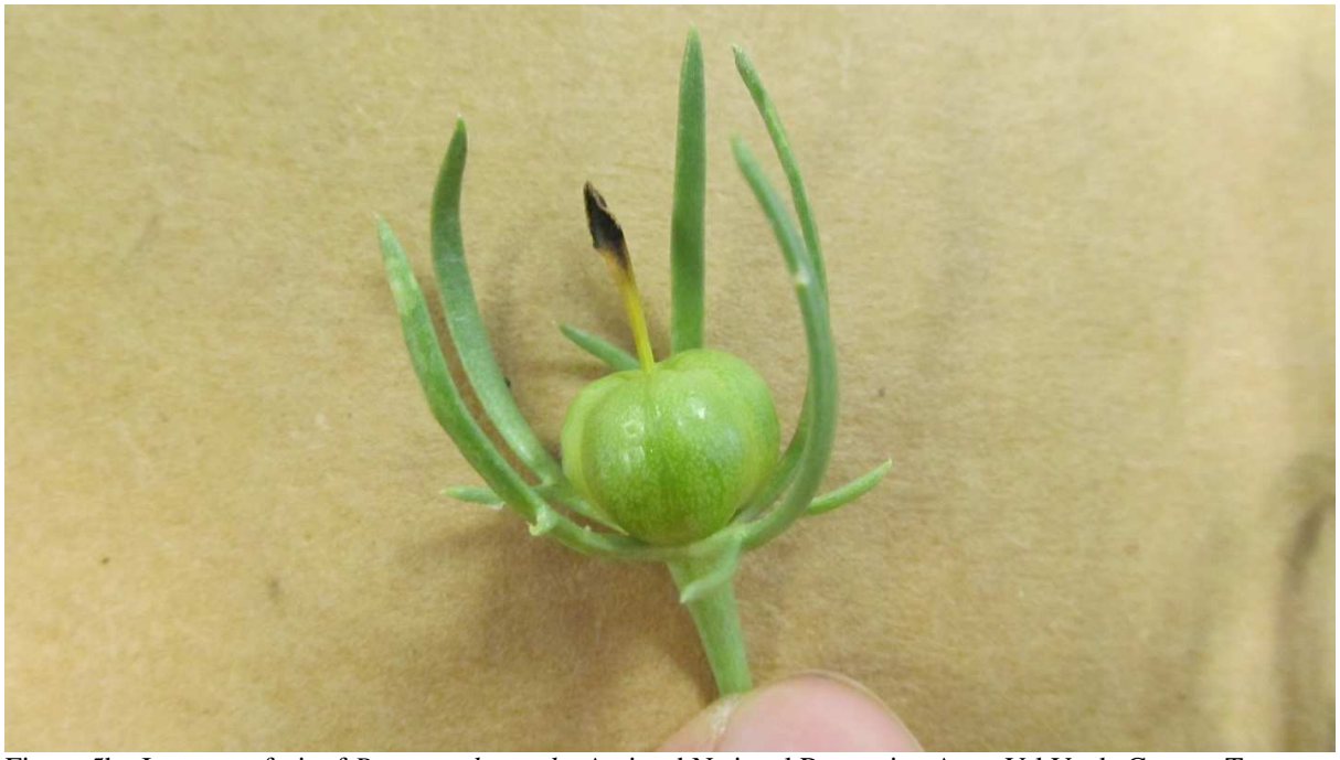
Figure 5b. Immature fruit of Peganum harmala , Amistad National Recreation Area, Val Verde County, Texas.