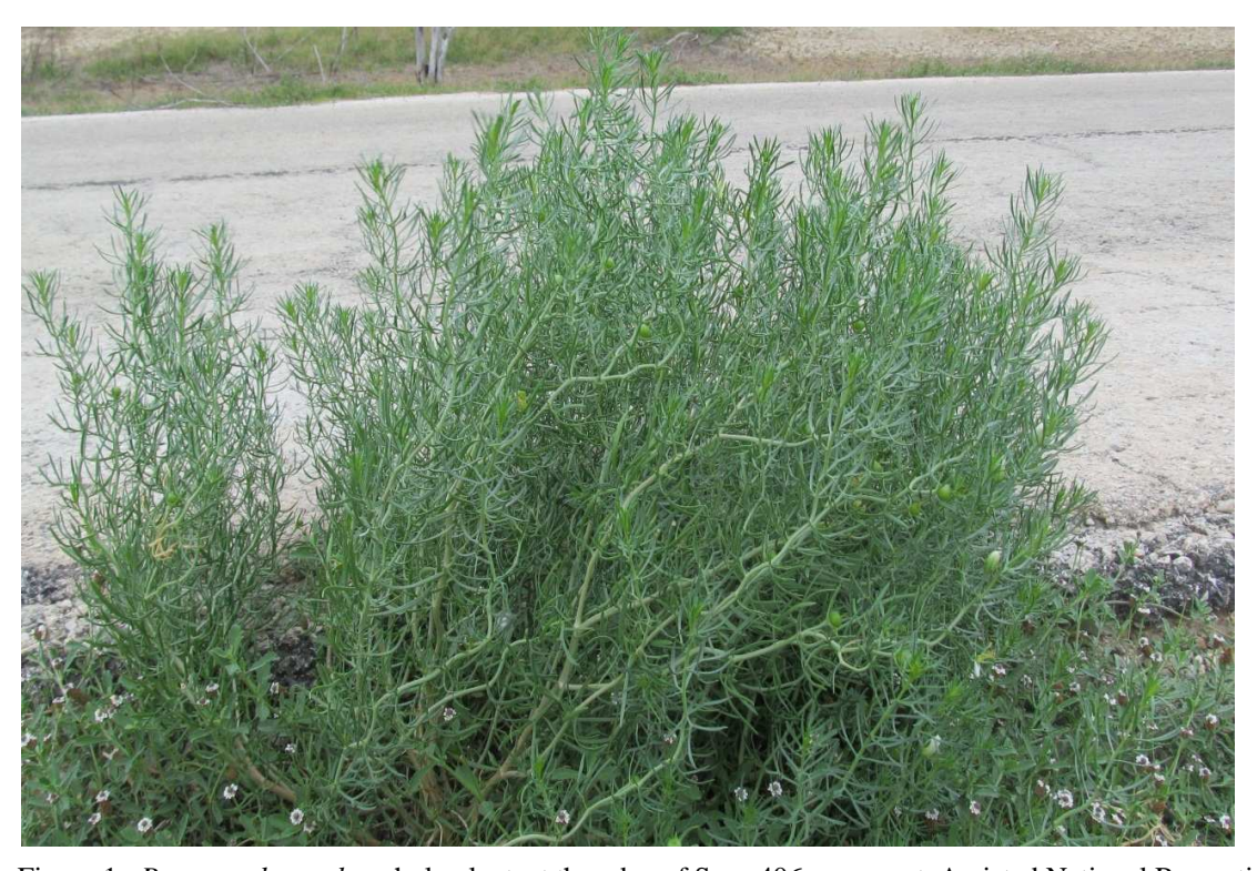
Figure 1. Peganum harmala , whole plant, at the edge of Spur 406 pavement, Amistad National Recreation Area, Val Verde County, Texas.

USDA, NRCS. 2013. The PLANTS Database. National Plant Database Team, Greensboro, North Carolina. <a href="http://www.plants.usda.gov">http://www.plants.usda.gov</a> Accessed June 2013.