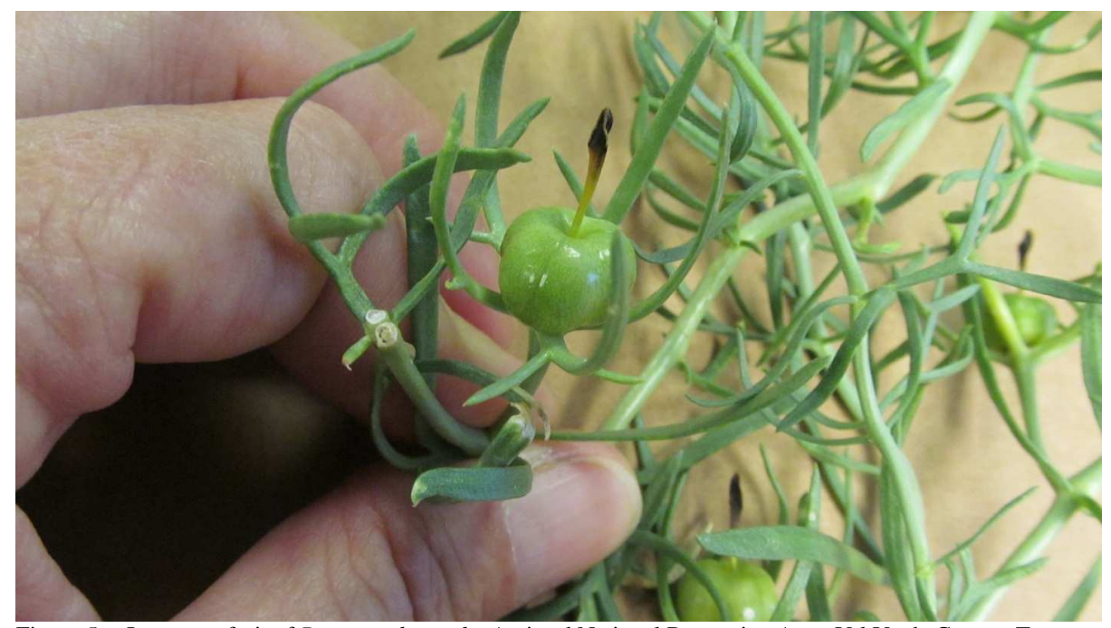
Figure 5a. Immature fruit of Peganum harmala , Amistad National Recreation Area, Val Verde County, Texas.