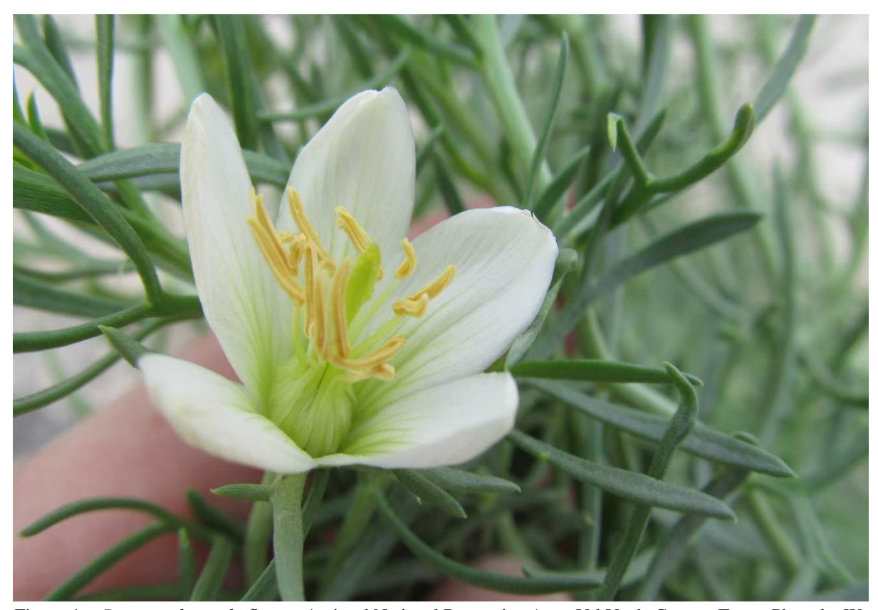
Figure 4a. Peganum harmala flower, Amistad National Recreation Area, Val Verde County, Texas.