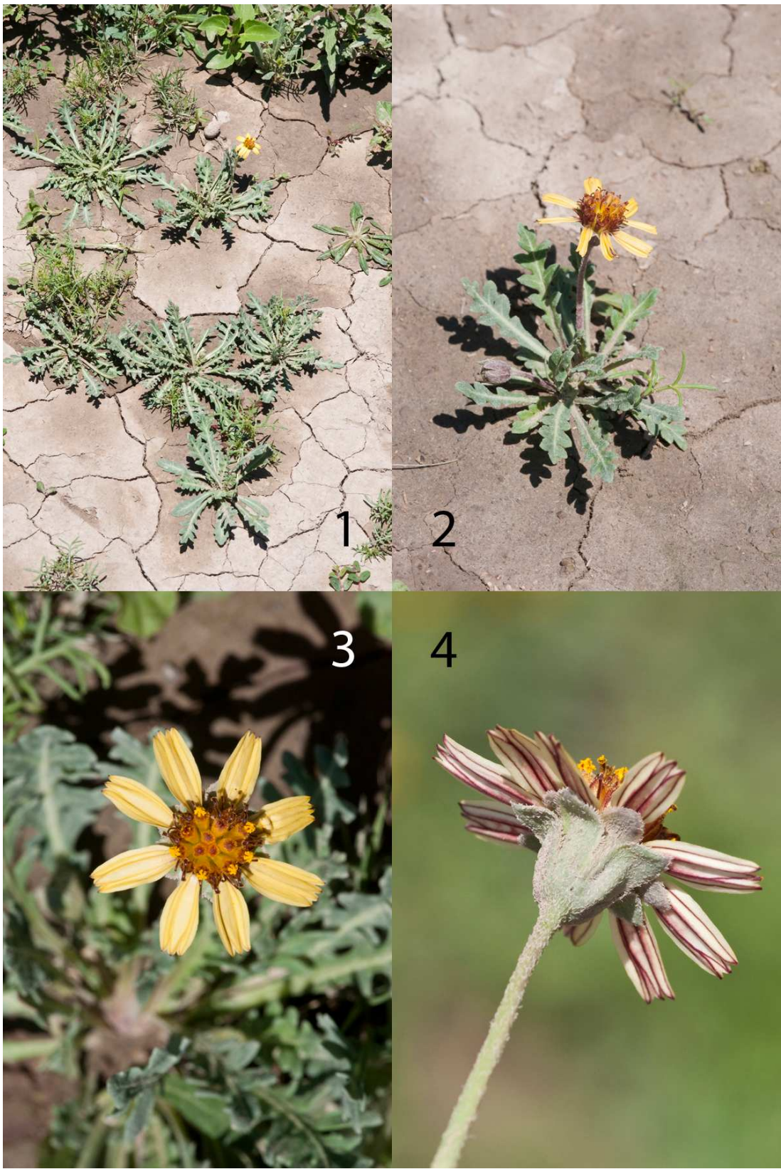
Figures 1-4. Plateilema palmeri from collection 14560 . Fig. 1, cluster of plants on drying clay (larger plants ca. 9 cm diam.); Fig. 2, plant habit; Figs. 3 and 4, view of capitulum (diam. ca. 25 mm