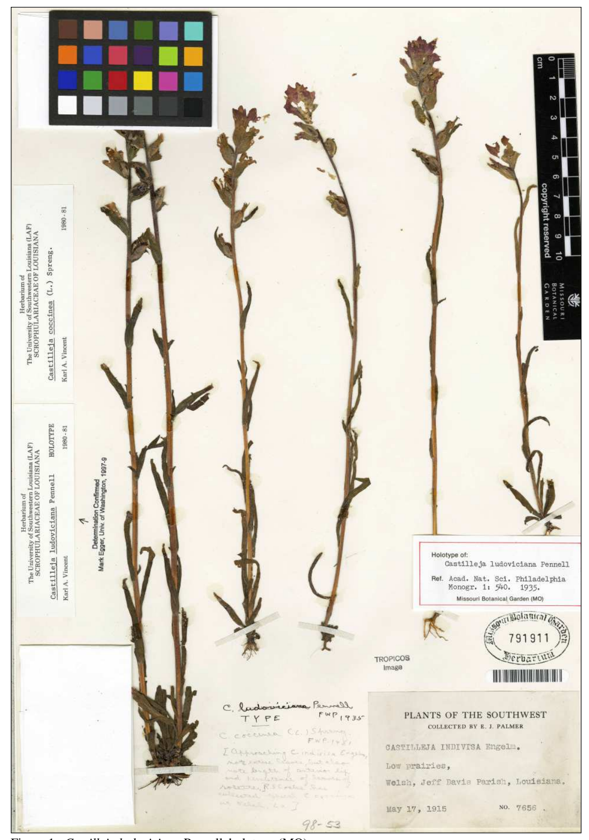
Figure 1. Castilleja ludoviciana Pennell, holotype (MO).