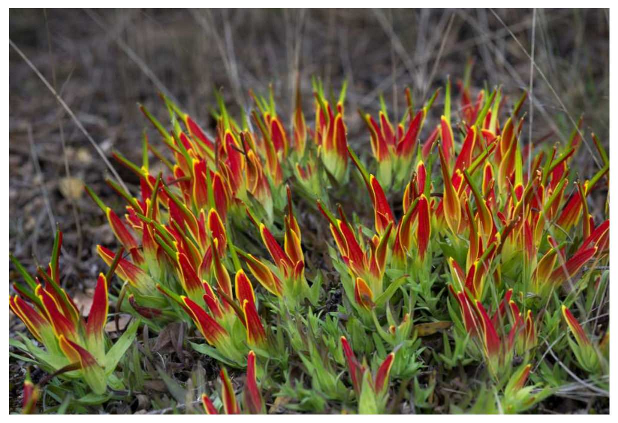
Figure 2. Castilleja tapeinoclada , cluster of plants. Sierra de los Cuchumatanes, Depto. Huehuetenango, Guatemala, 25 May 2013.

In addition to the ambiguous nature of the typification of Castilleja tapeinoclada addressed above, it also appears that there are no extant specimens of any of the relevant Seler collections cited by Loesener, as Seler's primary collections were destroyed in the allied bombing of Berlin in World War II (C. Oberprieler at B, pers. comm., 2003; Harvard University Herbaria Botanist Database). Although some duplicates of Seler's collections are extant, my extensive efforts to locate any of the specimens designated by Loesener in all herbaria known to house at least some Seler collections (A, CAS, DS, F, GH, K, MEXU, MO, NY, US) have been completely unsuccessful. Internet searches of collection databases and type registries have proved equally fruitless. Finally, the three Seler type collections associated with C. tapeinoclada do not appear to be among the historical type images obtained by J.F. Macbride from European herbaria and now housed at F.