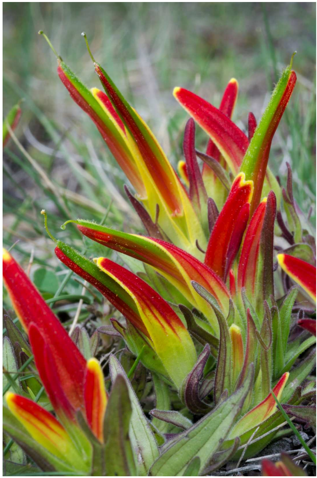
Figure 1. Castilleja tapeinoclada , flowers and bracts. Photo by Fred Muller, Sierra de los Cuchumatanes, Depto. Huehuetenango, Guatemala, 15 May 2011.