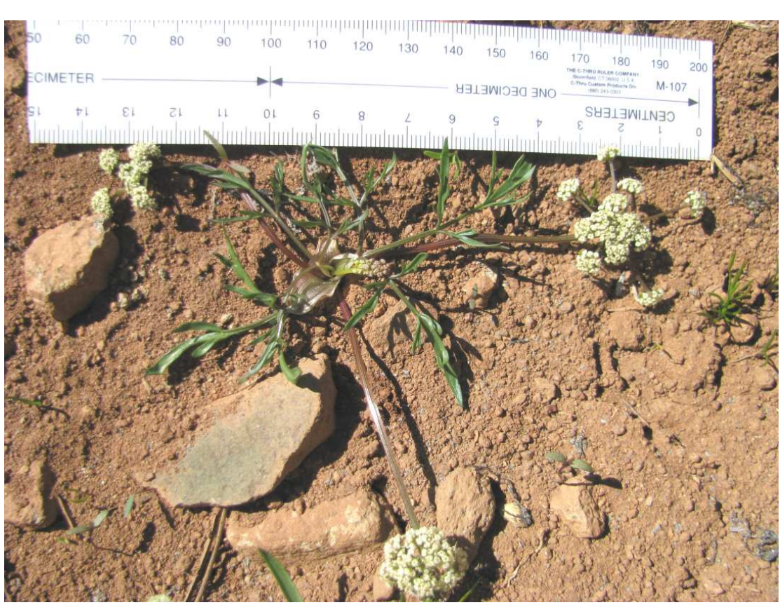
Figure 2. Lomatium tarantuloides. Mature plant at anthesis in situ at type locality.