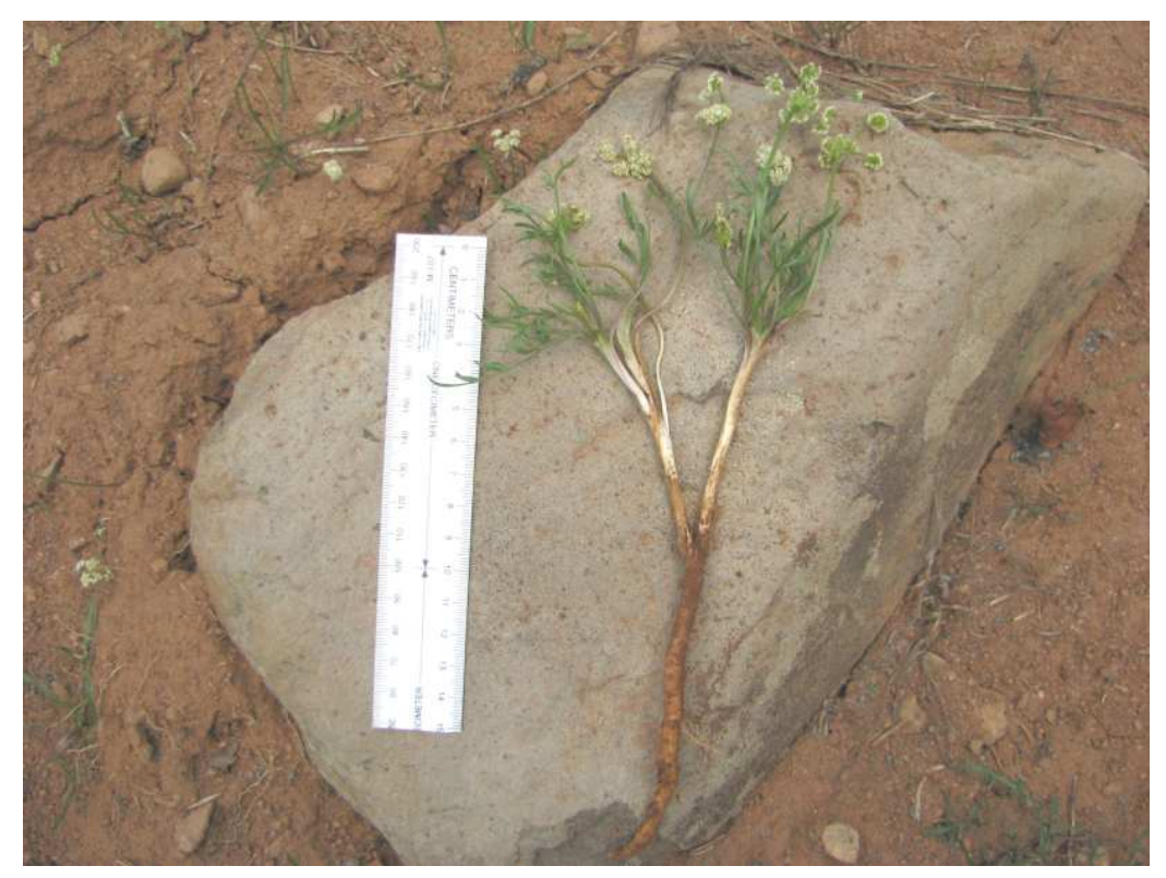
Figure 3. Lomatium tarantuloides. Mature plant at anthesis with typical taproot morphology.