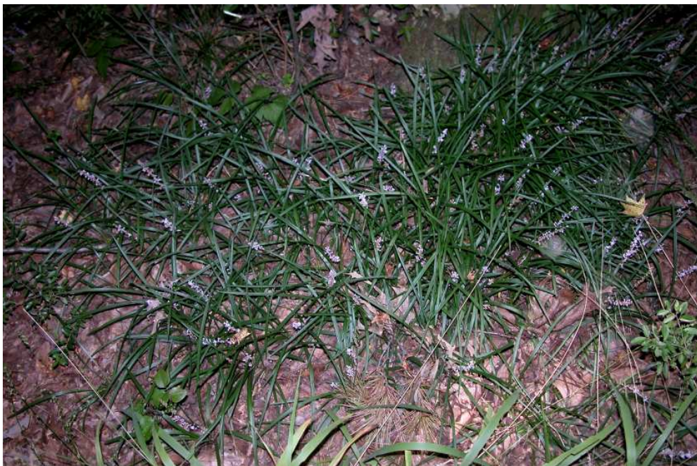
Figure 5. Another, distinct colony of naturalized Liriope graminifolia from Pulaski County. The portion of the riparian zone where this colony occurs is a semi-wooded, flattened expanse just above the stream bank; this area contained several scattered colonies of L. graminifolia . A number of the plants/ramets in these colonies had nearly mature fruits.