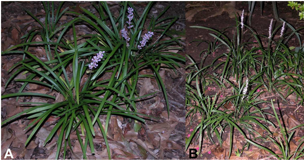
Figure 8. Escaped plants of Liriope graminifolia from Clark County, Arkansas. . (A) Serviss 8361. (B) Serviss 8360. Cultivated plants of the species are in the vicinity of both groups of escaped plants; however, spread from stoloniferous offsets is not likely as both groups are several meters from the nearest cultivated individuals. Rather, establishment via seeds probably occurred.

Additionally, we document a second occurrence of L. graminifolia outside of cultivation in Arkansas. Two small, escaped colonies of L. graminifolia were discovered growing in highly disturbed areas on the Henderson State University (HSU) campus in Clark County (Fig. 8). Liriope graminifolia is regularly cultivated on the campus and plants have been observed spreading from cultivated material via stoloniferous offsets (Serviss et al. 2016). Cultivated plants of L. graminifolia on the campus also produce fruit. The two colonies are separated by over 50 m and thus represent two independent escaped occurrences. The method of escape is unknown, although dispersal via seed is likely.