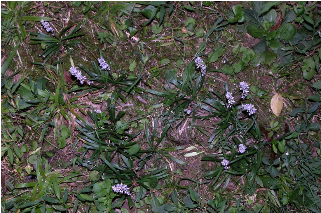
Figure 7. Similar colony of Liriope graminifolia to that shown in Fig. 6; this colony was smaller and the entirety of it is represented by the 10–12 ramets seen in the photograph. The ramets of this colony were still connected via stolons and it occurred in a mowed area at the edge of the riparian zone.