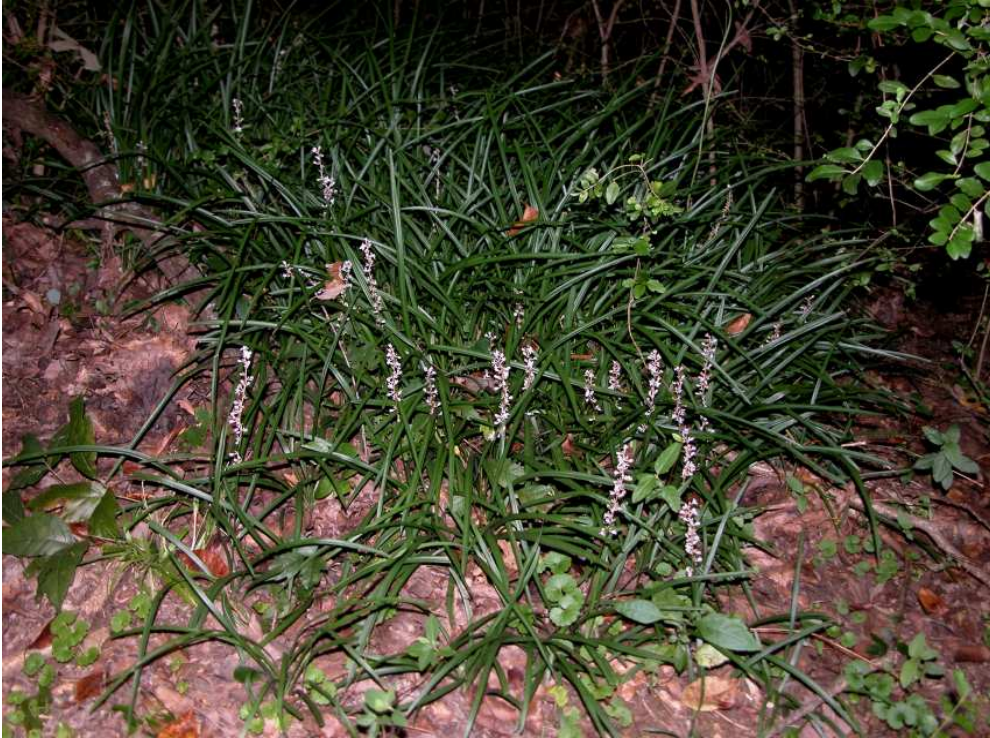
Figure 4. Plants/ramets from a portion of the largest observed colony of naturalized Liriope graminifolia from Pulaski County. This colony consisted of probably 100s of plants/ramets and extends from the edge of the riparian zone well into the woods along the stream. These plants appeared to have spread from individuals of L. graminifolia that were persistent from cultivation in an adjacent yard — spread from the persistent plants appeared to be predominately accomplished from stoloniferous offsets and occurred over a distance of several meters from the original area of cultivation.