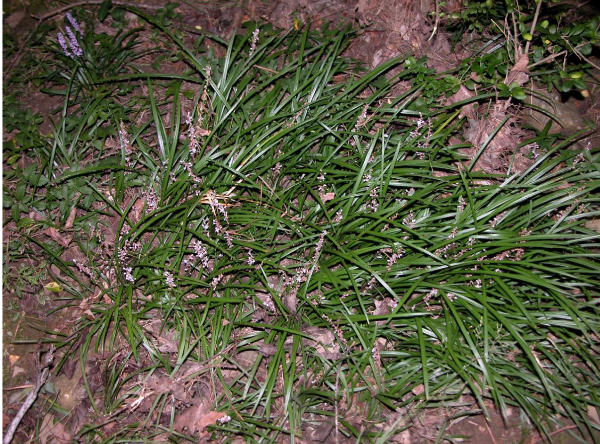
Figure 3. One of the larger colonies of naturalized plants of Liriope graminifolia from Pulaski County showing vegetative establishment via stoloniferous offsets (many offsets may be seen around the periphery of the main cluster of plants/ramets). Also, notice the plant of L. muscari (Dcne.) L. H. Bailey in the upper left corner of the photograph. Numerous naturalized individuals of L. muscari and the related Ophiopogon japonicus (Thunb.) Ker-Gawl. also were present at the Pulaski County site.

In 2016, 13 distinct colonies of L. graminifolia , ranging from about a half-dozen plants to 100s of individuals and/or ramets, were discovered along a 3/10 of a mile (530 m) stretch of a small stream in a highly disturbed riparian habitat in Pulaski County, Arkansas (Figs. 3–7). Naturalized L. graminifolia plants were observed growing in both semi-open and wooded areas. Plants were in flower and many ramets also possessed nearly mature fruits.