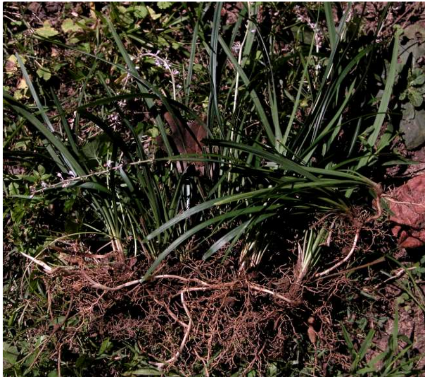
Figure 2. Naturalized plants of Liriope graminifolia from Pulaski County, Arkansas showing leaves, well-developed stolons, roots, and inflorescences (notice the inflorescences are equal in length or longer than the leaves — this aids in distinguishing it from the morphologically similar, L. spicata Lour. which typically has inflorescences positioned well below the leaves).