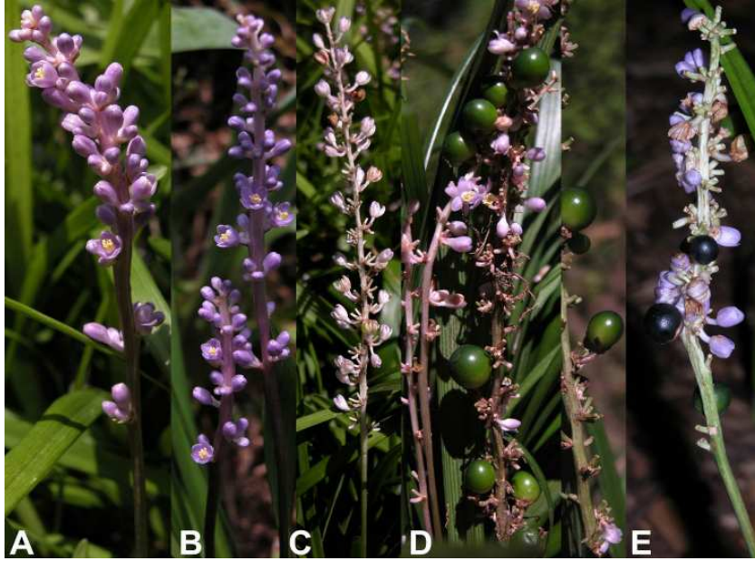
Figure 1. Liriope graminifolia flowers, fruits (seeds with fleshy sarcotestas), inflorescences, and infructescences. (A–B) Close-up of flowers and young inflorescences. (C) Older inflorescence (notice the coloration has faded from purple to pale lavender). (D) Infructescences and nearly mature fruits. (E) Mature fruits — two, nearly black fruits may be seen in the photograph.