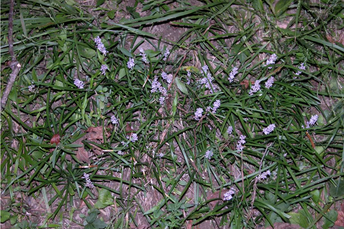
Figure 6. Small colony of naturalized Liriope graminifolia from Pulaski County (distinct from those shown in previous figures). These plants were smaller than most of the others and appeared to have only recently produced flowers. This colony was growing in a flat, semi-open area near the edge of the riparian zone.