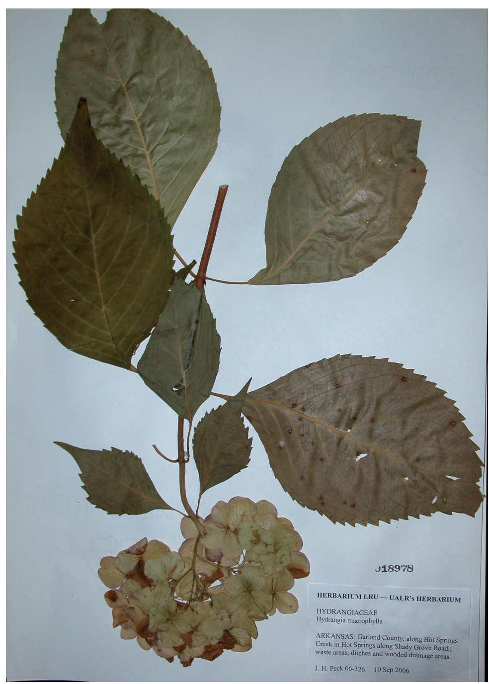
Figure 4. Specimen of spontaneous Hydrangea macrophylla from Garland County, Arkansas.

Hydrangea is a genus of perhaps 25–30 species of deciduous or evergreen trees, shrubs, and lianas distributed primarily over eastern Asia, with a few species also in North America (McClintock 1957; van Gelderen & van Gelderen 2004), although Krüssmann (1977) and Wei and Bartholomew (2001) recognize more than 70 species. Several species of Hydrangea are prized as ornamentals for their showy, colorful flowers. Hydrangea macrophylla (Thunb.) Ser. (big–leaf hydrangea, French hydrangea), arguably the most important ornamental species in the genus, is a deciduous shrub to 3 meters that is native to Japan (Bailey & Bailey 1976; Krüssmann 1977). It is commonly cultivated in the southern USA, including Arkansas, and hundreds of horticultural varieties of it have been developed (Krüssmann 1977; Dirr 2002; van Gelderen & van Gelderen 2004). Two principal groups