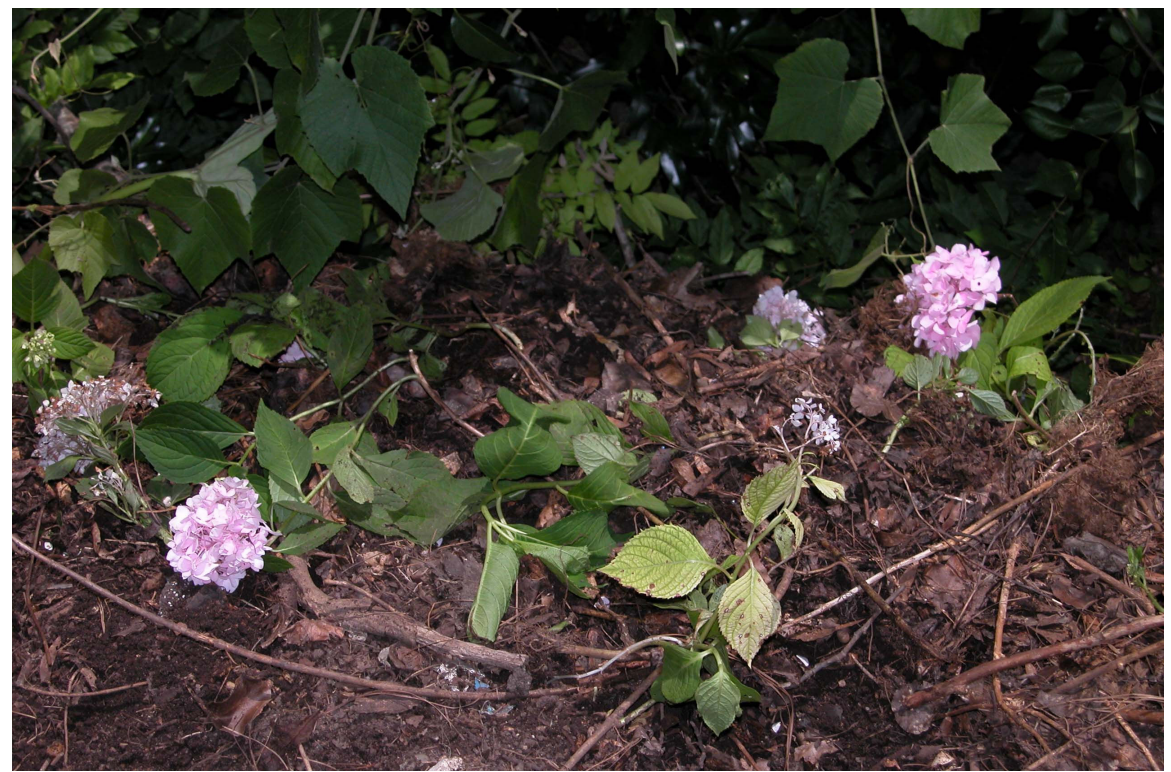
Figure 1. Adventive plants of Hydrangea macrophylla from Clark County, Arkansas. Each stem represents a separate plant; several may be seen in the photograph. Plants apparently were establishing from horticultural discards that were previously dumped at the site. Several large heaps of horticultural discards and lawn waste were present.