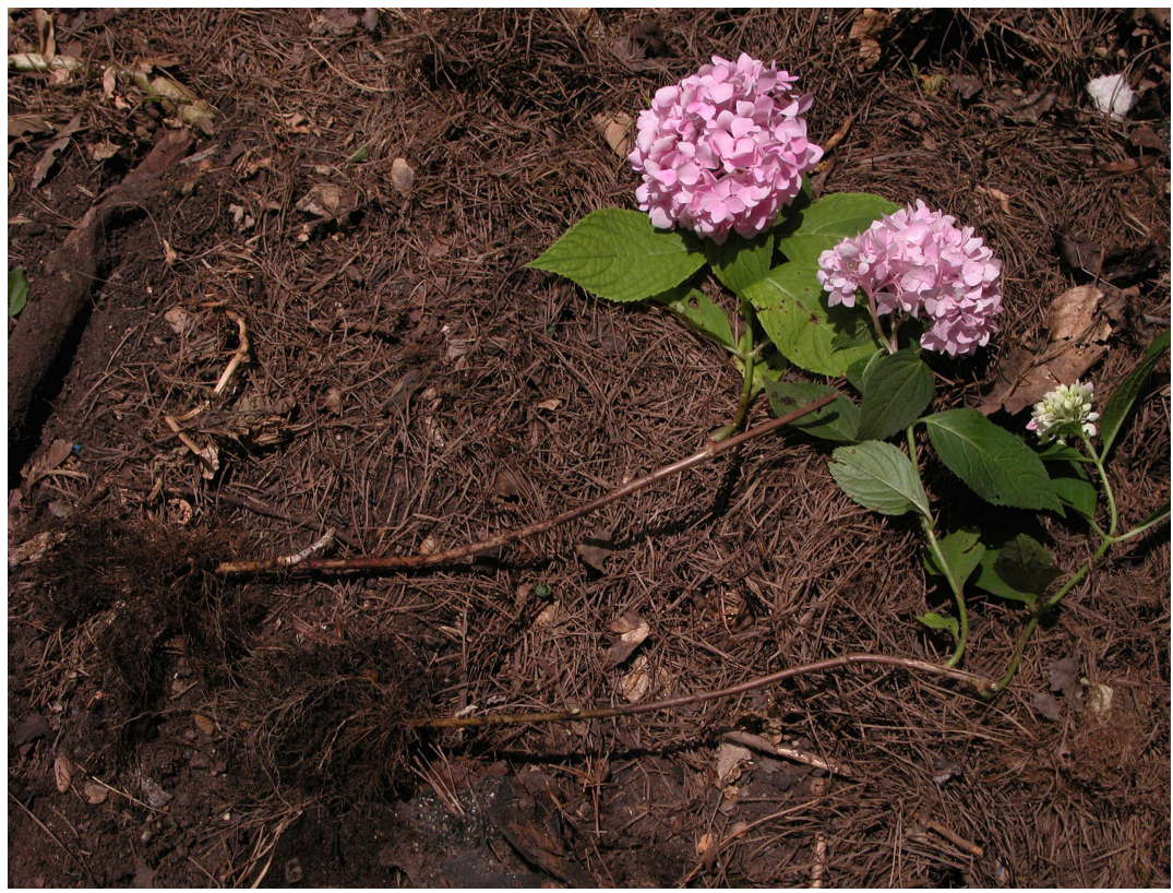
Figure 2. Close–up view of two of the adventive Hydrangea macrophylla plants from those shown in Fig. 1. Notice the well–rooted stems with numerous adventitious roots present where stems were previously buried within litter and debris.