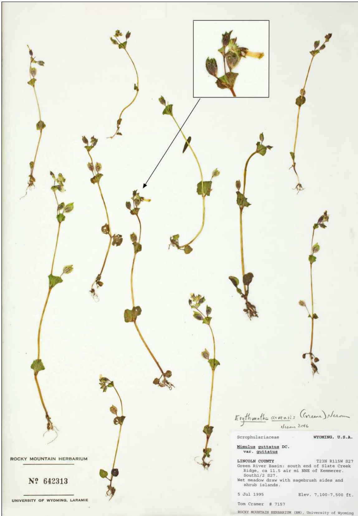
Figure 2. Erythranthe arvensis from Lincoln Co., Wyoming (Cramer 7157, RM), in typical morphology for the species. Inset shows enlargement of inflorescence with characteristic cleistogamous corolla.