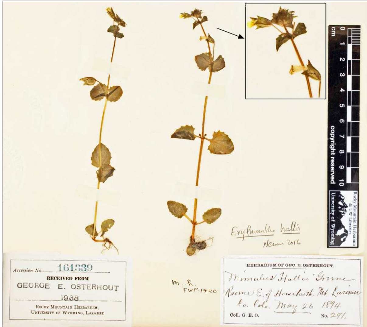
Figure 4. Representative collection of Erythranthe hallii , Larimer Co., Colorado (Osterhout 291, RM). Note the characteristic cleistogamous corollas (see inset).