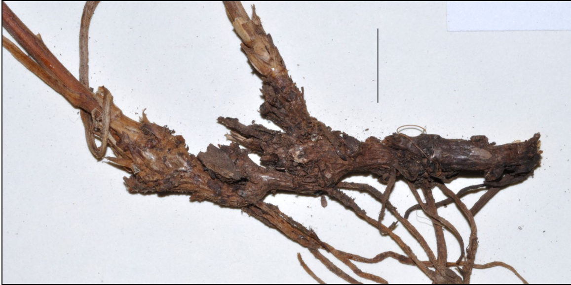
Figure 4. Details of addition specimens of Solidago correllii : rootstock, Moore & Steyermark 3629 (LL). Scale bars = 1 cm.