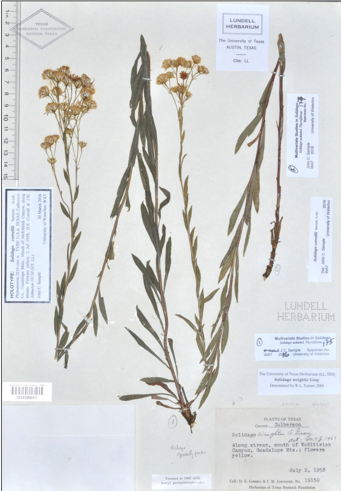
Figure 1. Holotype of Solidago correllii Semple; Correll & Johnston 19150 (LL).