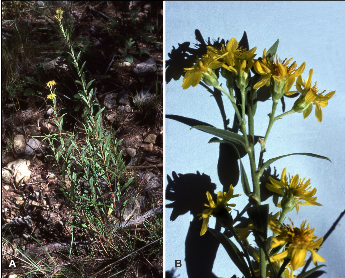
Figure 6. Solidago correllii in the field, Guadalupe Mts. National Park, the Bowl Trail, 7880 ft. elev., Semple & Heard 8185. A. Habitat. B. Flowering heads.