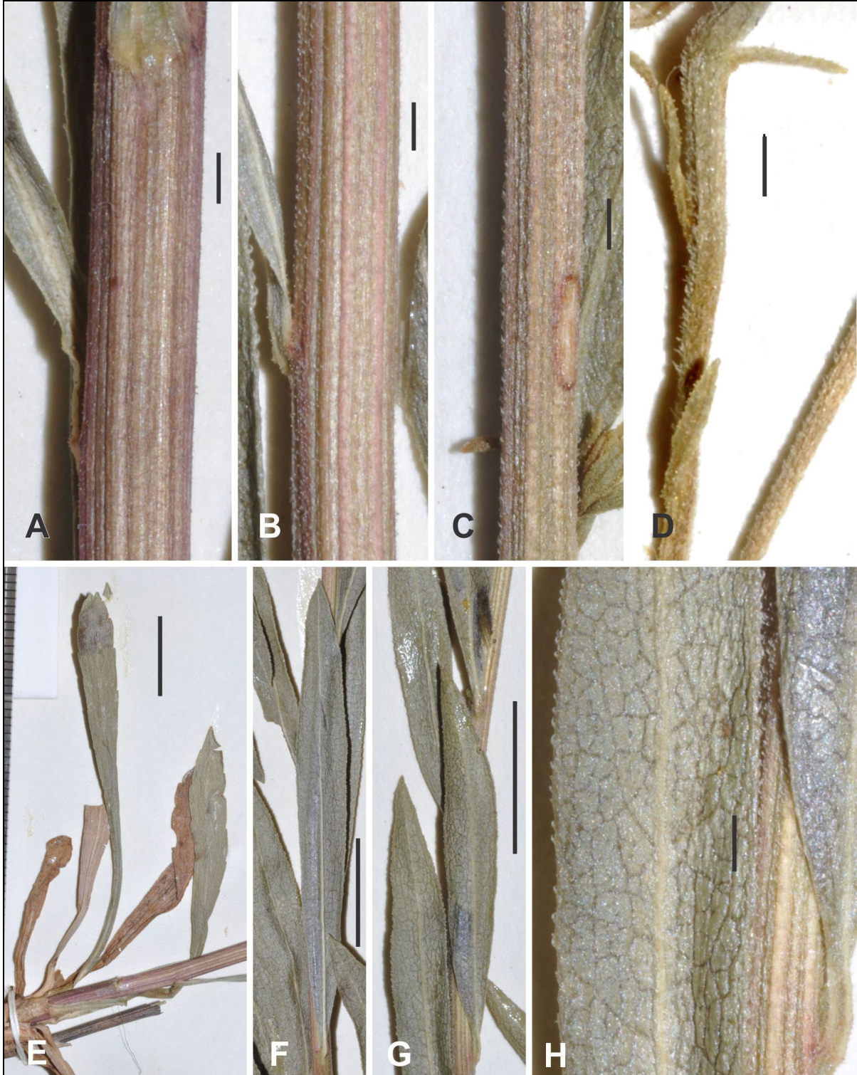
Figure 2. Details of holotype of Solidago correllii : stems and leaves. A-C . Lower, mid and upper stems. D . Peduncles. E . Lower stem leaves from base of stem. F . Mid stem leaf. G . Upper stem leaves. H . Upper stem leaf, adaxial surface. Scale bar = 1 mm in A-D, H; = 1 cm in E-G.