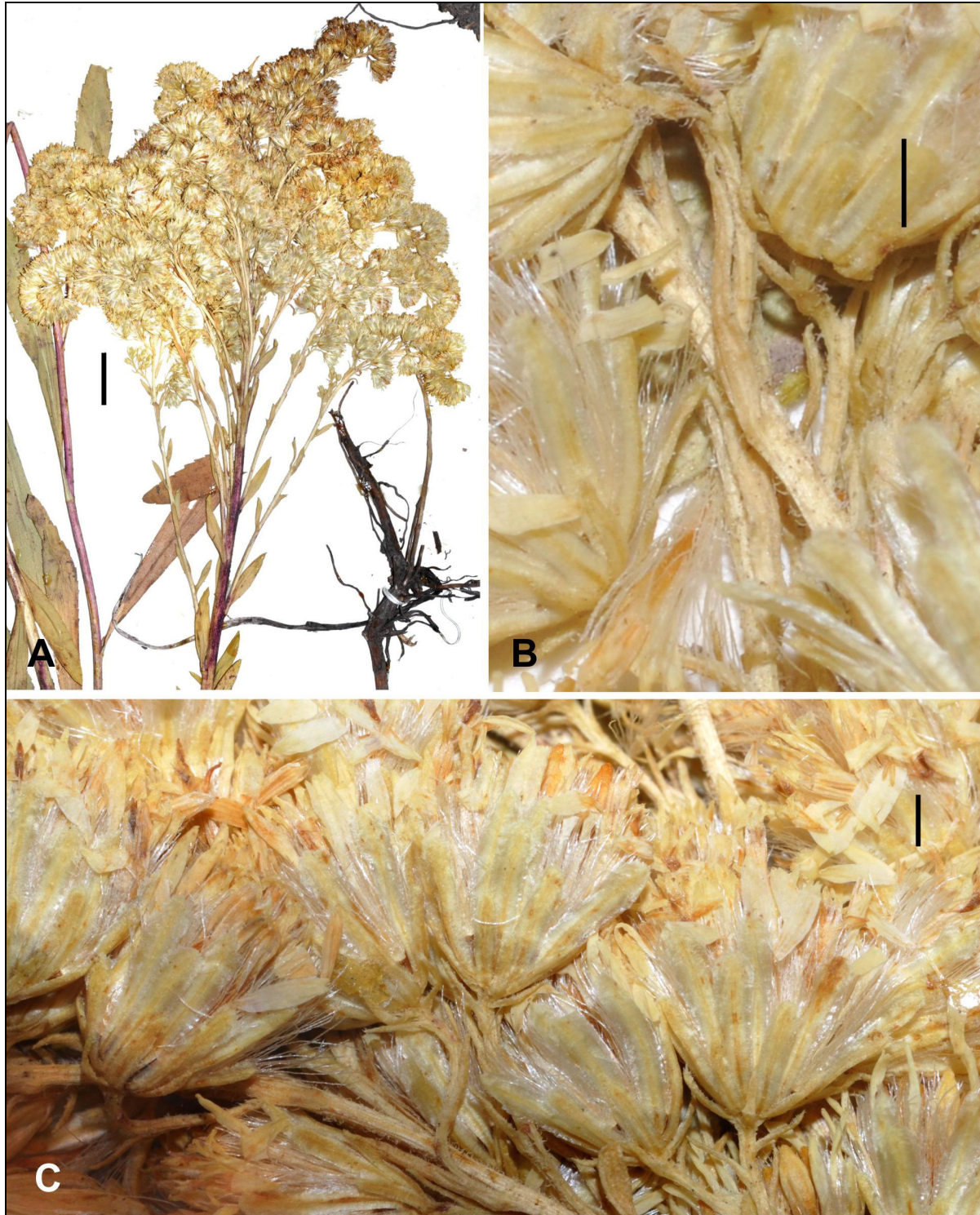
Figure 3. Details of holotype of Solidago macvaughii : floral traits. A. Inflorescence of 98 cm tall shoot. B. Peduncles and bracts. C. Heads. Scale bar = 1 cm in A; = 1 mm in B and C.