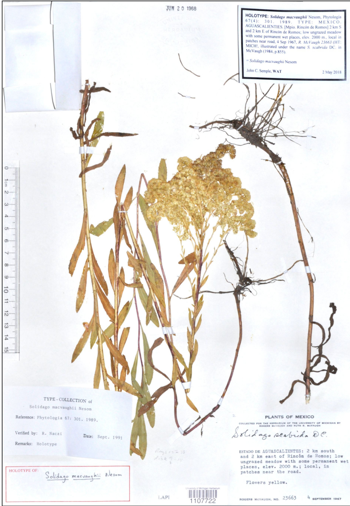
Figure 1. Holotype of Solidago macvaughii from Aguascalientes, Mexico.