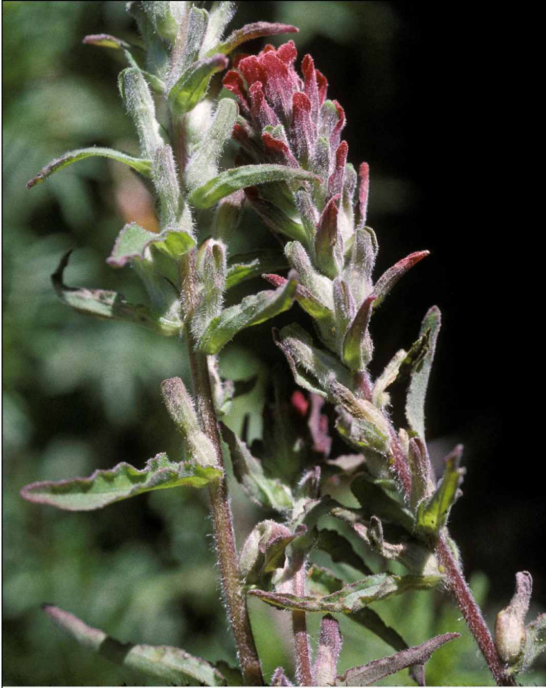
Figure 5. Castilleja arvensis var. arvensis , east of Agallpampa, Depto. La Libertad, Peru, 16 Apr 2005.