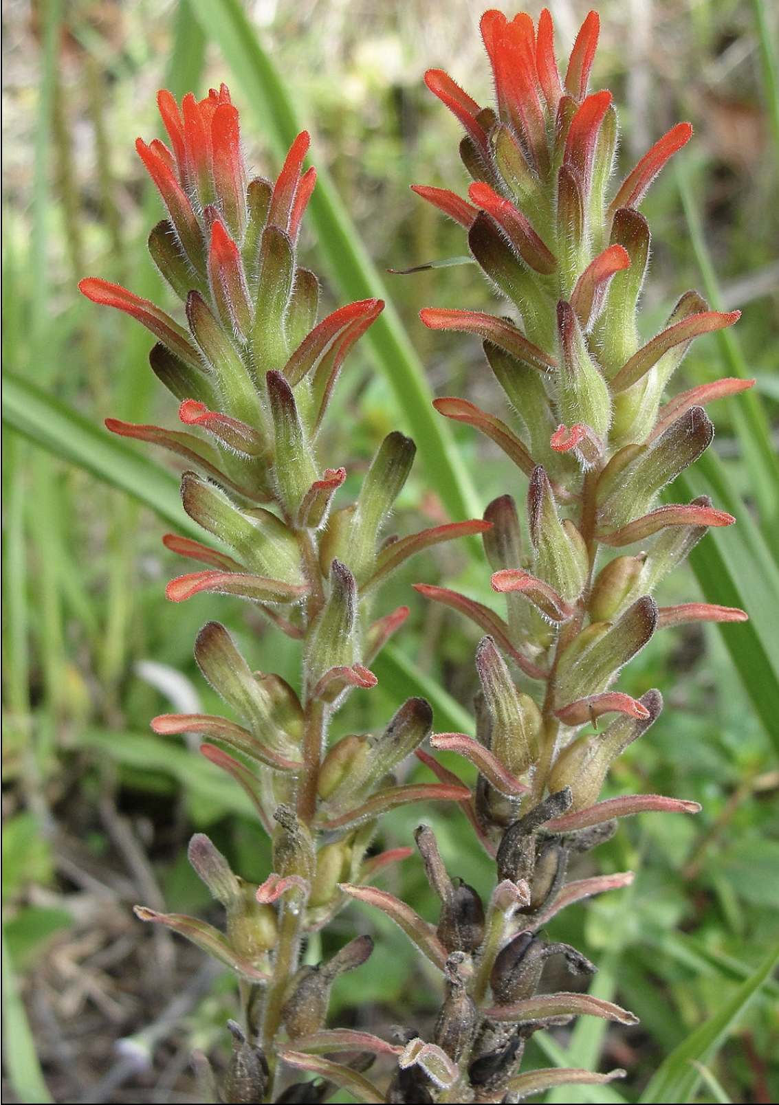
Figure 4. Castilleja arvensis var. pastorei , Serro de Mar Mountains, Rio Grande do Sul, Brazil, 8 Nov 2011.