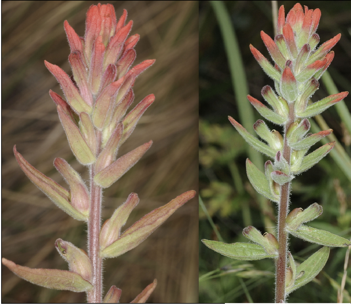
Figure 2. Two examples of Castilleja arvensis var. pastorei , from Santa María Department, 4 Nov 2017 (L) and from Cruz del Eje Department, 4 Mar 2012 (R), Prov. Córdoba, Argentina.