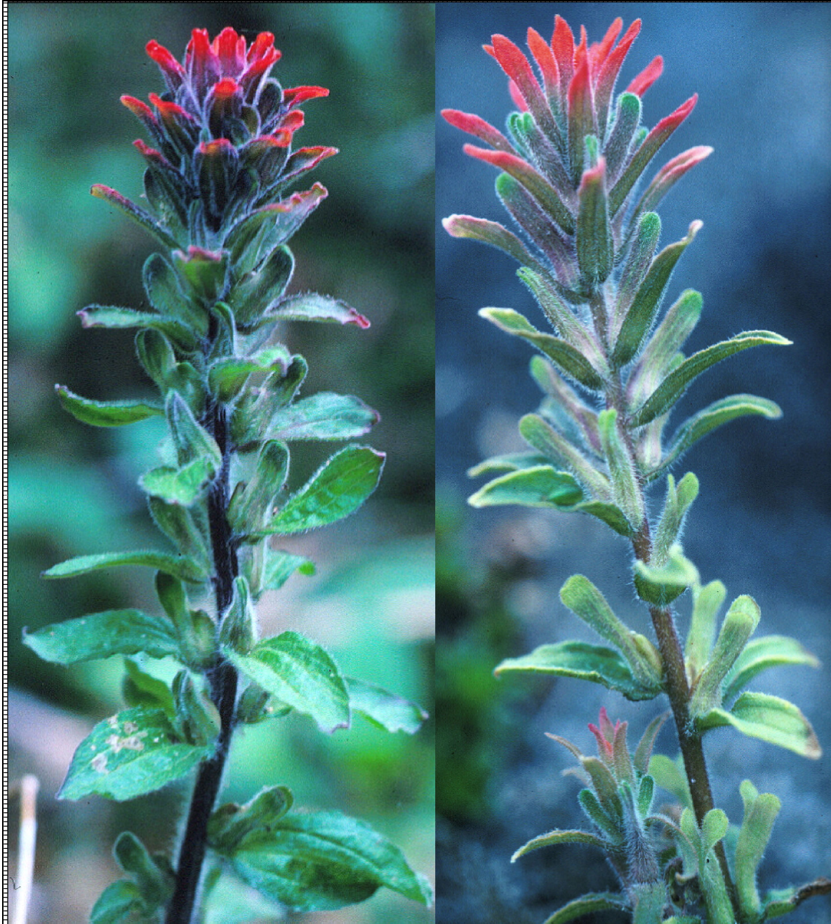
Figure 6. Castilleja arvensis var. arvensis , Pasachoa Forest Reserve, Pichincha Prov., Ecuador, 13 Jul 1987 (L); Kipuka P'uu O'o, Island of Hawaii, 14 Jul 1999.