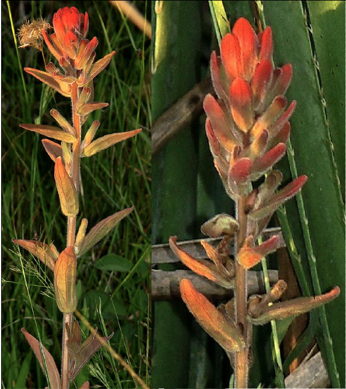
Figure 3. Castilleja arvensis var. pastorei from Uruguay, precise location unknown, 9 Dec 2011.