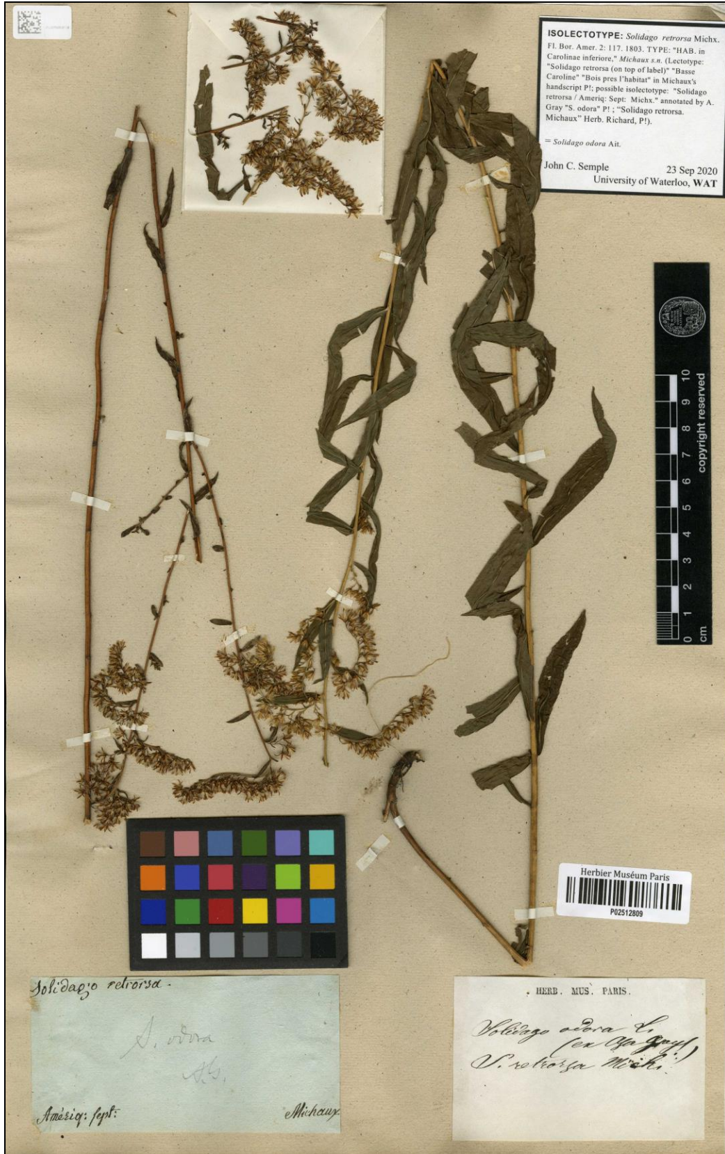
Figure 2. Possible isolectotype/syntype of Solidago retrorsa Michx. Michaux s.n., on left (P). Barcode: P02512809. < http://coldb.mnhn.fr/catalognumber/mnhn/p/p02512809 >