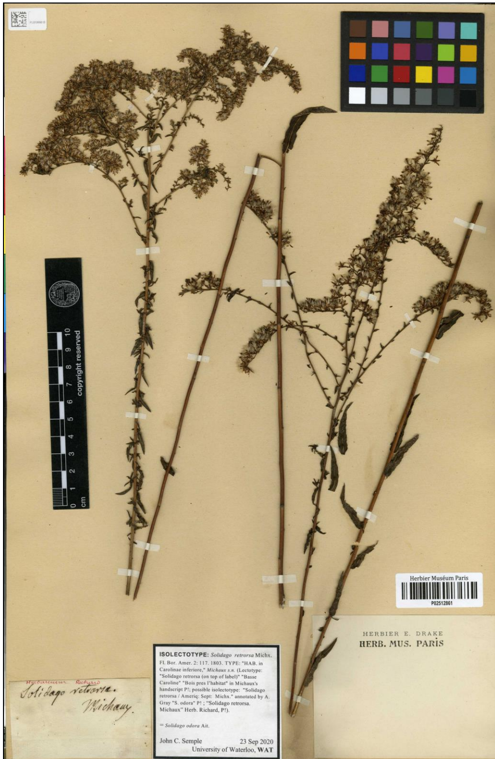
Figure 3. Possible isolectotype/syntype of Solidago retrorsa Michx. Michaux s.n. (P). Barcode: P02512861. < https://science.mnhn.fr/institution/mnhn/collection/p/P02512861 >