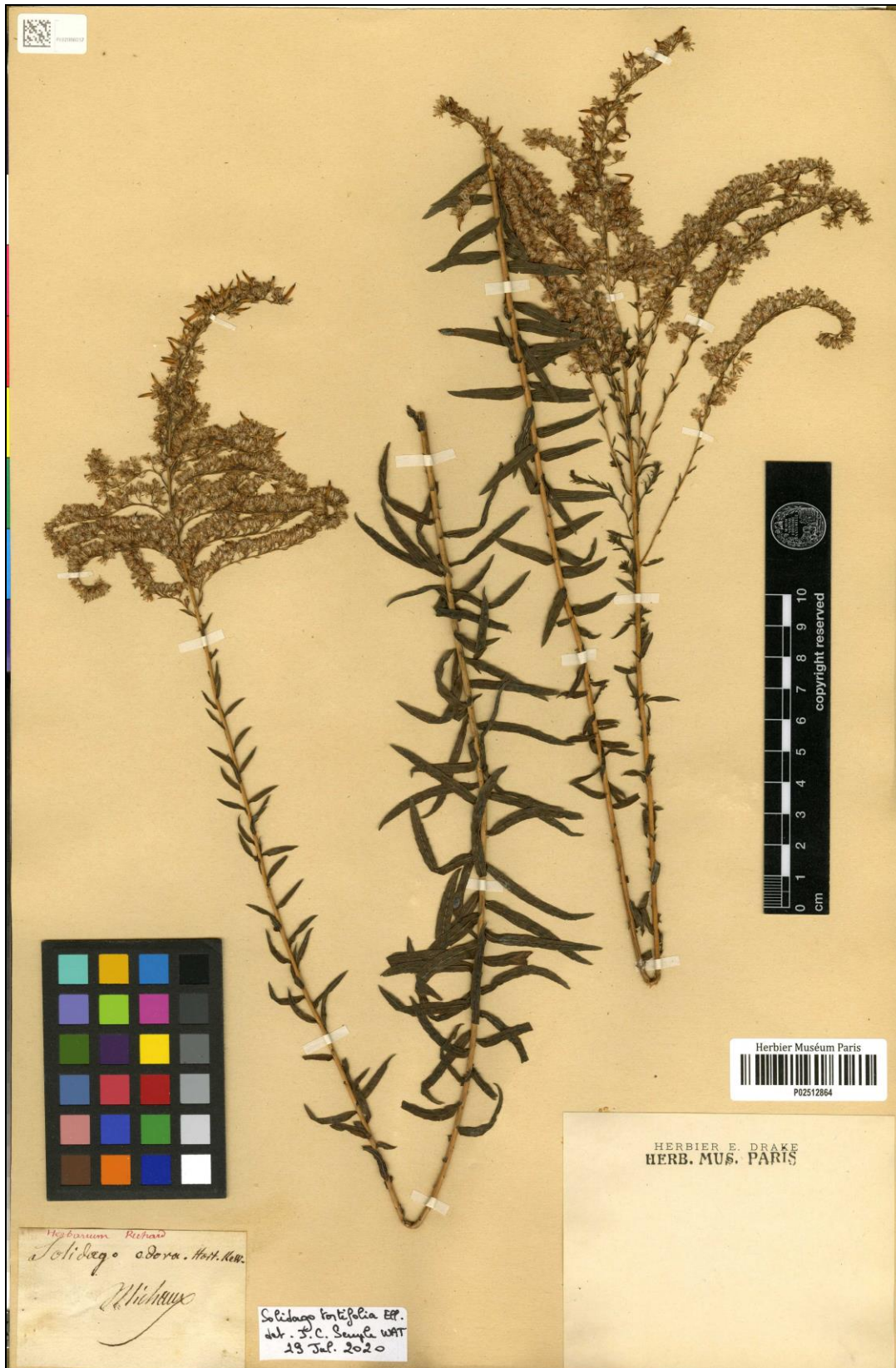
Figure 5. Solidago odora collection that is S. tortifolia . Michaux s.n. (P). Barcode: P02512864. < https://science.mnhn.fr/institution/mnhn/collection/p/P02512864 >