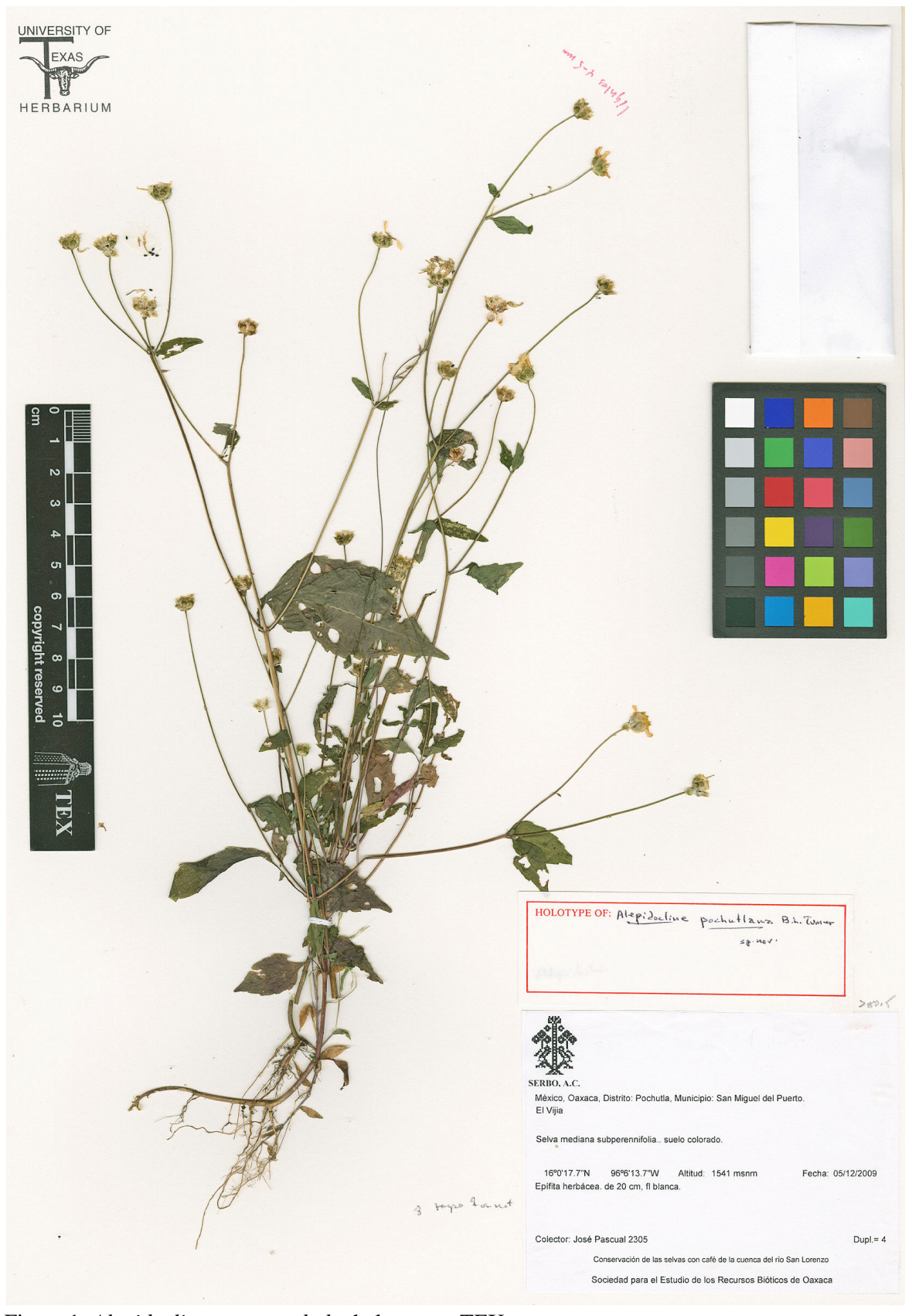
Figure 1. Alepidocline macrocephala, holotype at TEX.