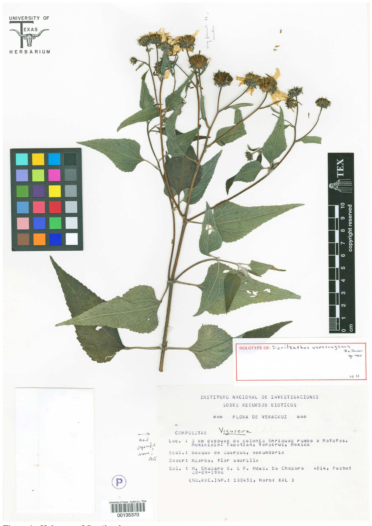
Figure 1. Holotype of Davilanthus veracruzanus.