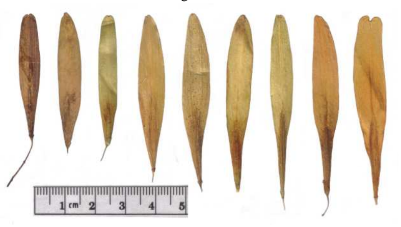
Figure 1. Samara variation in Fraxinus profunda .