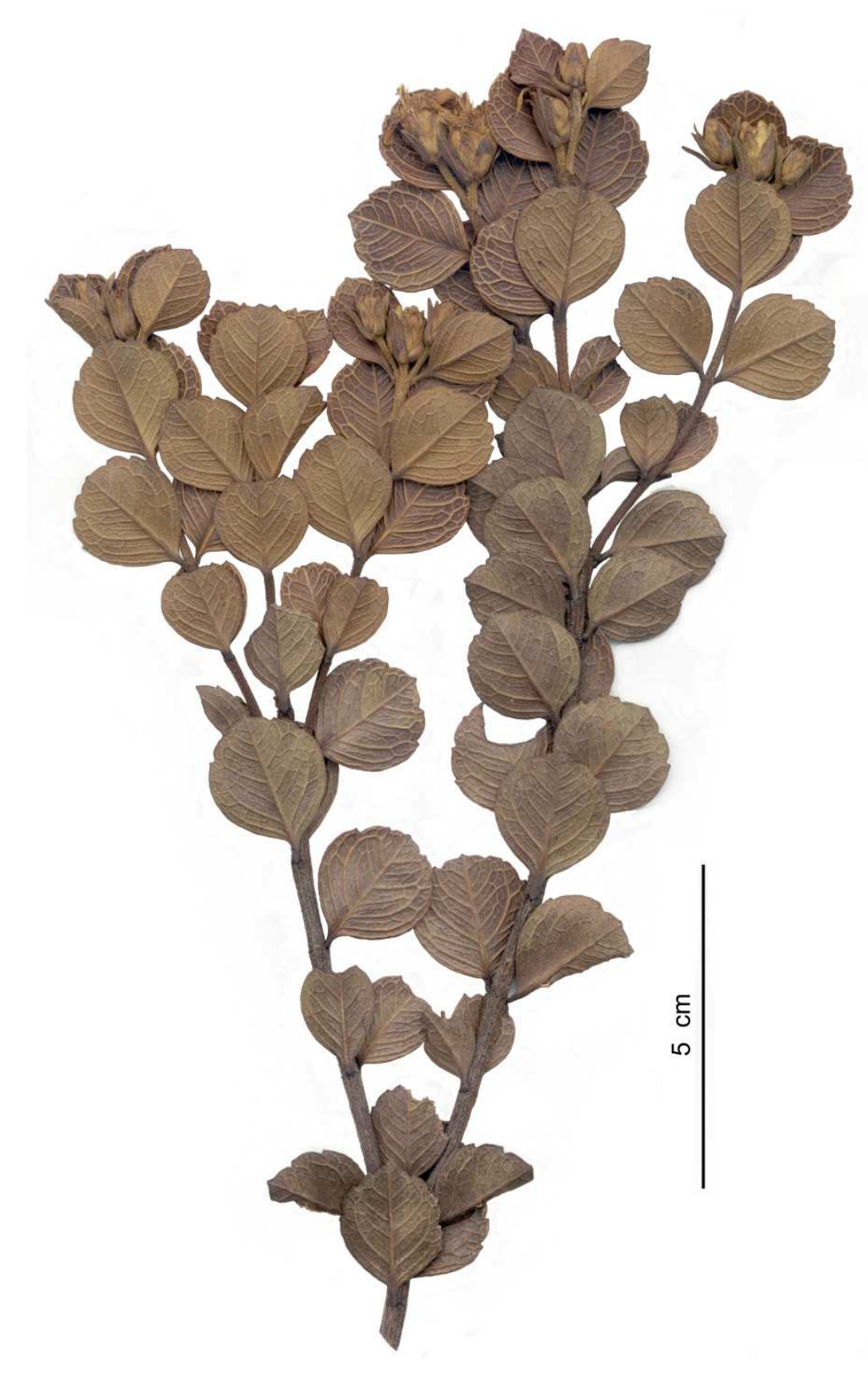
Figure 5. Calea venosa Pruski. Photograph of the holotype ( Huber 12294 , MO) showing the prominently veined leaves.