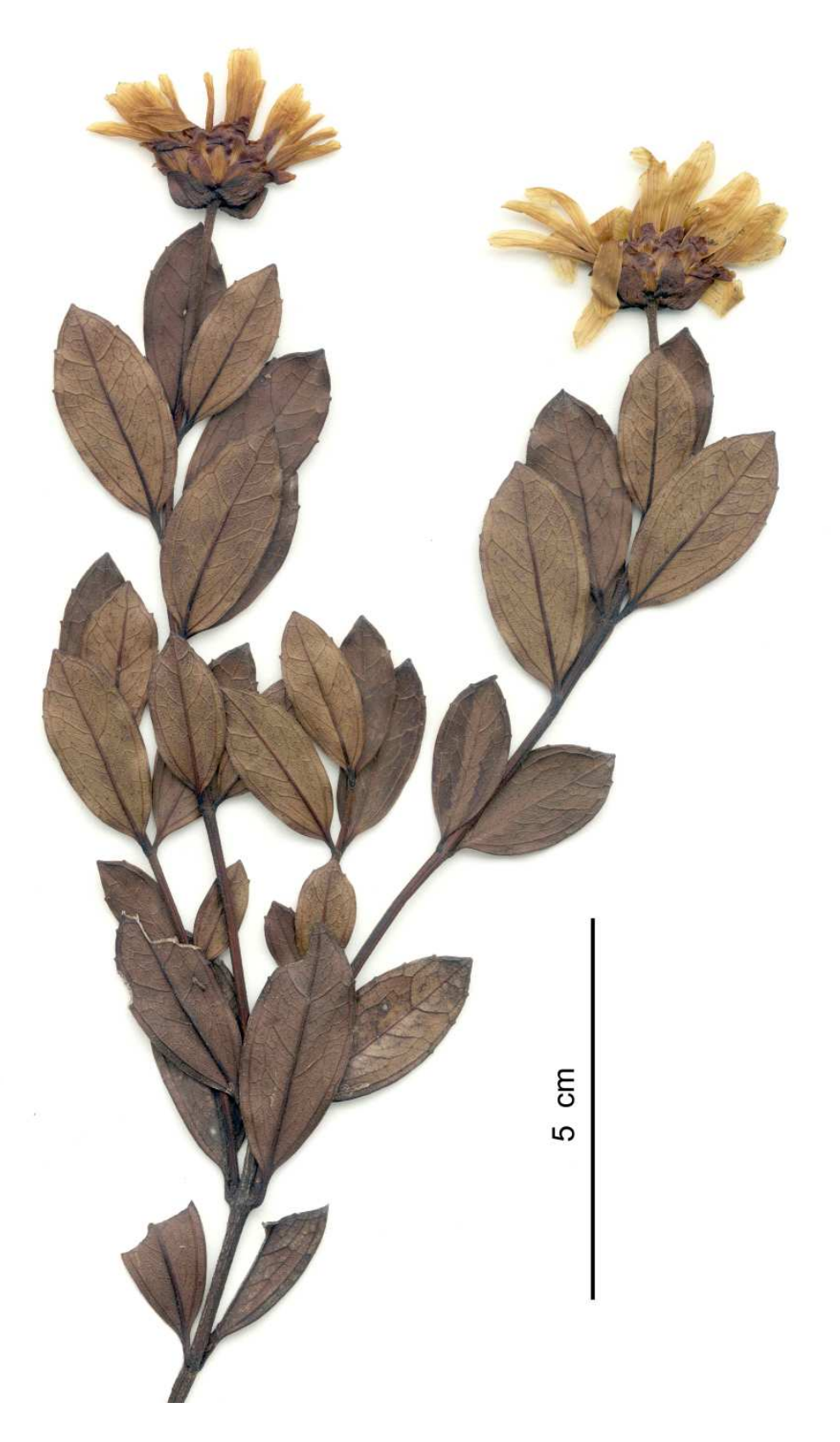
Figure 3. Calea granitica Pruski. Photograph of an isotype ( Huber 12821 , MO) showing the double involucre and leaves 3-veined from near the base.