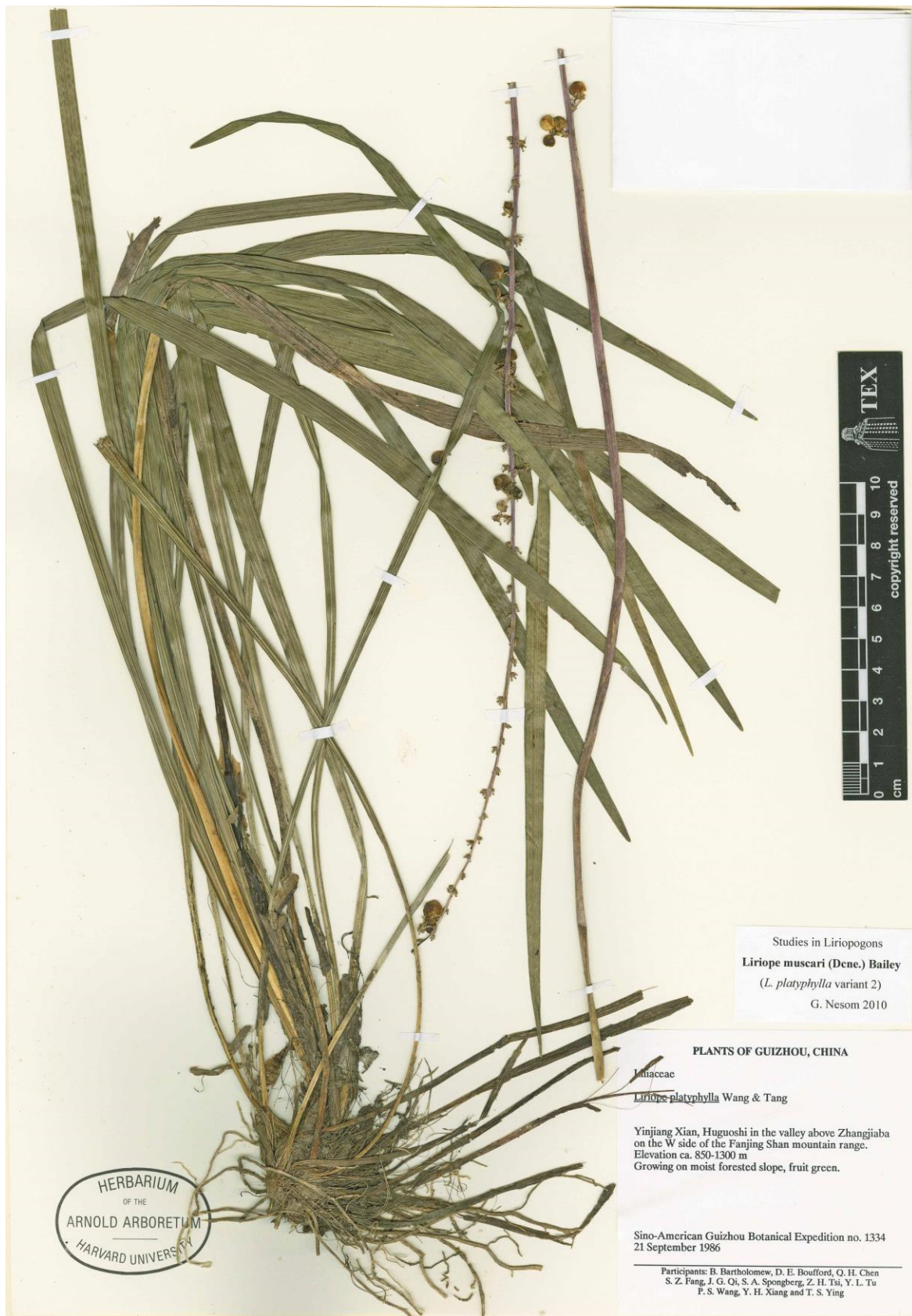
Figure 7. Liriope muscari sensu lato, variant of “ platyphylla ” expression (see comments in text).