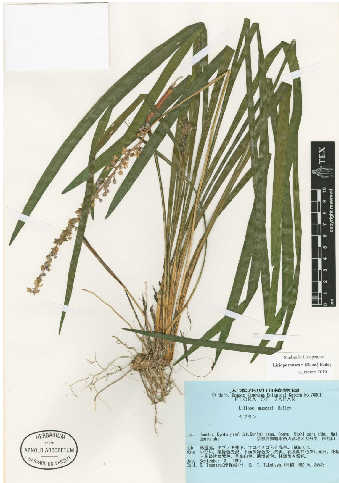
Figure 3. Liriope muscari , typical expression. Note the short, thickened rhizome, apparently more commonly characteristic of this species in Japan than elsewhere.