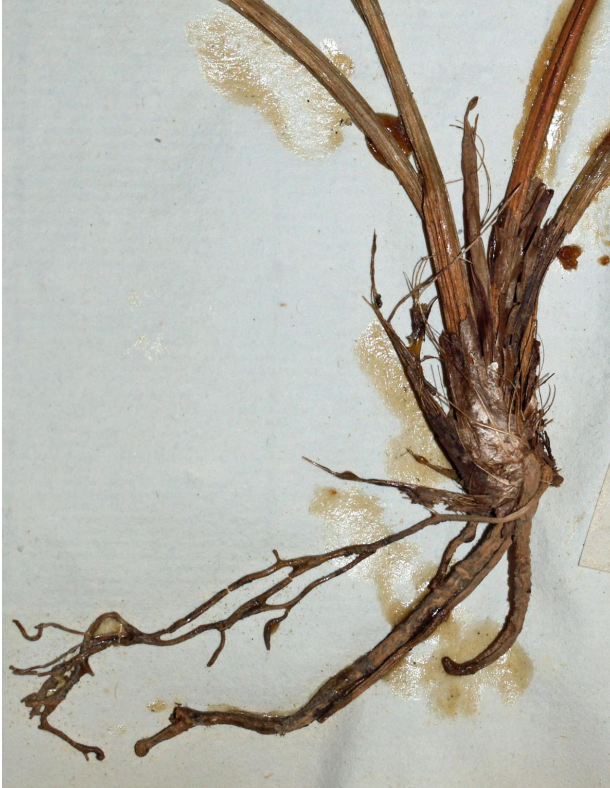
Figure 2. Detail from holotype of Convallaria spicata Thunb. at UPS. Structures at the base are fibrous roots, the thicker ones contractile.