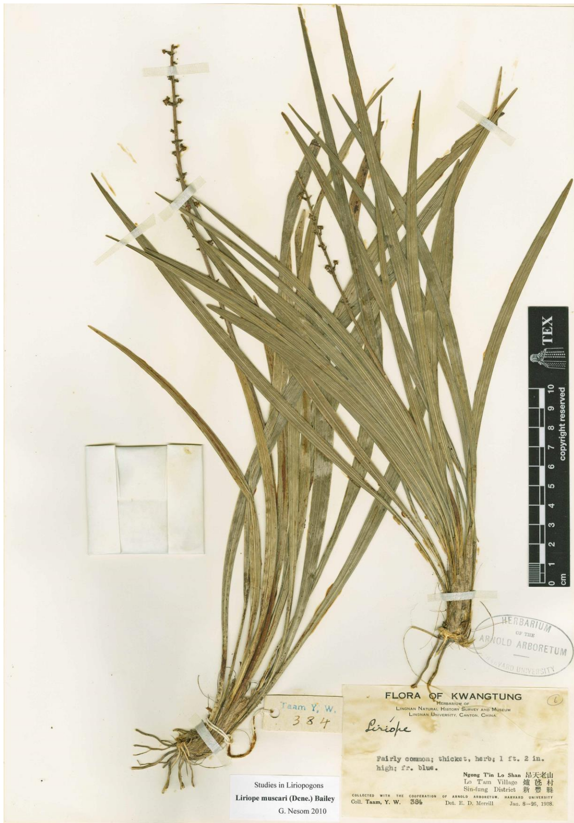
Figure 4. Liriope muscari , typical expression. Base apparently strictly caespitose.