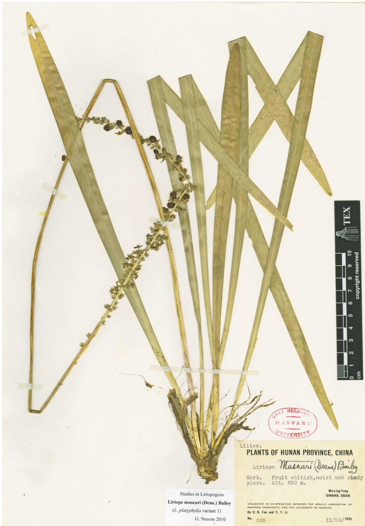
Figure 6. Liriope muscari sensu lato, “ platyphylla ” expression (see comments in text).