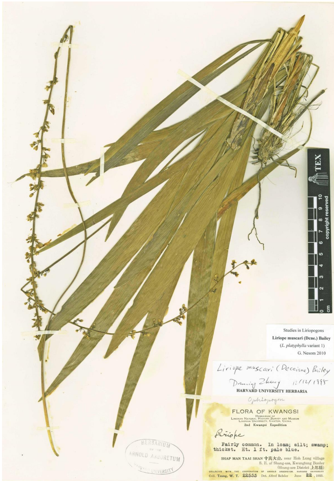
Figure 5. Liriope muscari sensu lato, “platyphylla” expression (see comments in text).