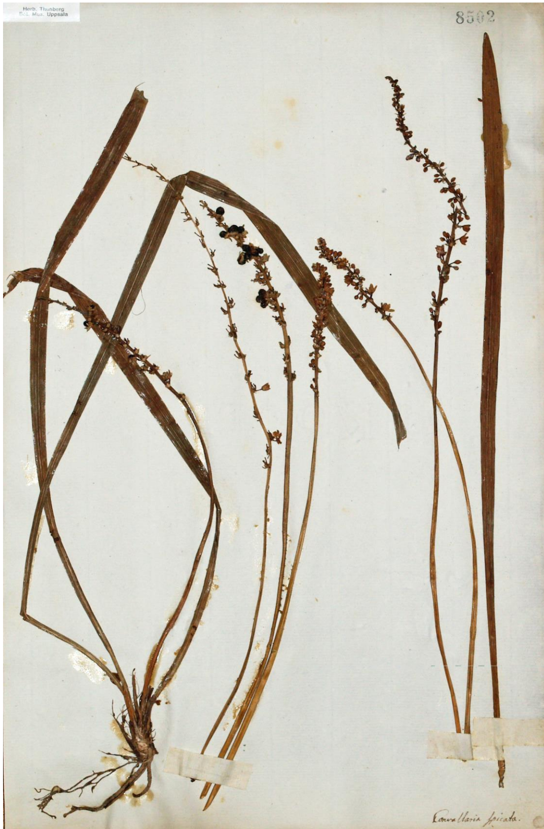
Figure 1. Holotype of Convallaria spicata Thunb. at UPS. Identified here as Liriope muscari (Dcne.) L.H. Bailey.