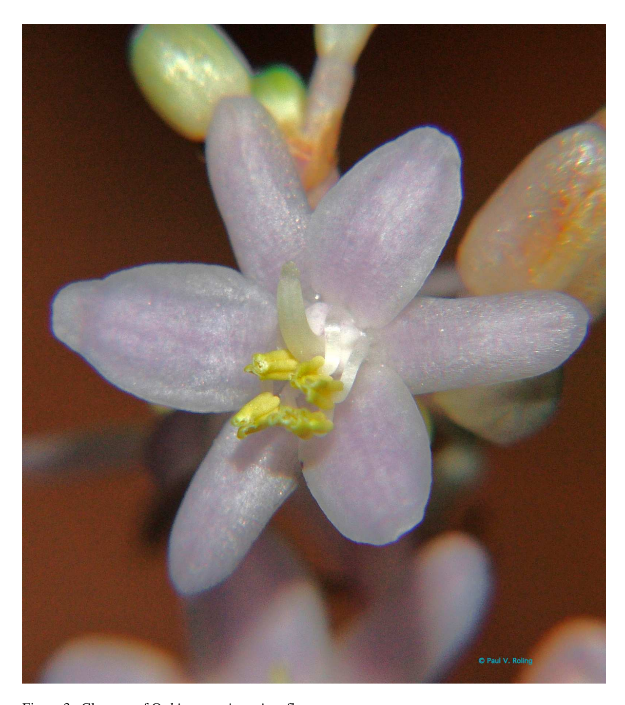
Figure 3. Close-up of Ophiopogon japonicus flower.