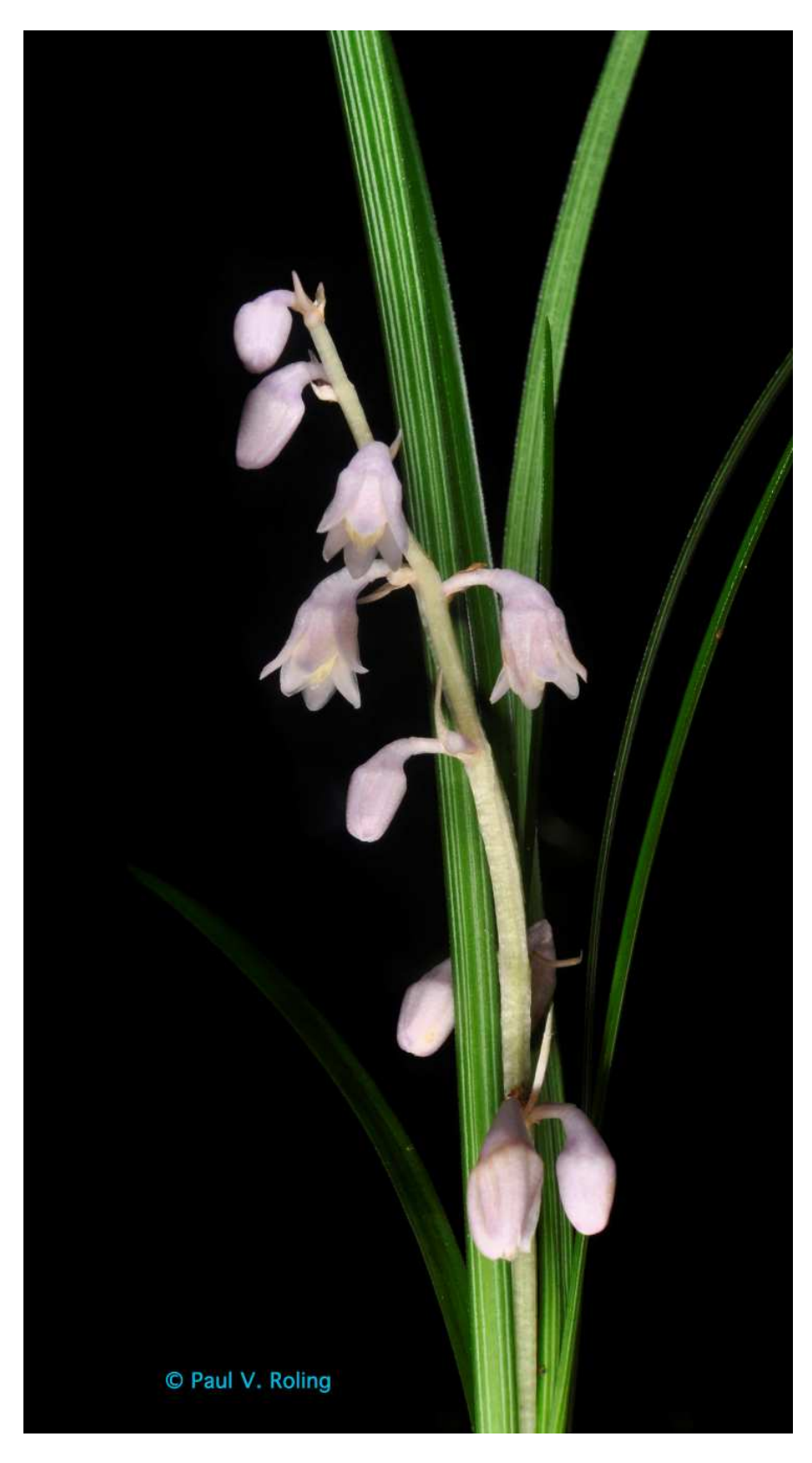
Figure 2. Ophiopogon japonicus scape in flower.