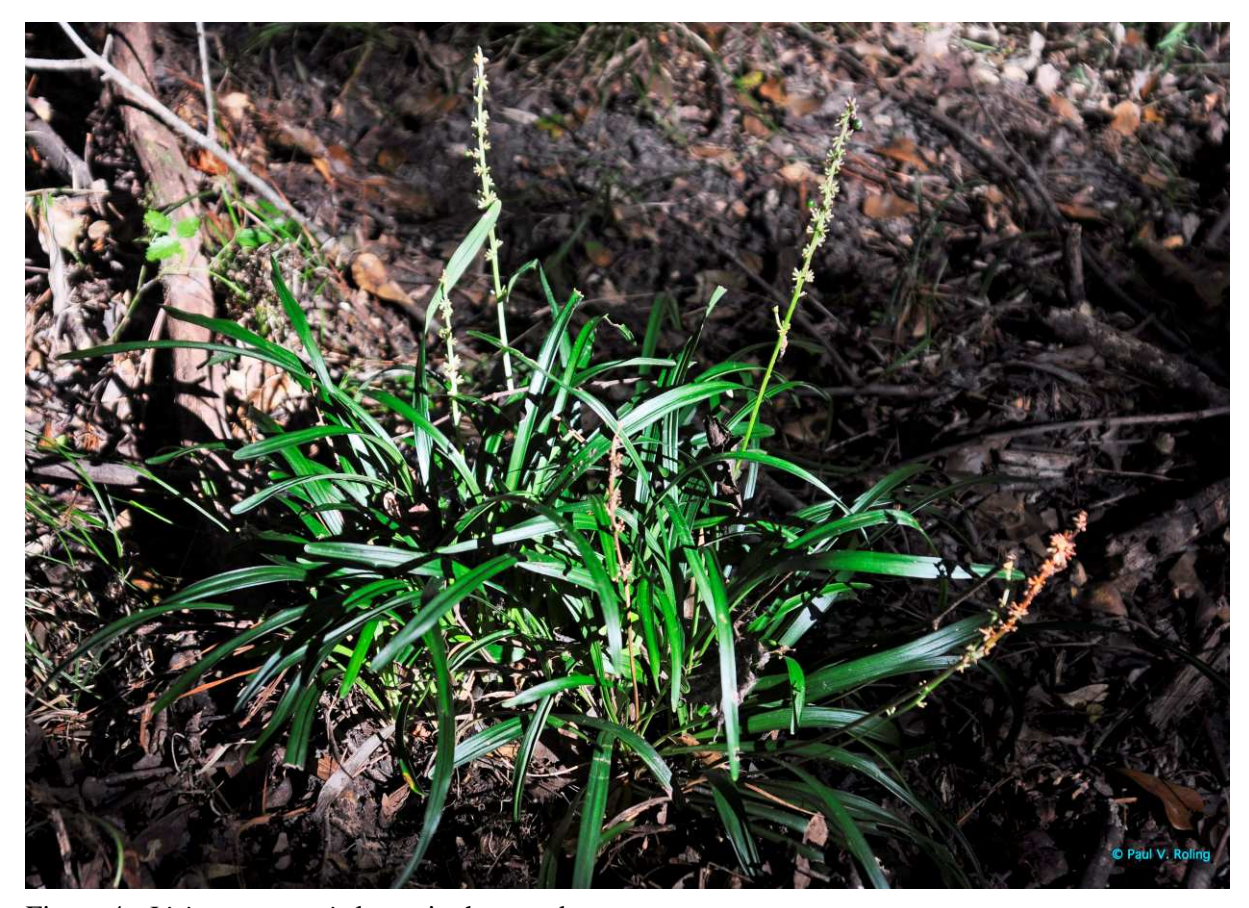
Figure 4. Liriope muscari cluster in the woods.