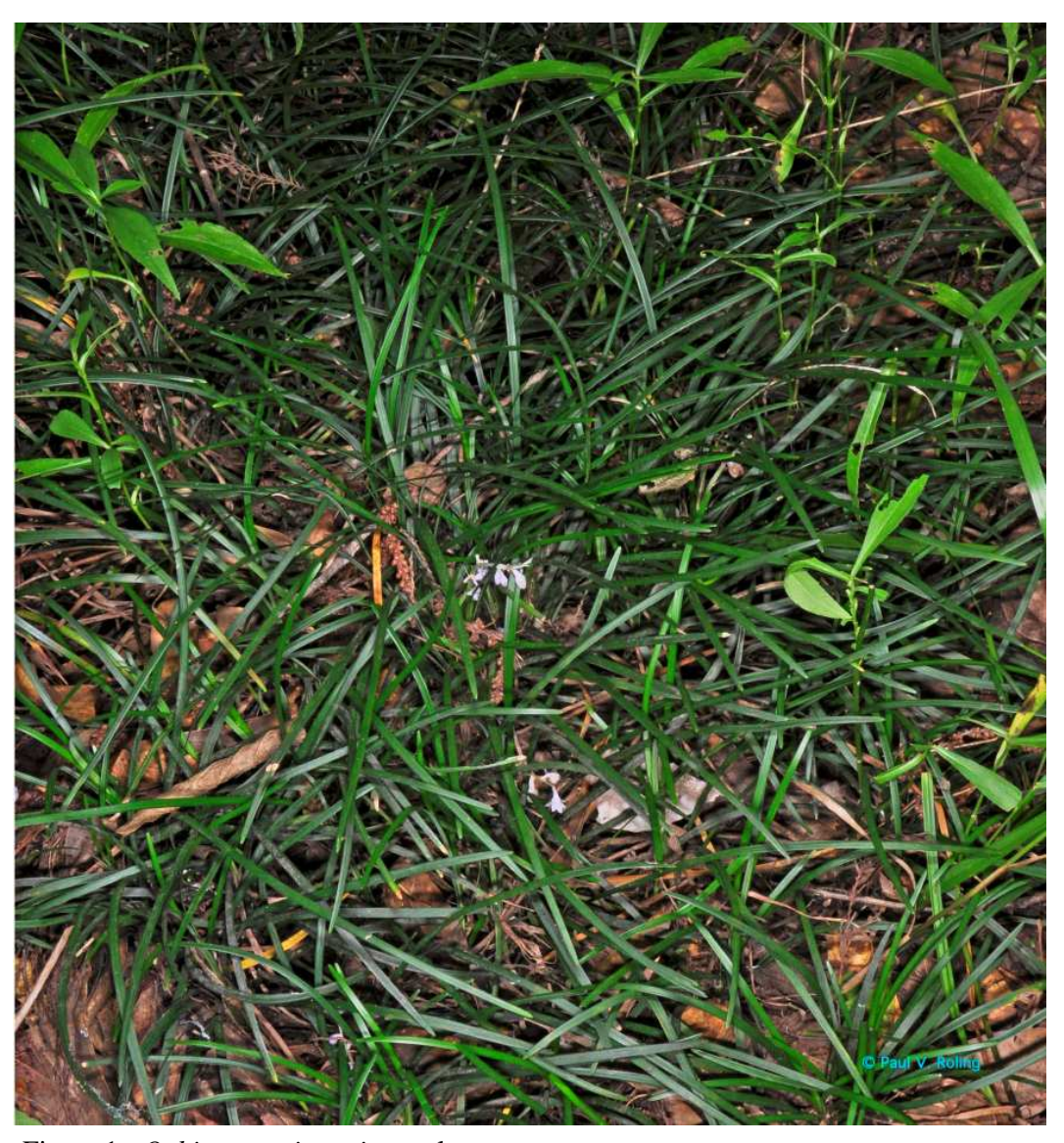
Figure 1. Ophiopogon japonicus colony.

Spaulding, D., W. Barger, and G.L. Nesom. 2010. Liriope and Ophiopogon (Ruscaceae) naturalized in Alabama. Phytoneuron 2010-55: 1–10.