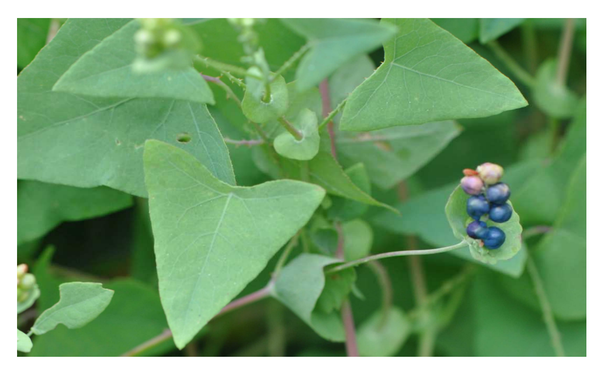
Figure 4. Infructescence and deltoid stem leaves of Persicaria perfoliata . Note the leafy ocreae subtending the fruit and at the nodes of the stem.