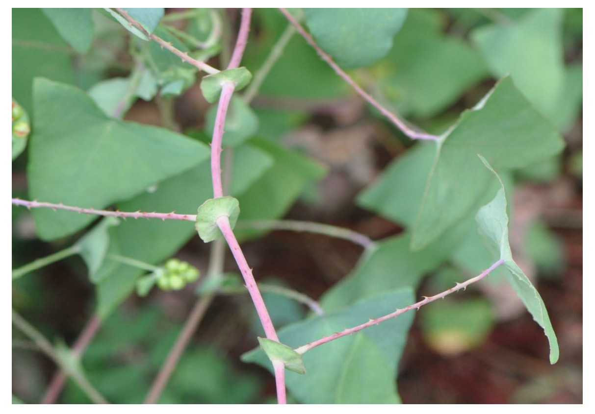
Figure 5. Stem and petioles of Persicaria perfoliata exhibiting retrose prickles. Note that the petiole attachment is peltate (on the abaxial leaf surface) and not at the margin of the leaf.