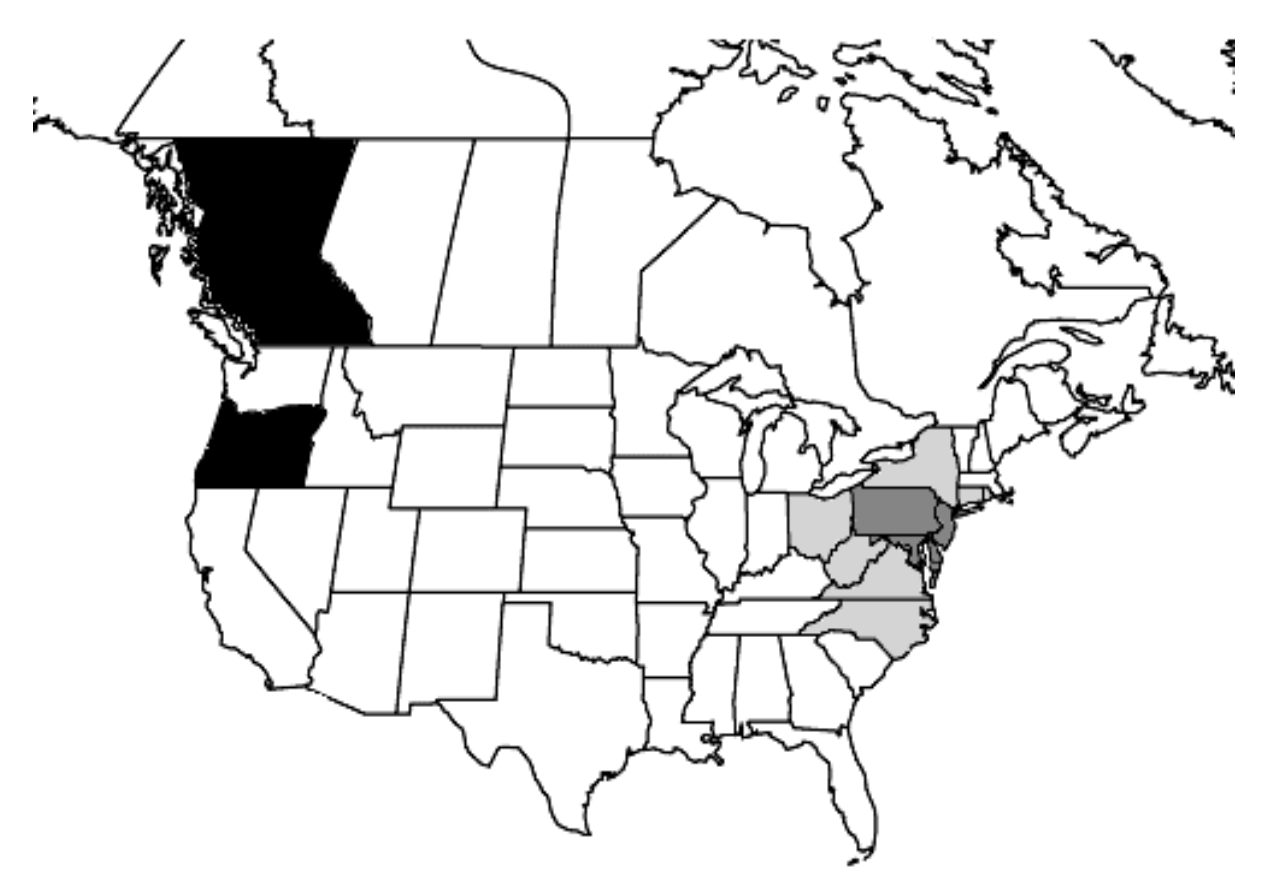
Figure 7. Current distribution of Persicaria perfoliata in North America north of Mexico. Non-established states and provinces (black), and established states, including the District of Columbia, (gray). Areas of greatest concentration (dark gray).