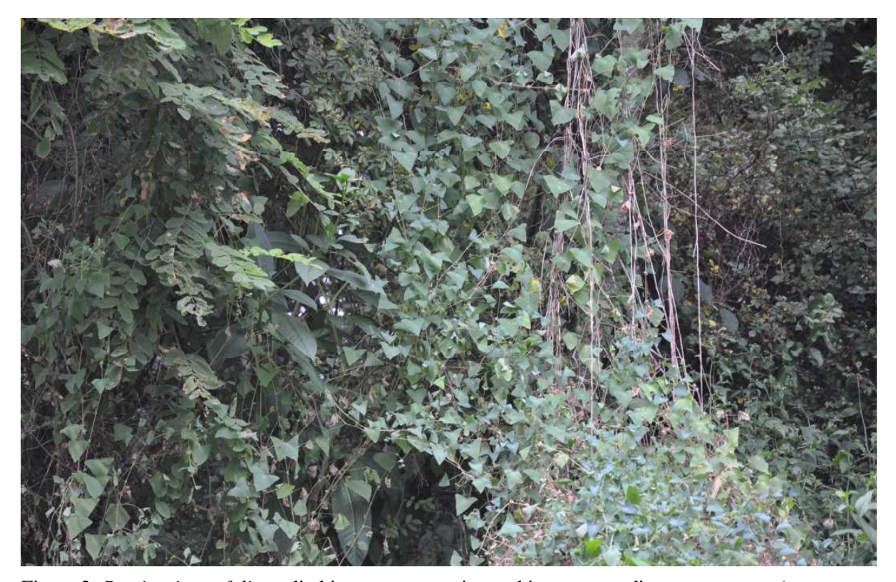
Figure 2. Persicaria perfoliata climbing over vegetation and into surrounding canopy trees (e.g., Robinia pseudoacacia L.).