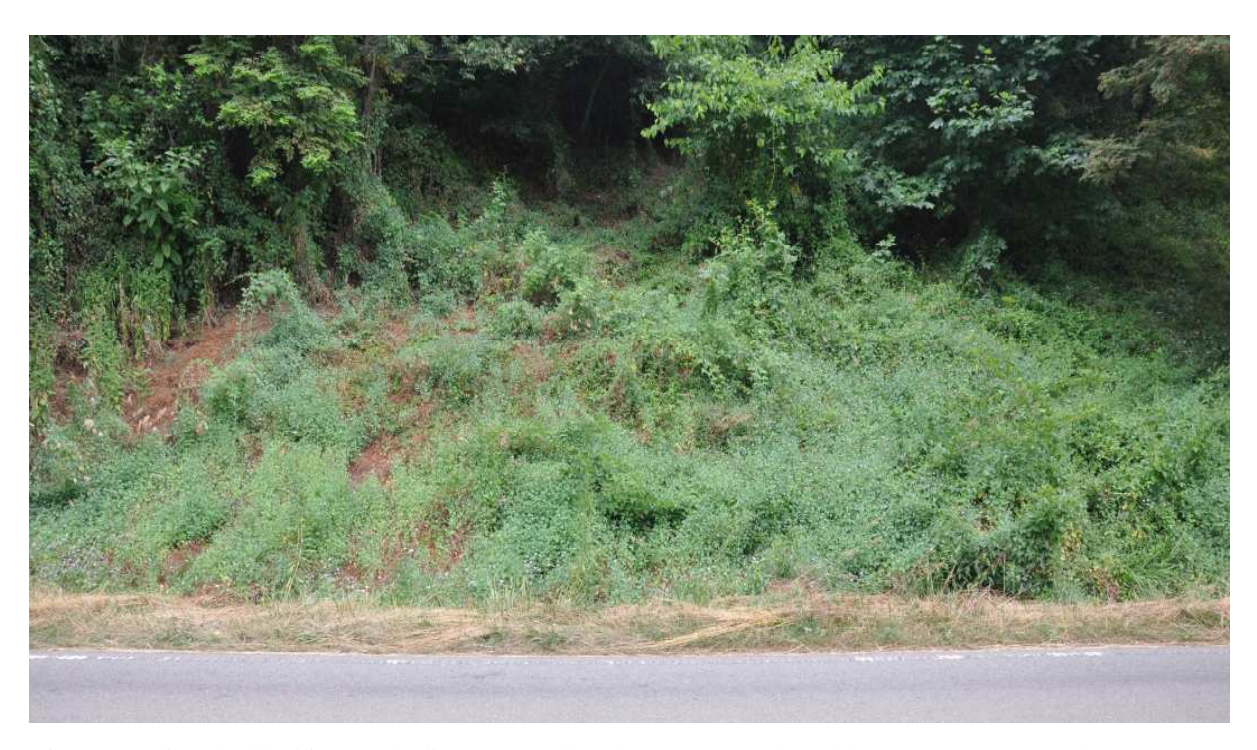
Figure 1. Disturbed habitat and adjacent woodland ecotone enveloped by Persicaria perfoliata .