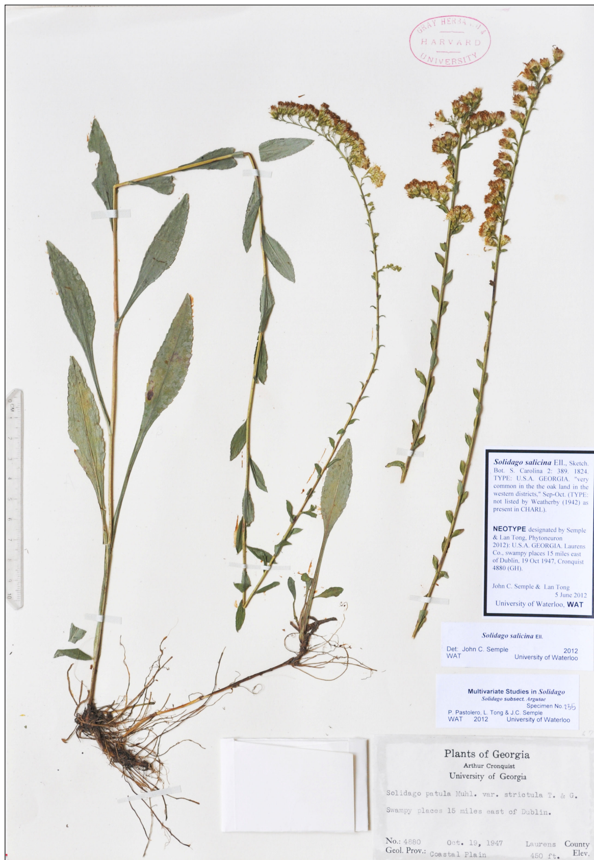
Figure 1. Neotype of Solidago salicina Ell., Cronquist 4880 (GH).