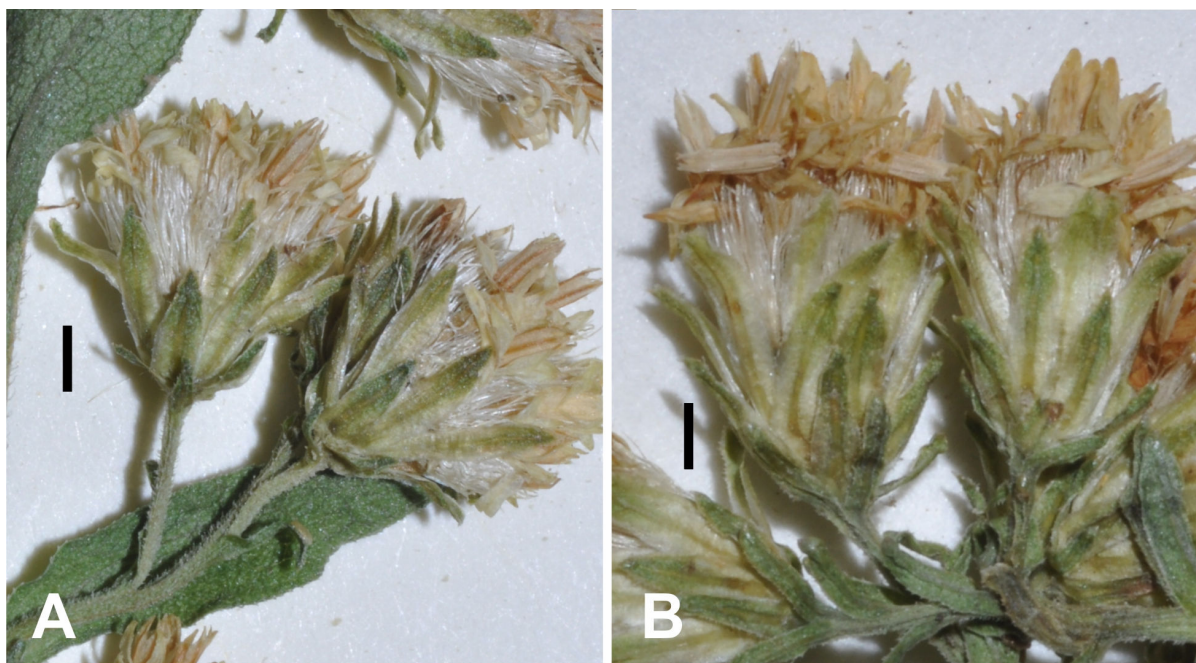
Figure 2. Heads of (A) Solidago patula (Semple 10589 WAT) and (B) Solidago salicina (Thomas et al. 108382 WAT). Scale bars equal 1 mm.

Involucre height is significantly different although the ranges overlap; mean involucre height in Solidago patula is 3.86 mm (range 2.5-6.5 mm); mean involucre height in S. salicina is 6.14 mm (range 3.5-8.8 mm). The difference in involucre height is clear in Fig. 2. The phyllaries of S. patula are often more obtuse and oblong than those of S. salicina . There is little difference in the number of rays, while S. patula has an average of 11.8 disc florets per head versus 9.3 disc florets per head in S. salicina .