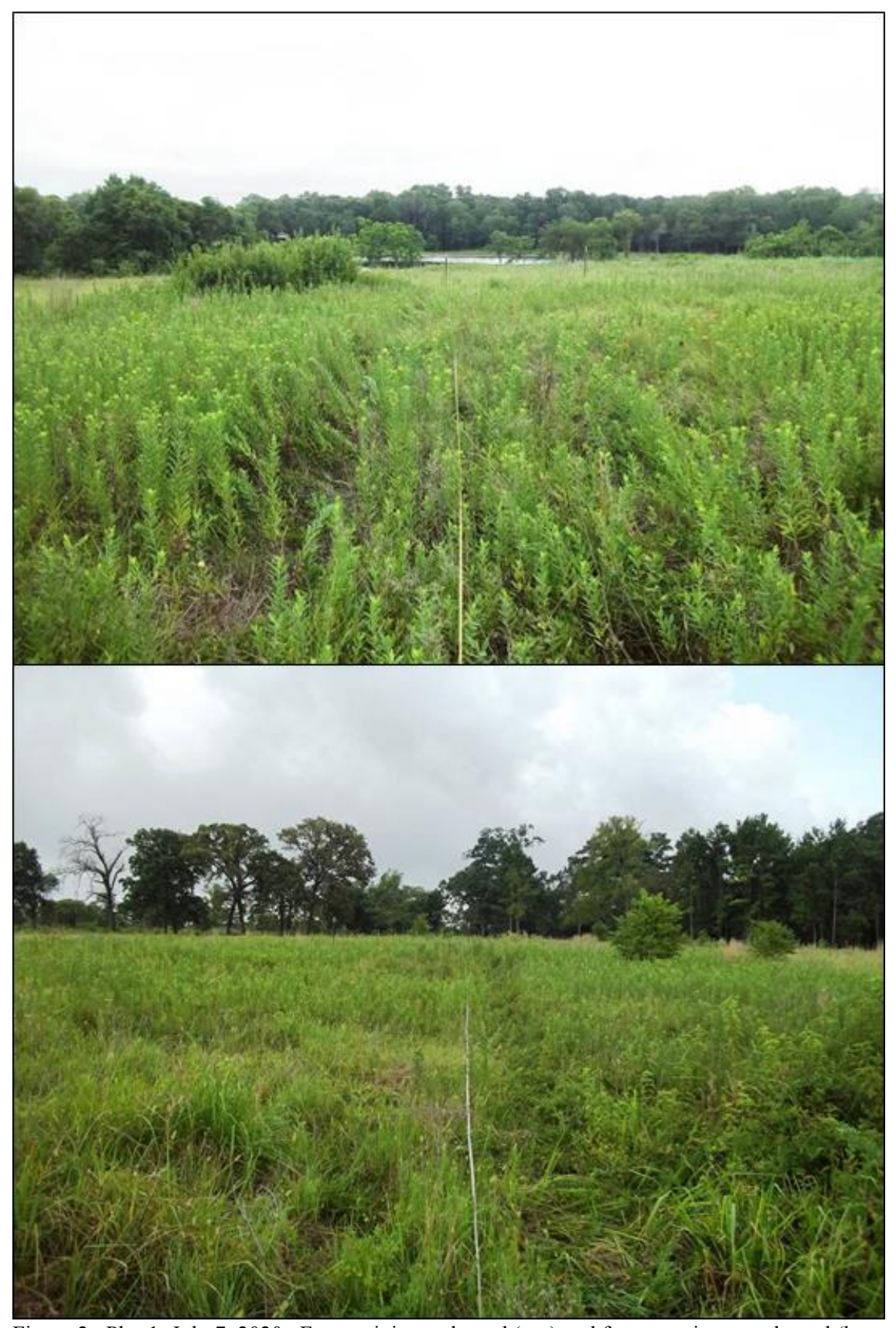
Figure 2. Plot 1: July 7, 2020. From origin northward (top) and from terminus southward (bottom).