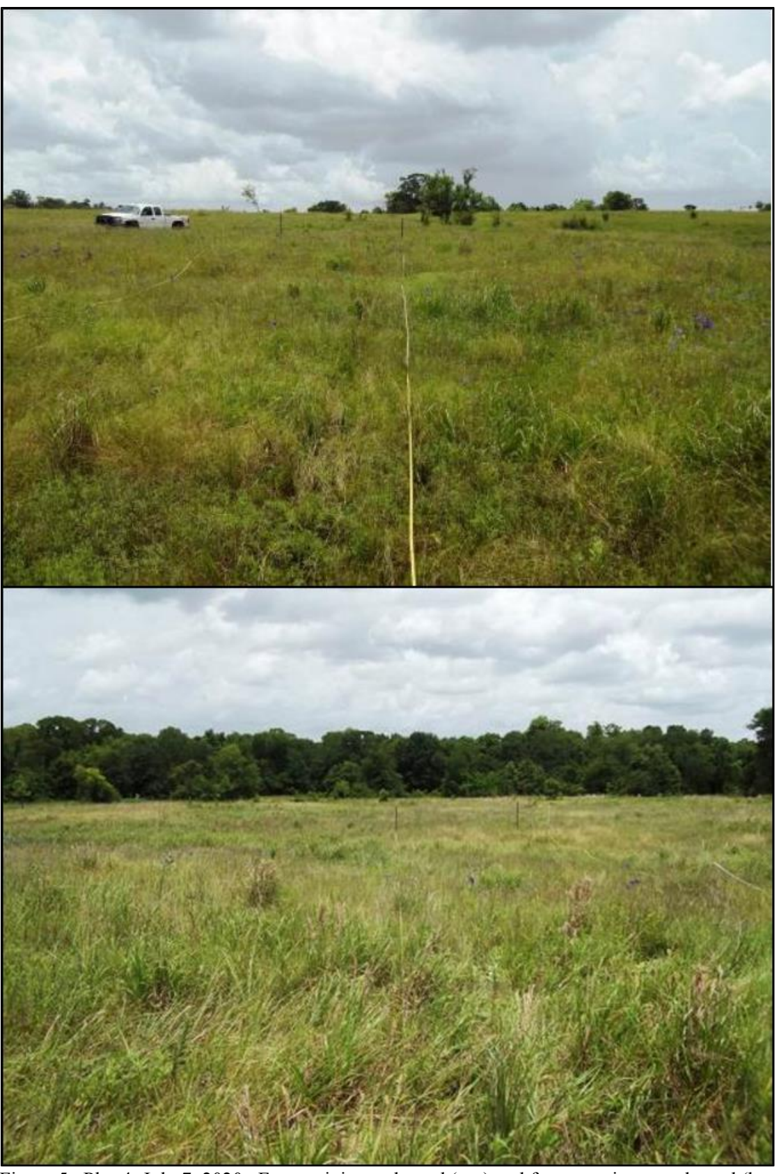
Figure 5. Plot 4: July 7, 2020. From origin northward (top) and from terminus southward (bottom).