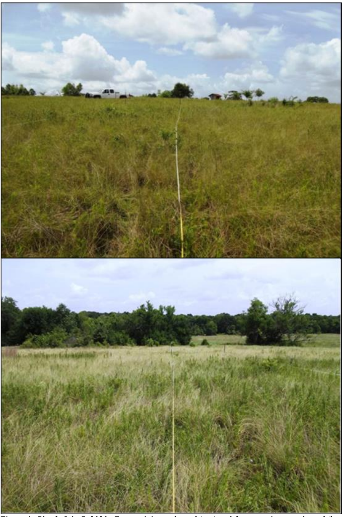
Figure 4. Plot 3: July 7, 2020. From origin northward (top) and from terminus southward (bottom).