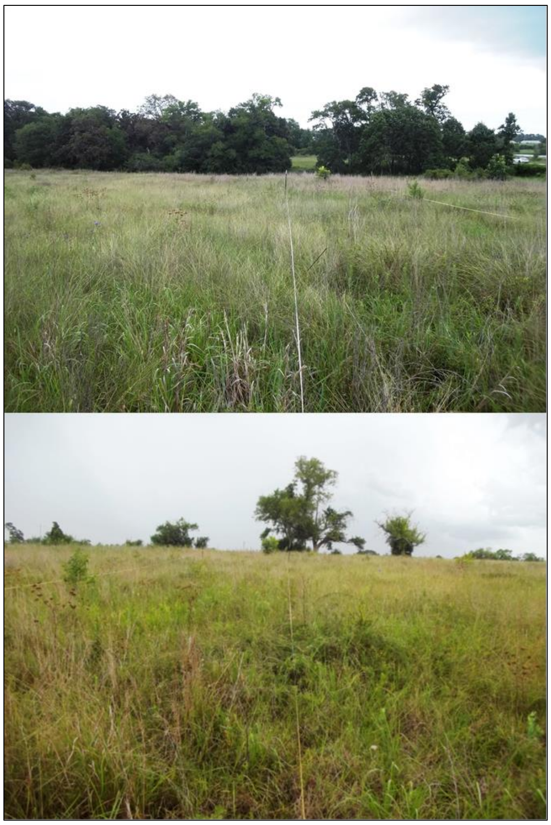
Figure 6. Plot 5: July 7, 2020. From origin northward (top) and from terminus southward (bottom).