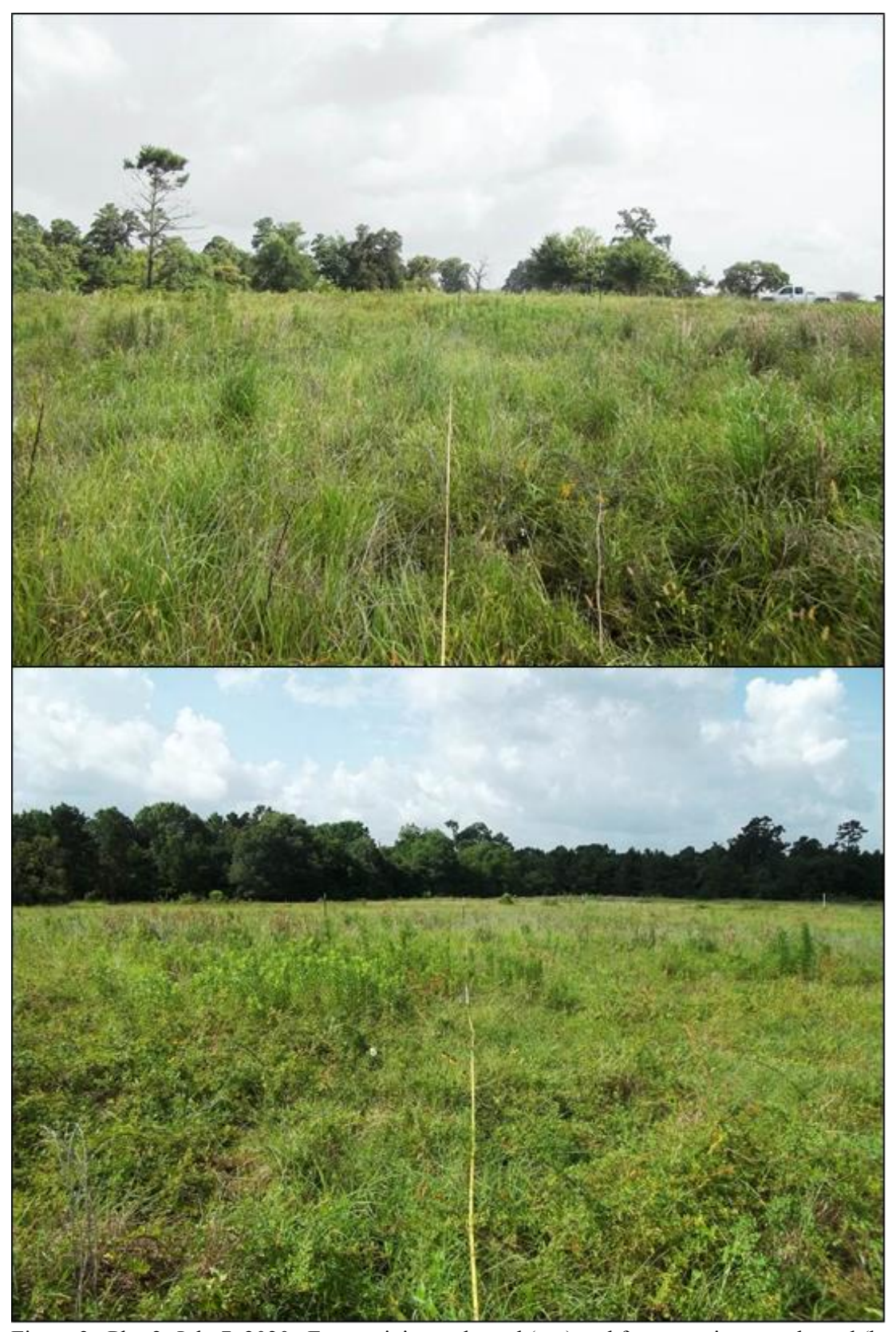
Figure 3. Plot 2: July 7, 2020. From origin northward (top) and from terminus southward (bottom).