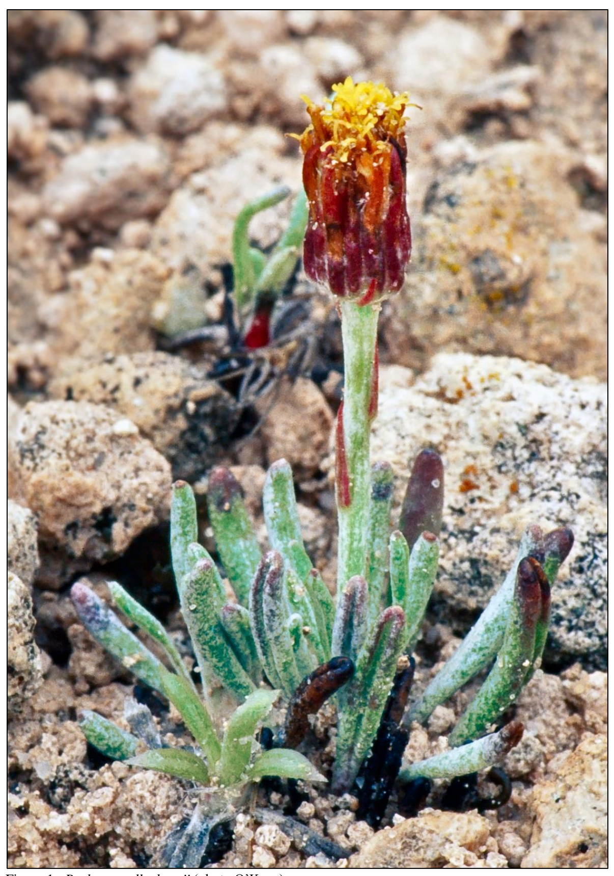
Figure 1. Packera spellenbergii.