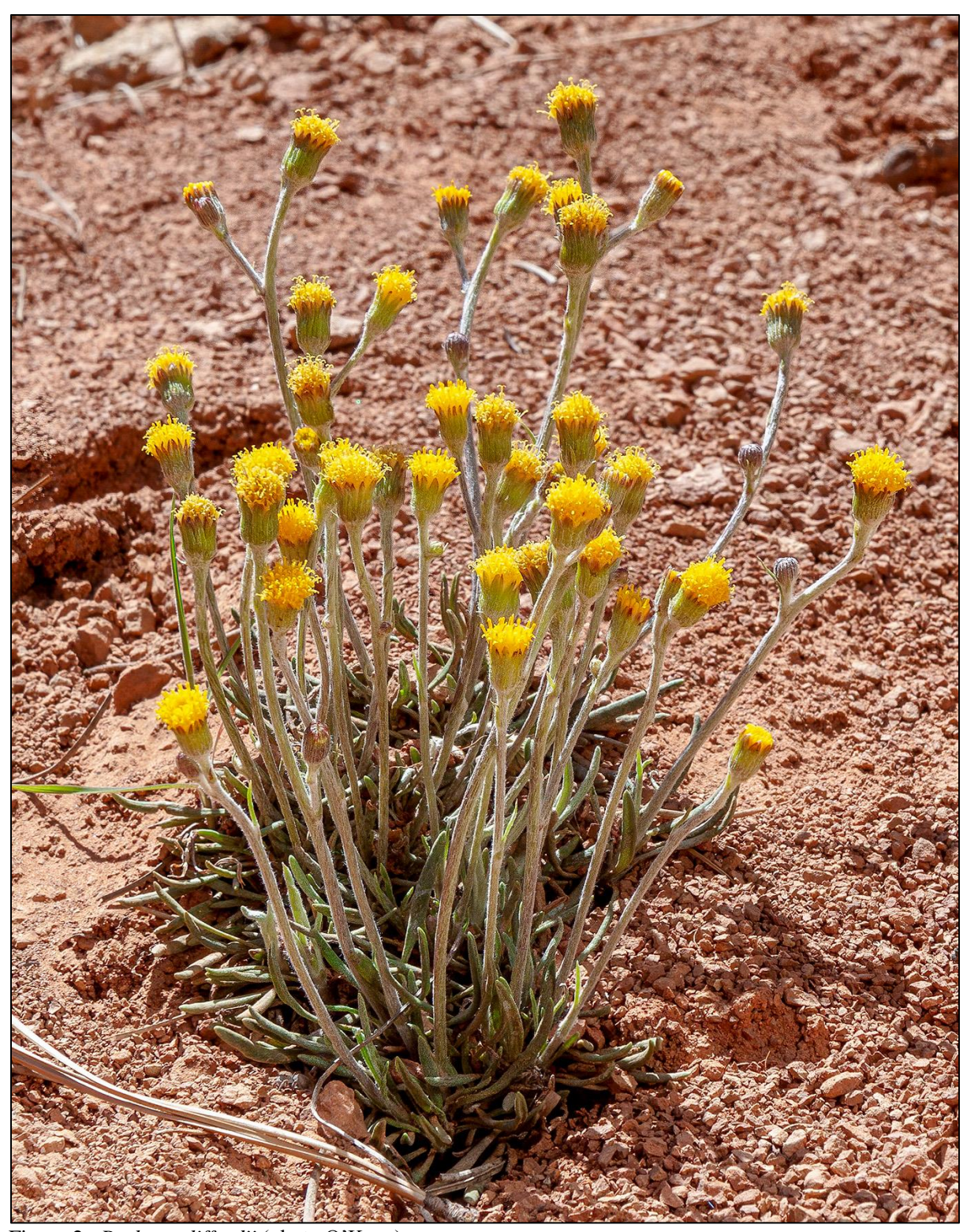
Figure 2. Packera cliffordii.