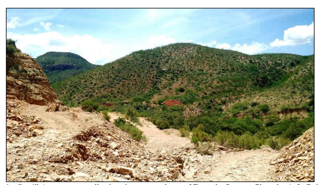
Figure 1. Castilleja tomentosa collection site east-southeast of Esqueda, Sonora.

Outside of Sonora, Castilleja tomentosa is known only from Hidalgo Co., New Mexico (Egger 2012). Our 2017 collection from Esqueda was the first from Sonora in 166 years!