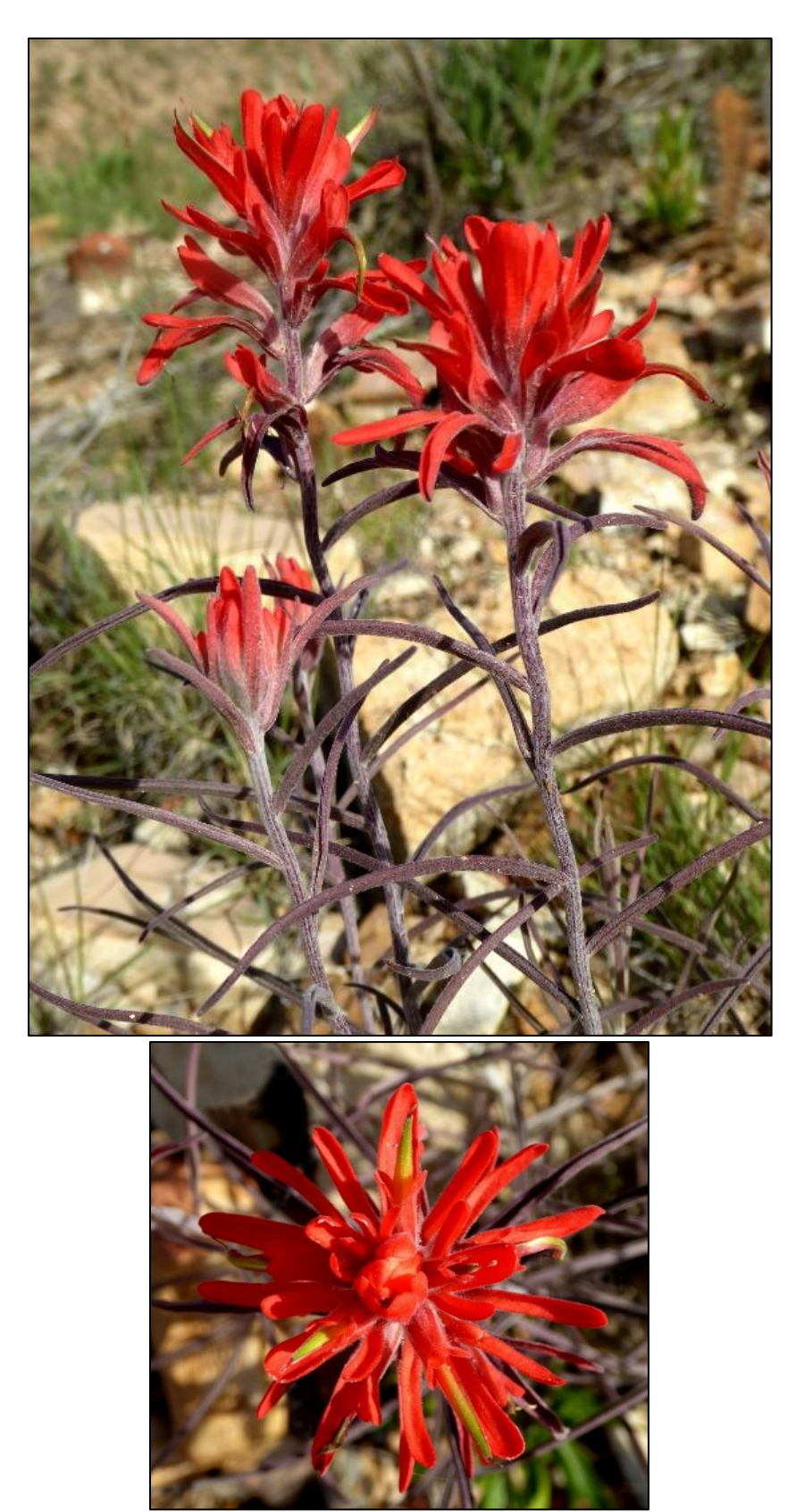
Figure 2. Castilleja tomentosa from east-southeast of Esqueda, Sonora. Photos by A.L. Reina-G., 17 August 2017.