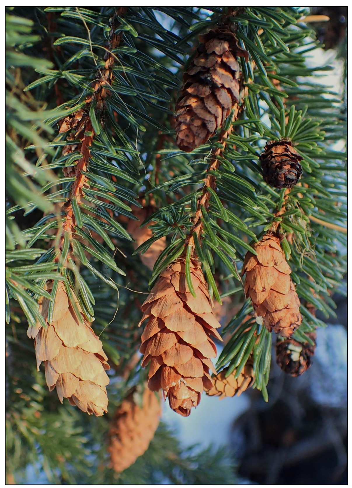
Figure 1. Picea x darwyniana — cones and a foliar branch of the tree from which the type was collected. Clearwater Valley, British Columbia.