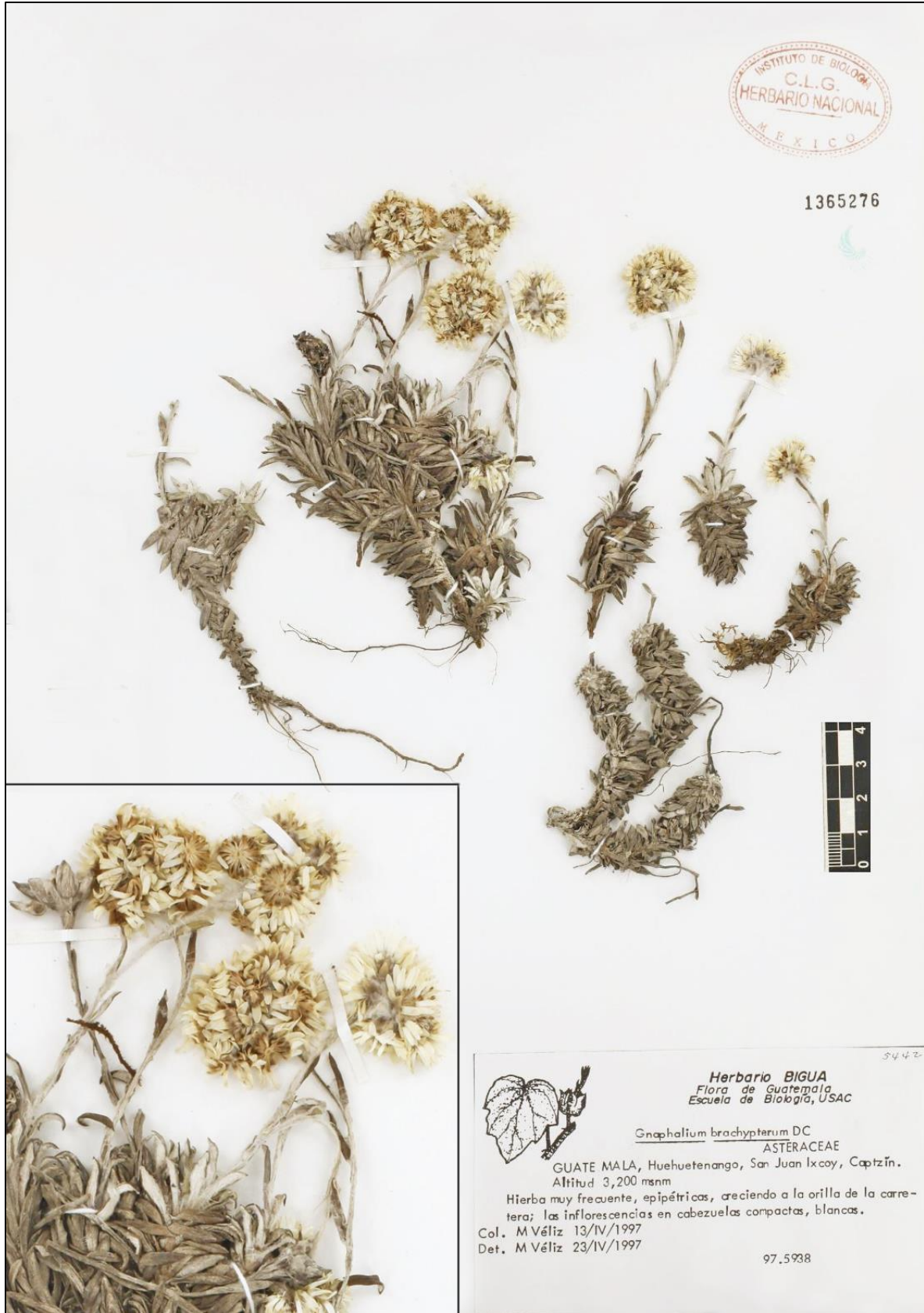
Figure 2. Gnaphaliothamus nesomii . Véliz 97.5938 (MEXU).