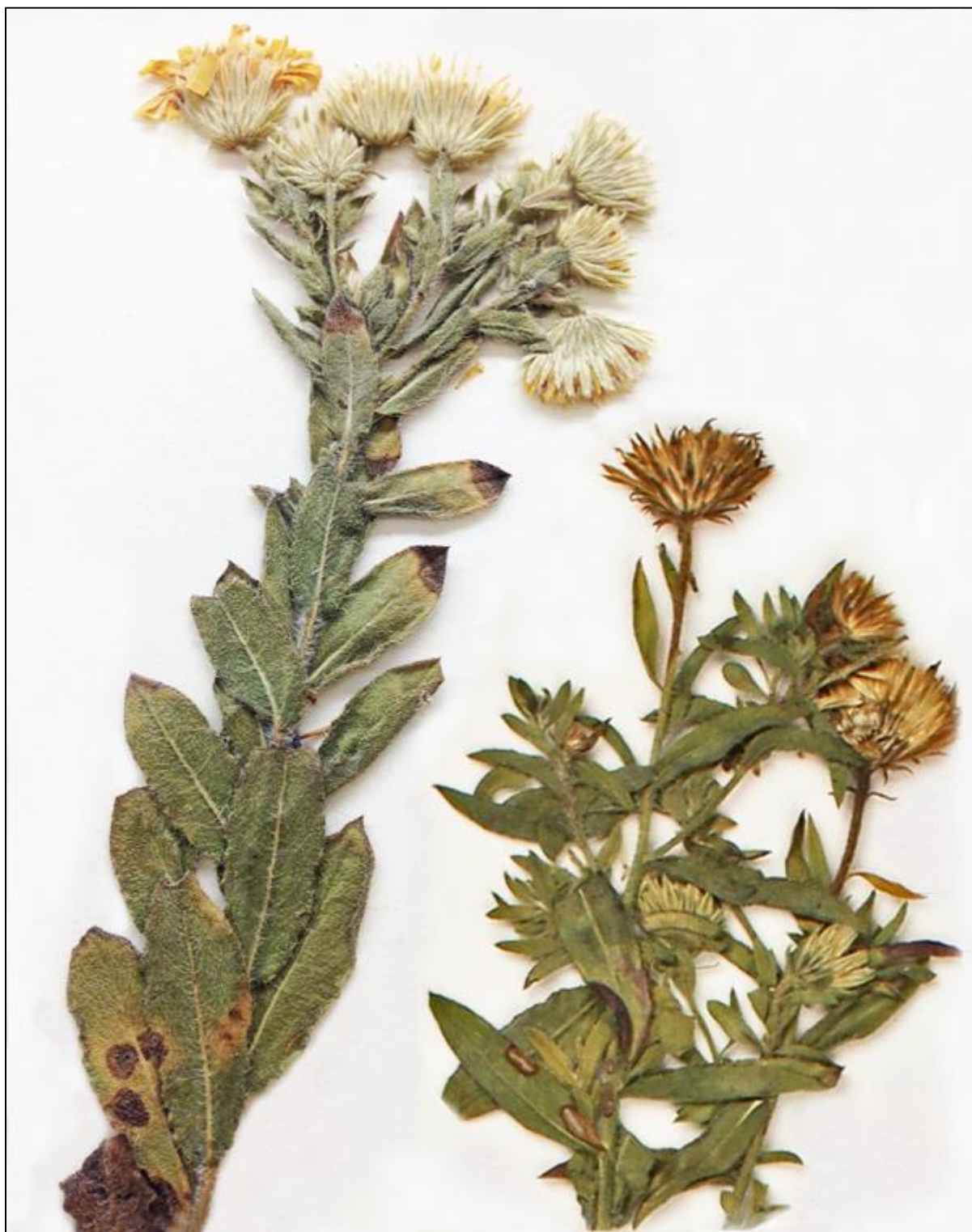
Figure 17. Heterotheca marcbakeri . Left, isotype (OBI 53793). Right, holotype (ASU).