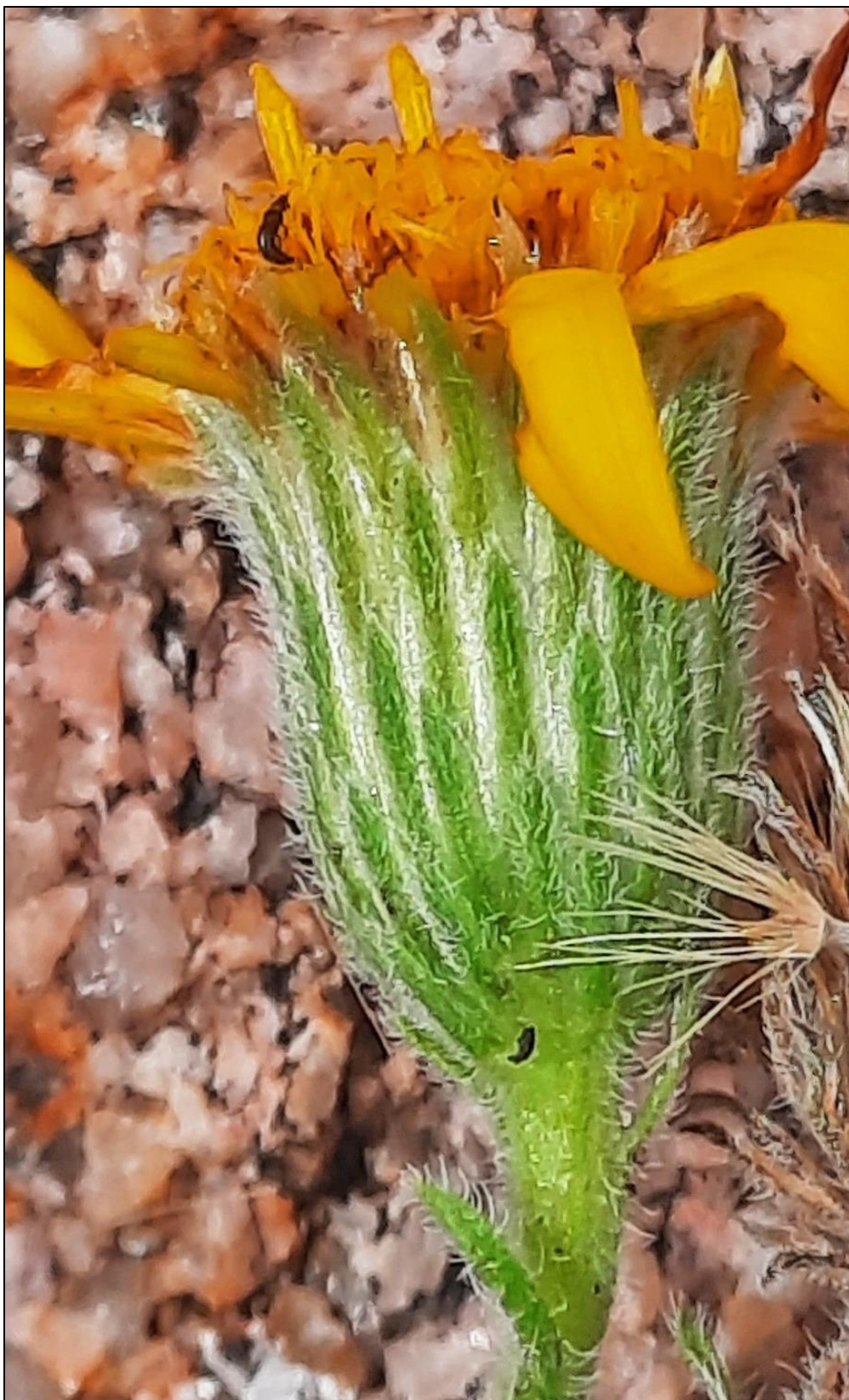
Figure 9. Heterotheca marcbakeri involucre. Apache Creek Wilderness Area. Photo by M. Baker, 7 Oct 2021.