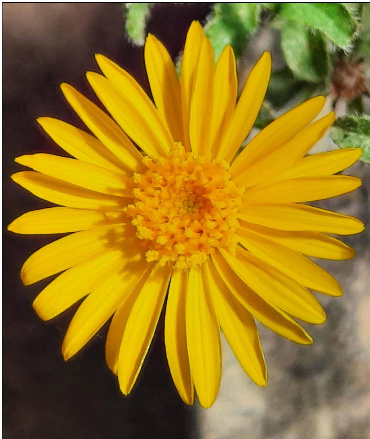
Figure 13. Heterotheca marcbakeri . Rays 29. Head from greenhouse-grown plant from the type locality.