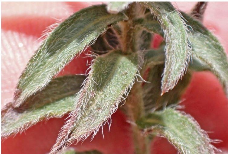
Figure 6. Heterotheca marcbakeri . Apache Creek Wilderness Area. iNaturalist photo by "ethan-k" (Ethan), 17 Aug 2023.