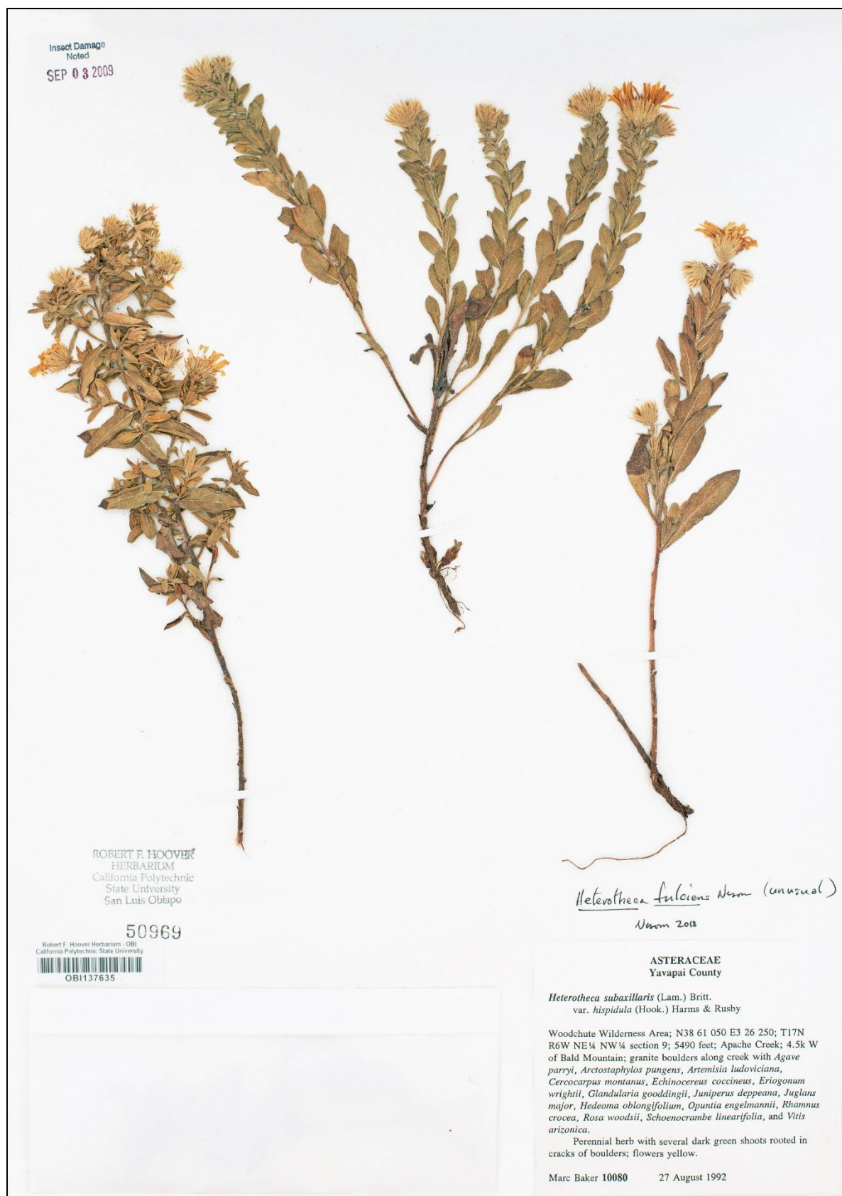
Figure 16. Heterotheca marcakeri . Baker 10080, isotype (OBI 50969).