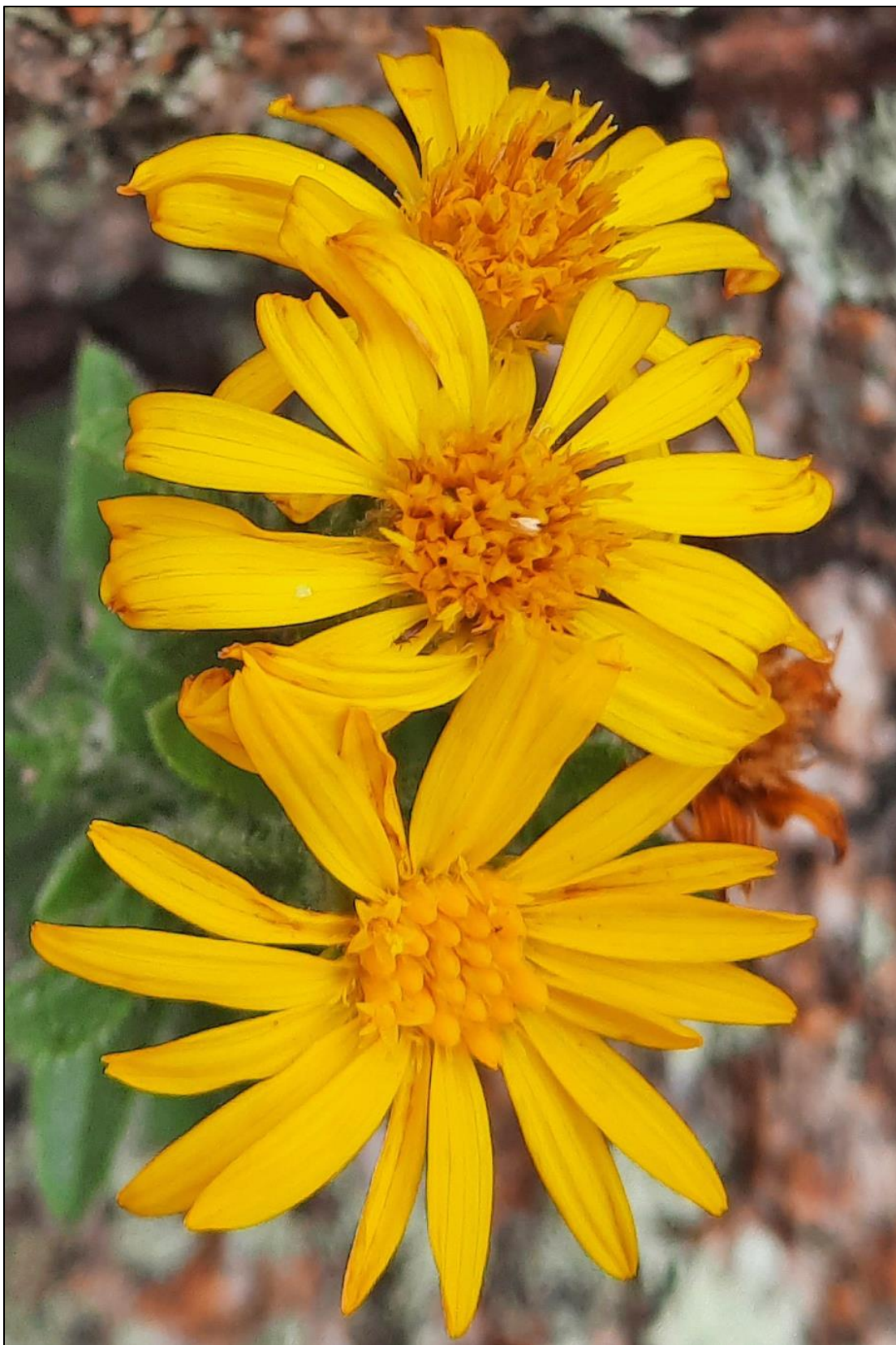
Figure 12. Heterotheca marcbakeri . Rays ca. 16-18. Apache Creek Wilderness Area. Photo by M. Baker, 7 Oct 2021.