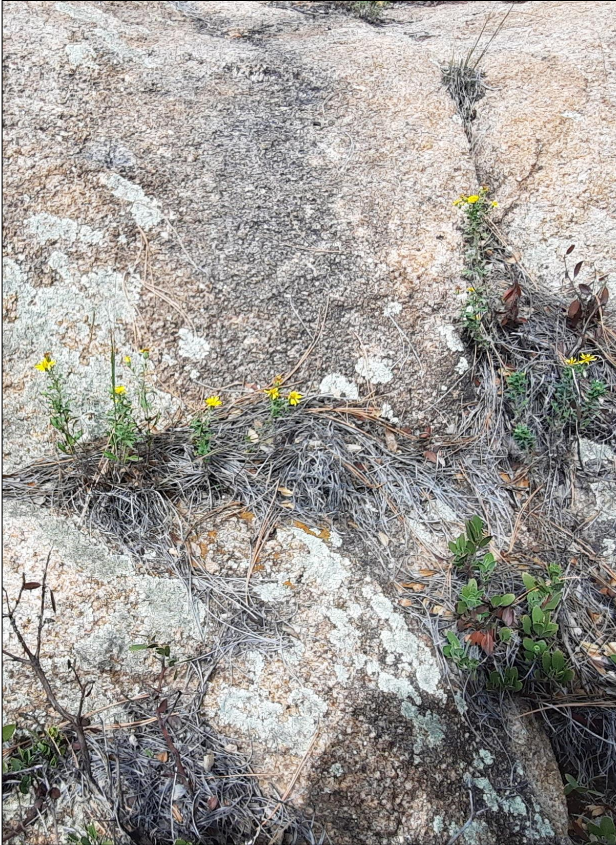
Figure 3. Heterotheca marcbakeri — detail of Figure 2.