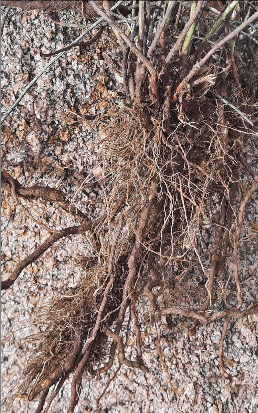
Figure 7. Heterotheca marcbakeri roots. Apache Creek Wilderness Area. Photo by M. Baker, 7 Oct 2021.