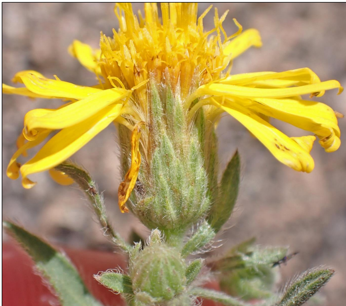
Figure 11. Heterotheca marcbakeri . Apache Creek Wilderness Area. iNaturalist photo by "ethan-k" (Ethan), 17 Aug 2023.