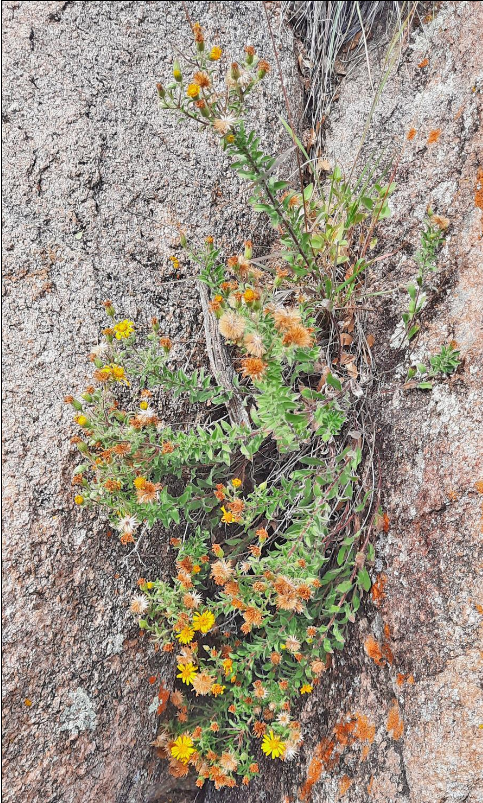
Figure 4. Heterotheca marcbakeri in crack of granite outcrop, Apache Creek Wilderness Area. Photo by M. Baker, 7 Oct 2021.