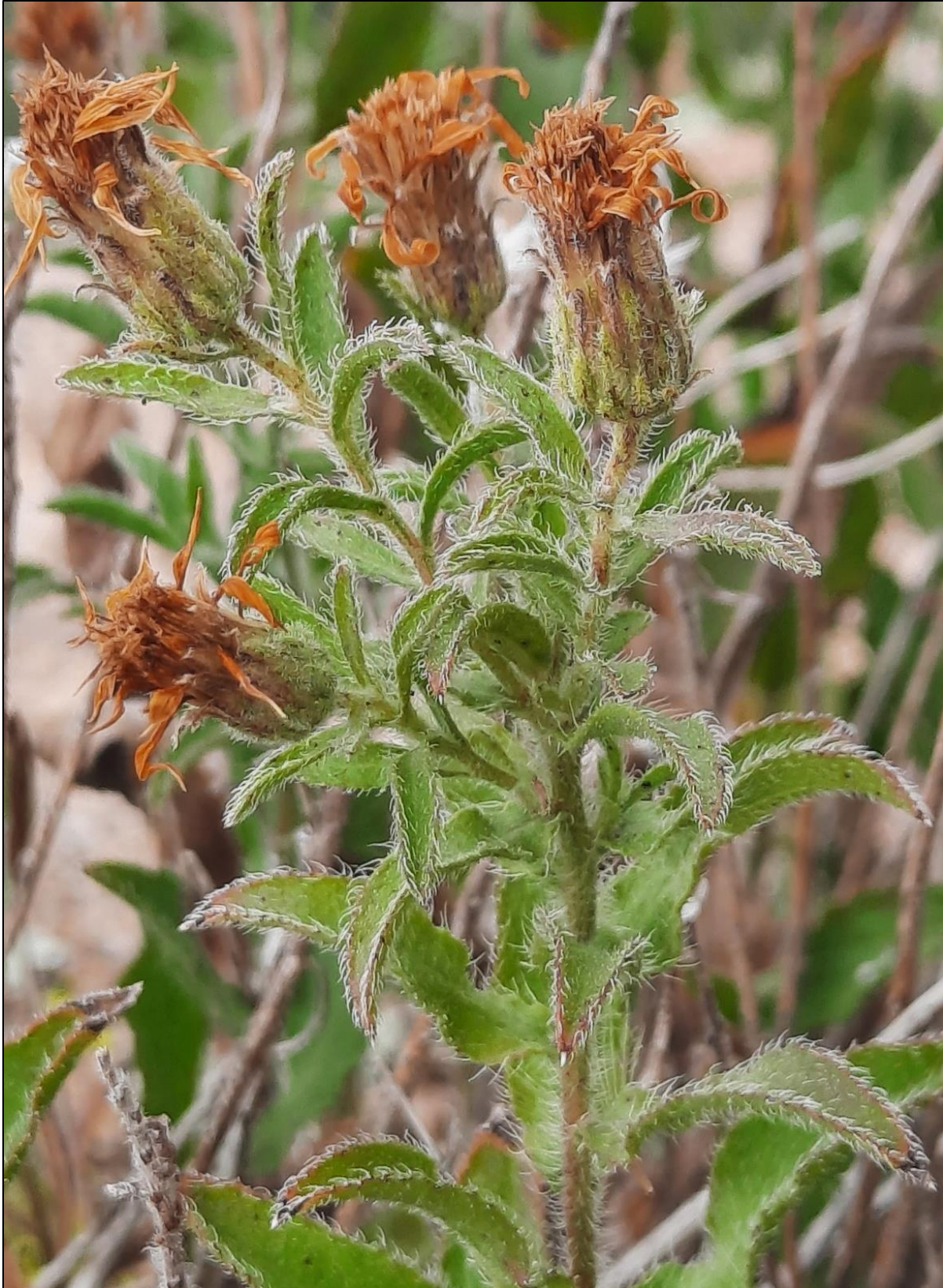
Figure 8. Heterotheca marcbakeri . Apache Creek Wilderness Area. Photo by M. Baker, 7 Oct 2021.