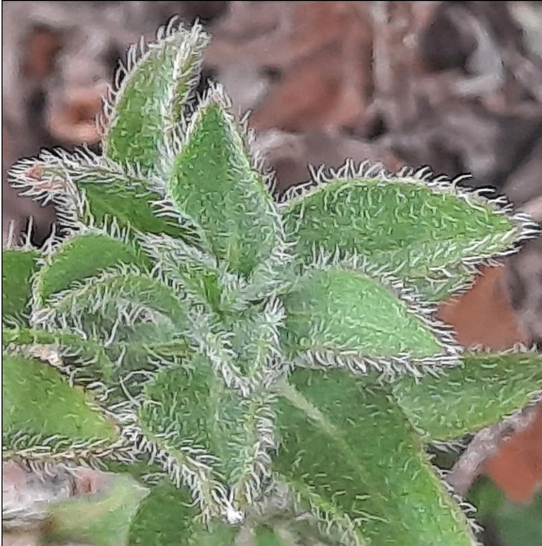
Figure 5. Heterotheca marcbakeri . Apache Creek Wilderness Area. Photo by M. Baker, 7 Oct 2021.