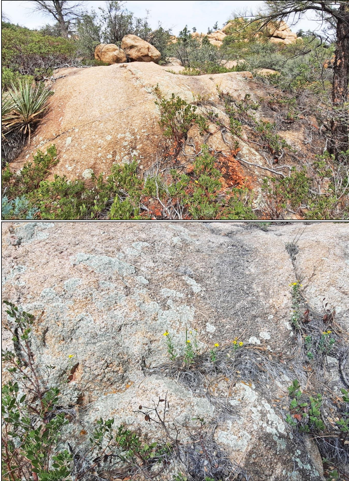
Figure 2. Heterotheca marcbakeri in cracks of granite outcrops, Apache Creek Wilderness Area. 7 Oct 2021.