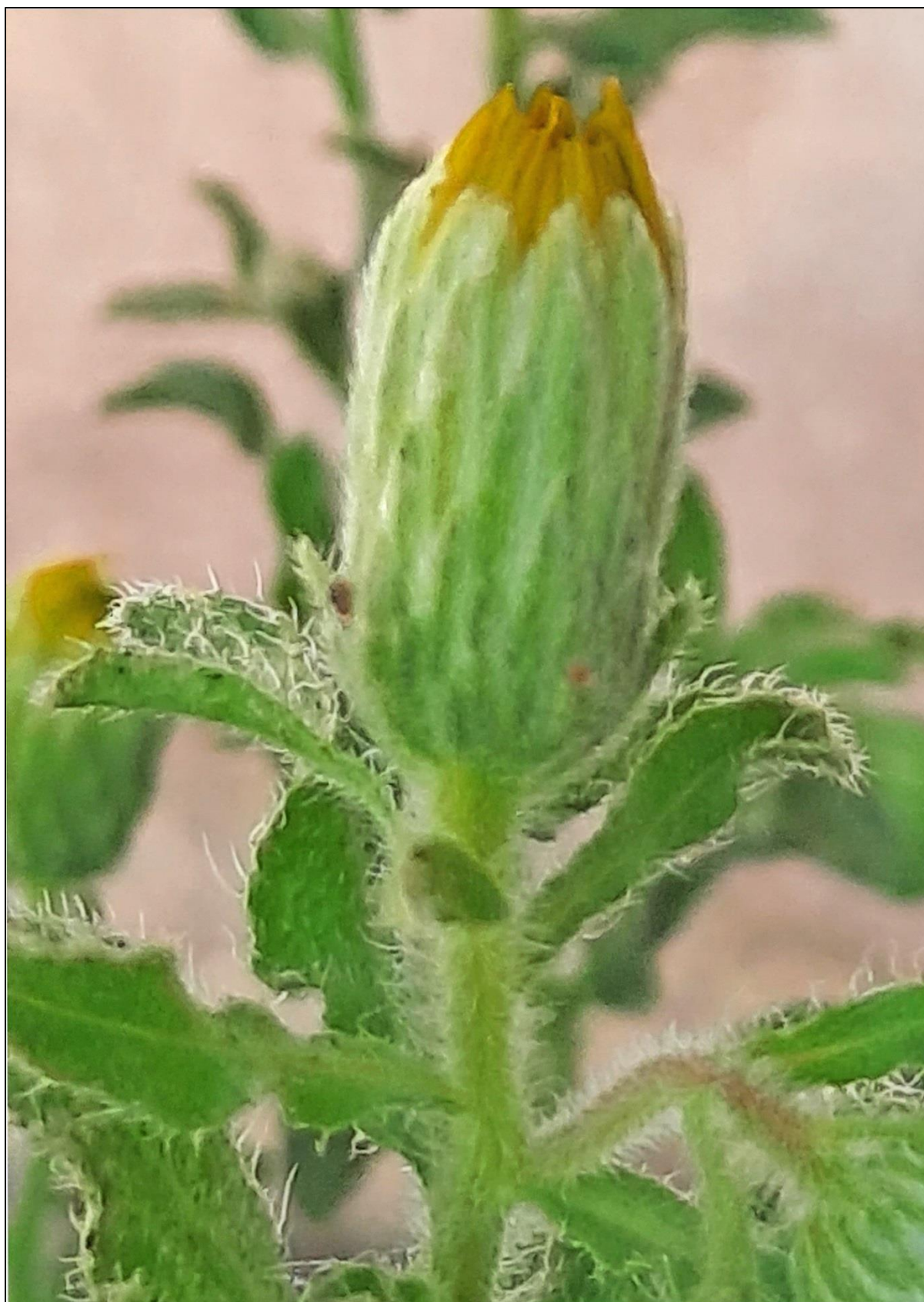
Figure 10. Heterotheca marcbakeri . Bud from greenhouse-grown plant from the type locality.