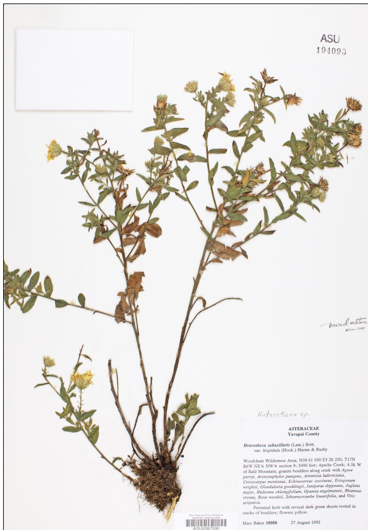
Figure 14. Heterotheca marcbakeri . Baker 10080, holotype (ASU).