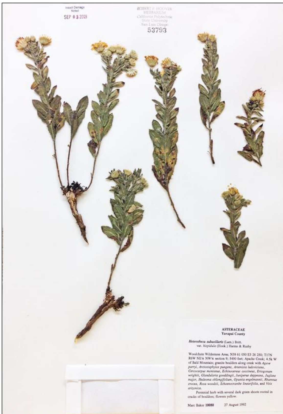
Figure 15. Heterotheca marcobakeri . Baker 10080, isotype (OBI 53793).